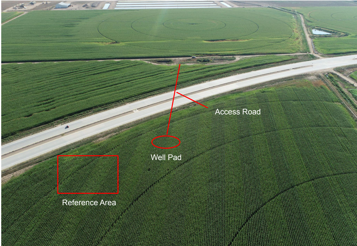
Photo 2. Overview photo of the well pad, access road and reference area taken from the western edge facing east using a drone. Note: well pad and access road appear consistent with adjacent crop reference area.