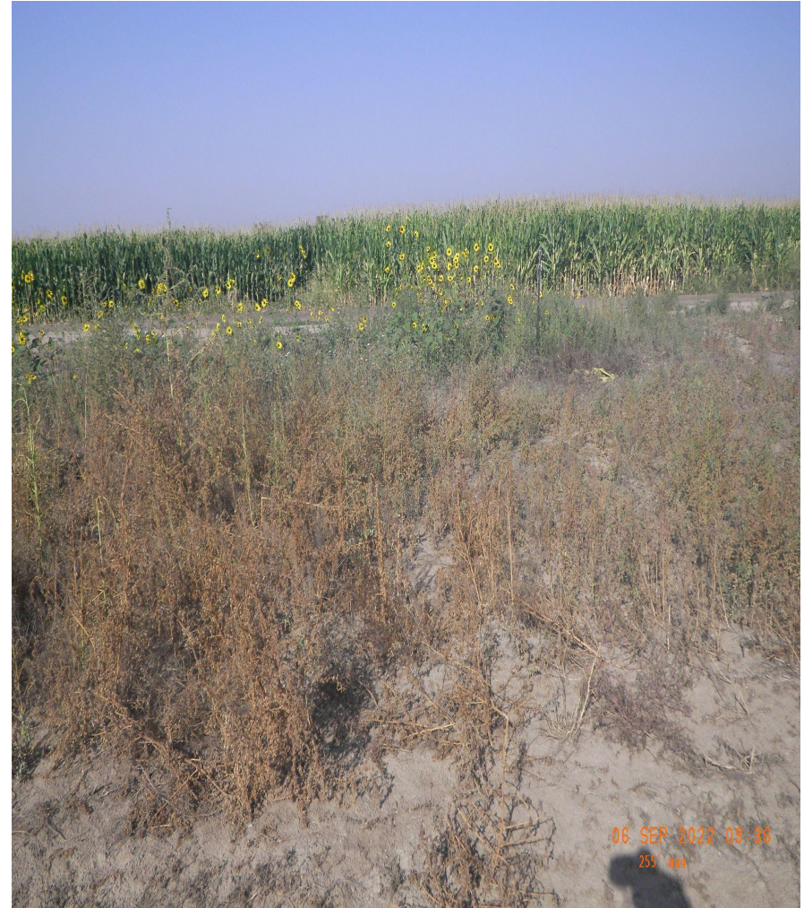
Photo 5. Cardinal photos taken from the middle of the tank battery. Left photo facing south, right photo facing west. Note: tank battery has large pile of manure and is dominated by kochia.