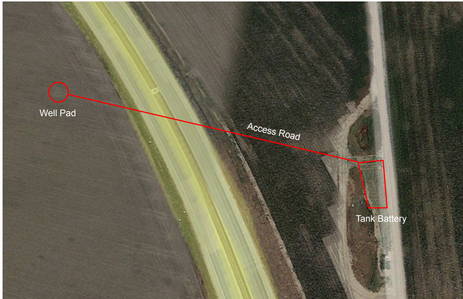
Photo 1. 2021 aerial imagery of the well pad, access road and tank battery.