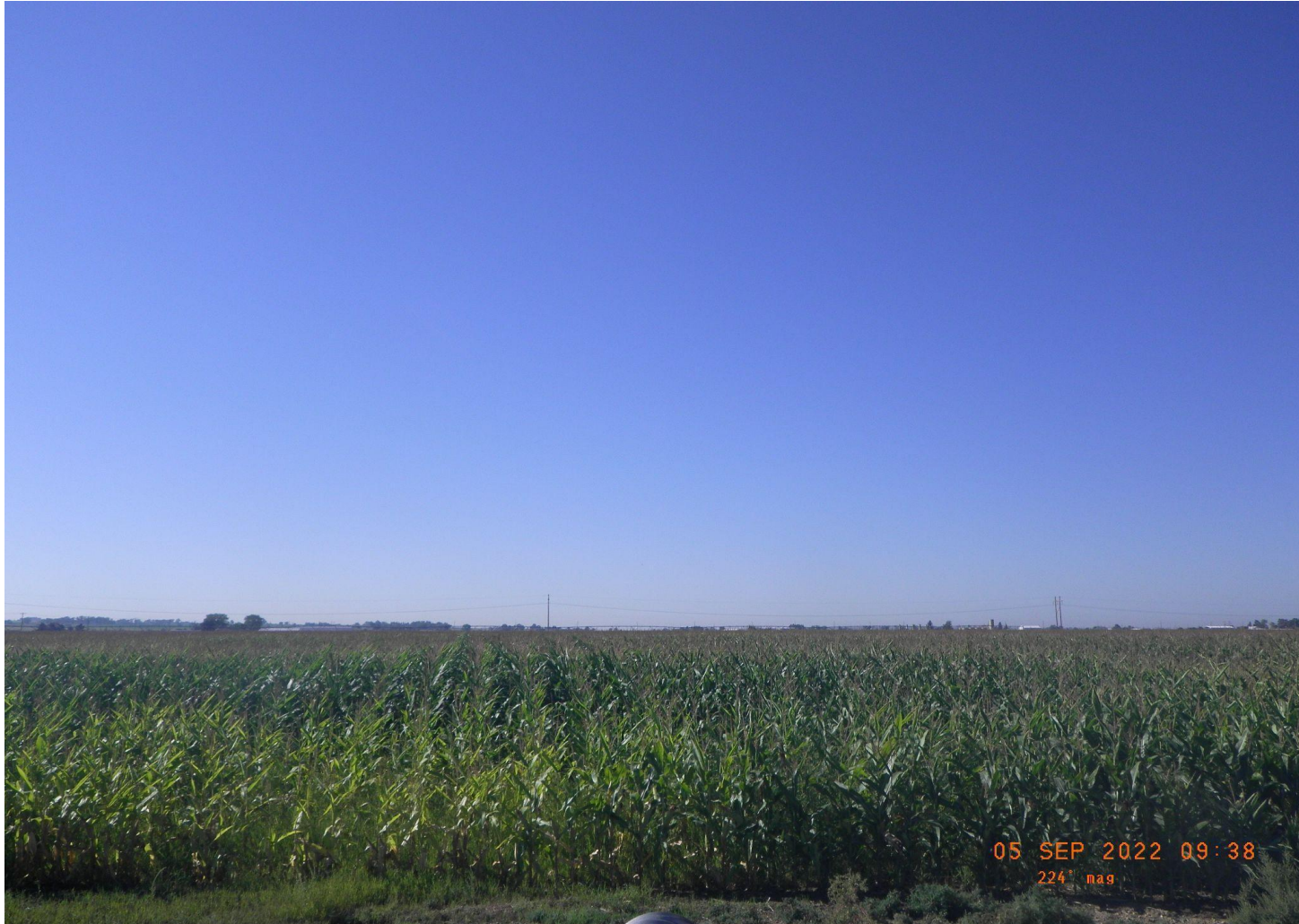
Photo 2. Overview photo of the well pad. Note: site was in a no fly zone so photo was taken from the top of a vehicle. No obvious evidence of crop stunting or oil/gas operations.