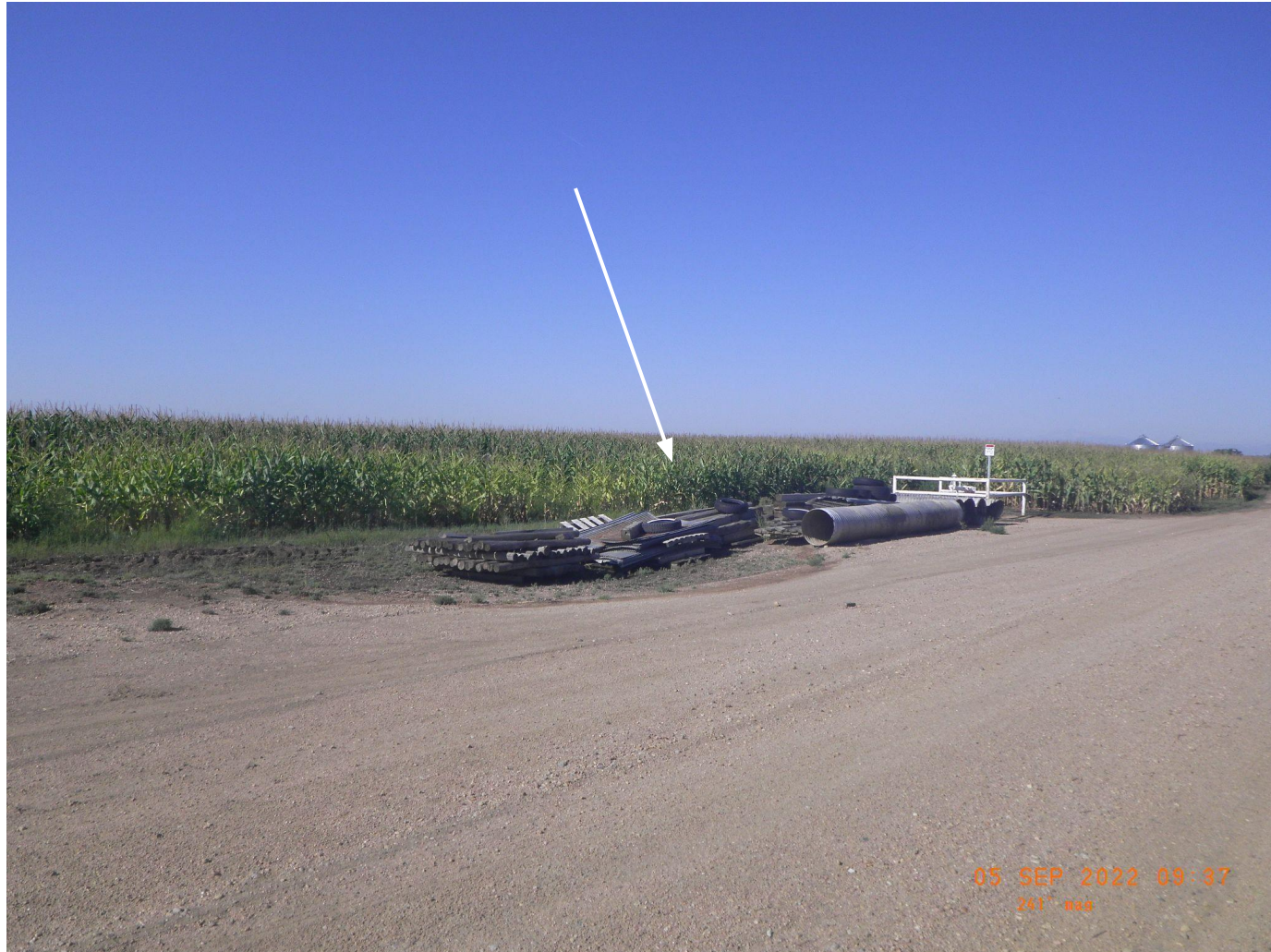
Photo 3. Overview photo of the tank battery taken at ground level from the eastern edge facing west. Note: tank battery remains with gravel and old culverts/storage.