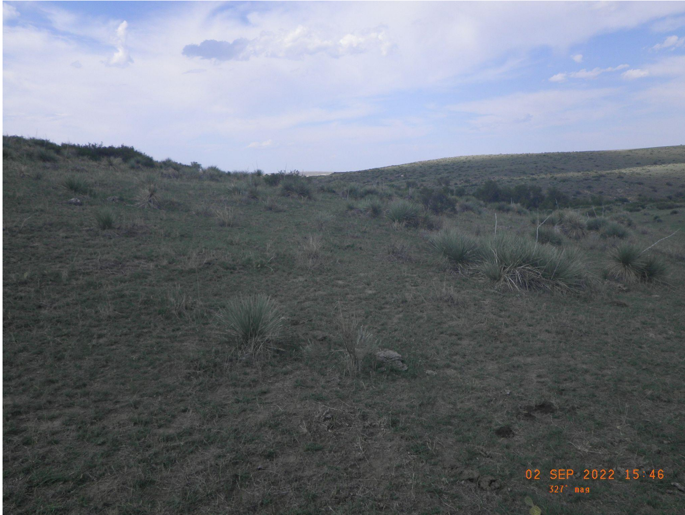
Photo 5. Well pad reference area.