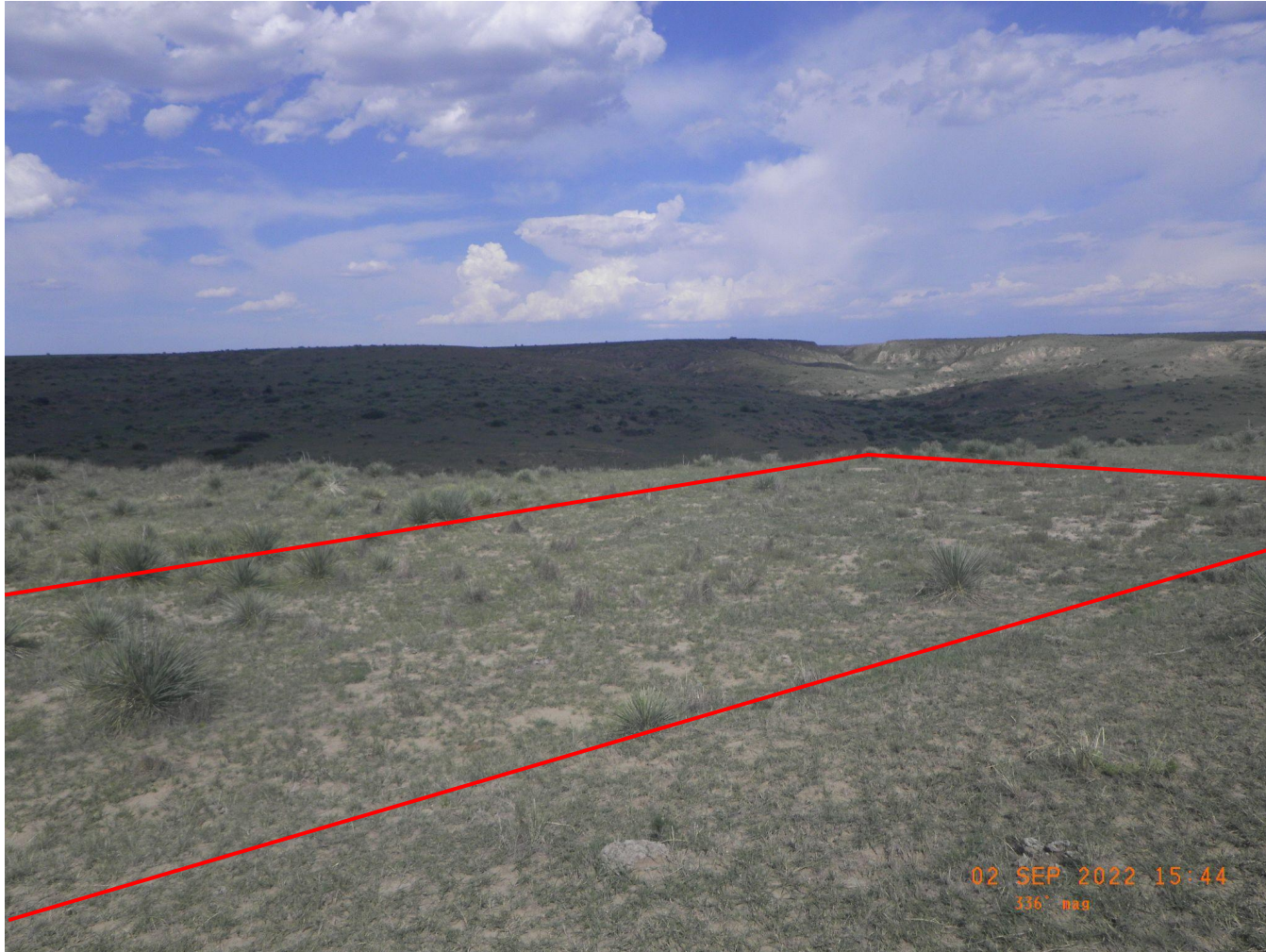
Photo 2. Overview photo of the well pad taken at ground level from the western edge facing east.