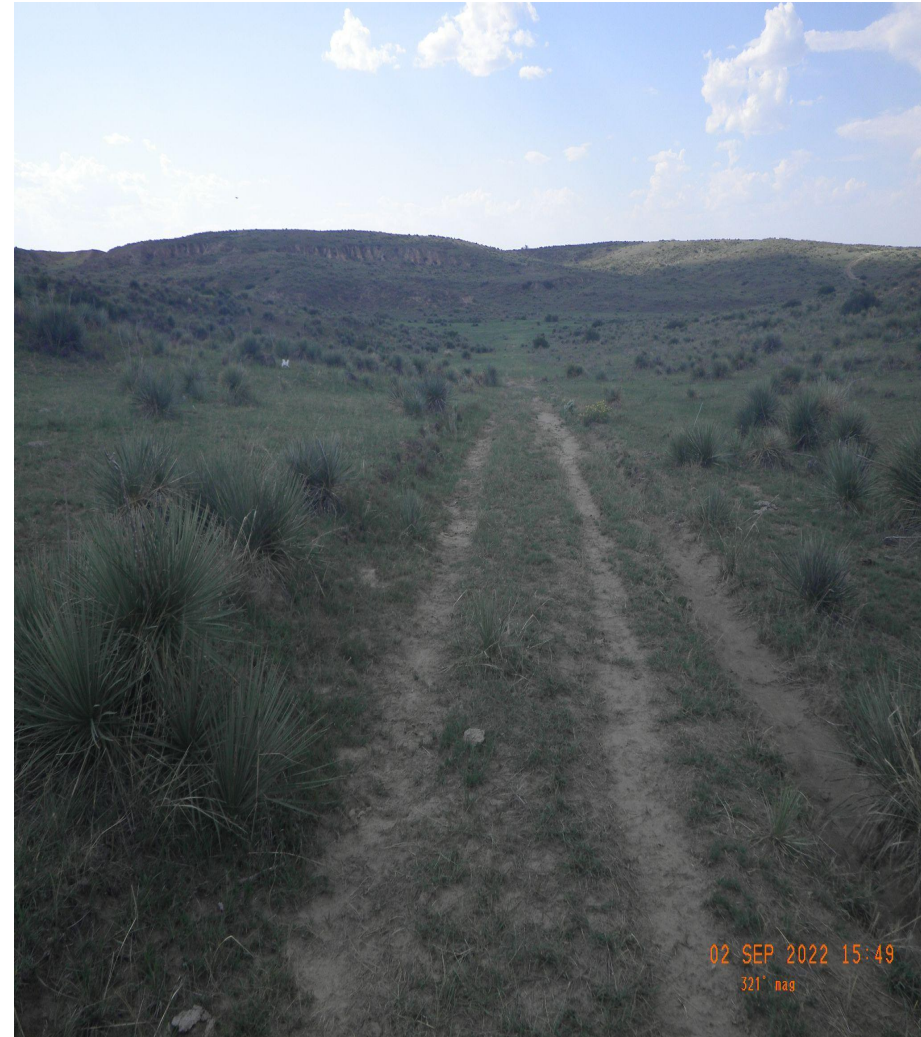
Photo 6. Overview photo of the access road. Note: portions of access road do not appear properly recontoured/reclaimed.