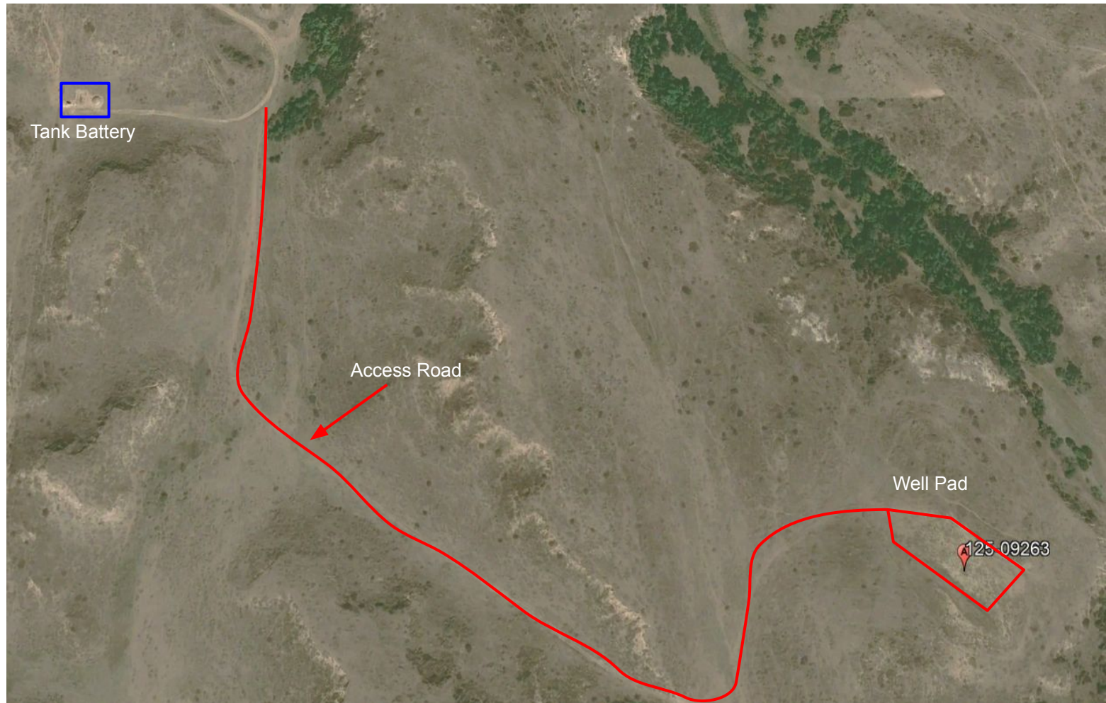
Photo 1. 2019 aerial imagery of the well pad and access road. Note: tank battery remains for the producing Ekberg 2-33 well API #125-07185.