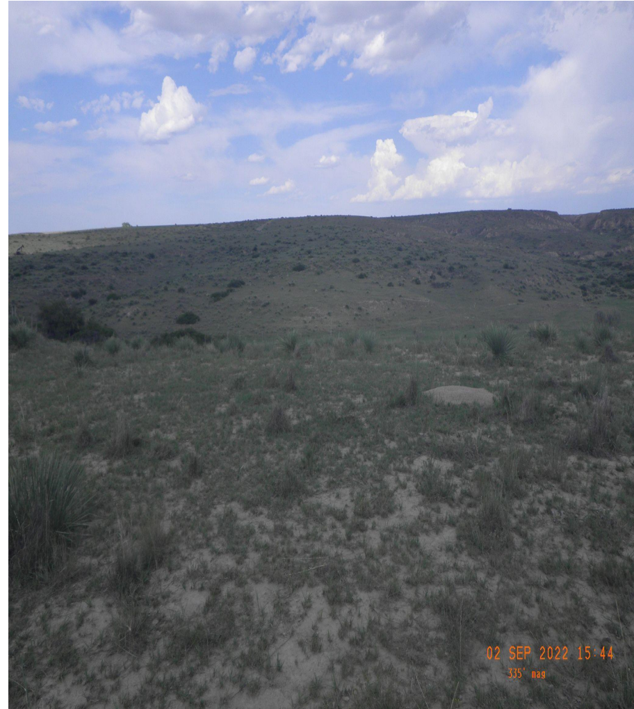
Photo 4. Cardinal photos taken from the middle of the well pad. Left photo facing south, right photo facing west.