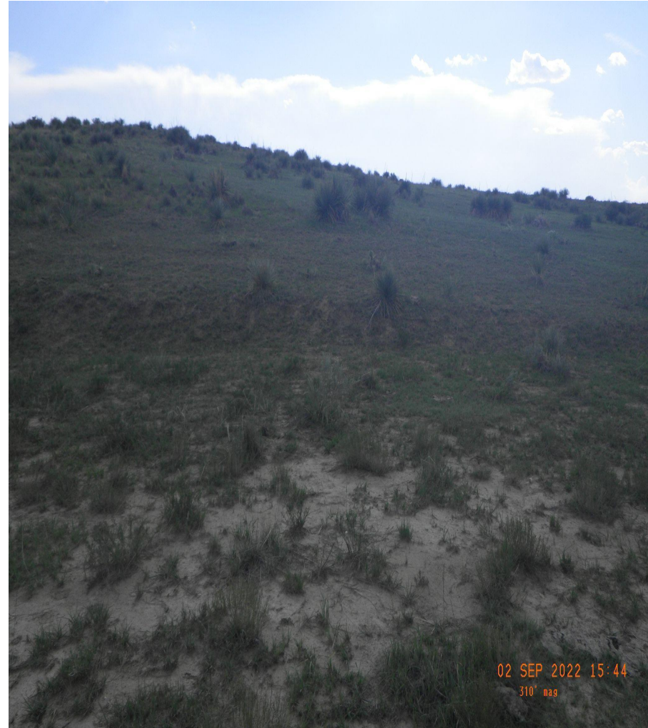
Photo 3. Cardinal photos taken from the middle of the well pad. Left photo facing north, right photo facing east.