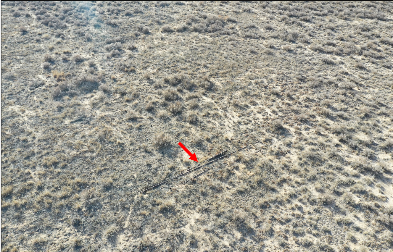
Photo 2. Drone photo facing down at the location. Location appears to be restored. There are drilling pipe casing that remains shown at red arrow.