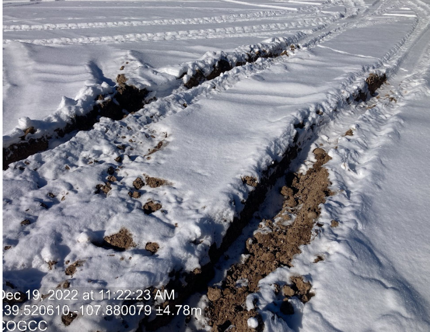
Lack of stabilization/ compaction