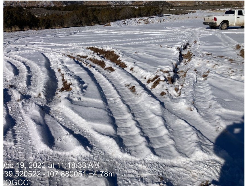
Lack of stabilization/ compaction