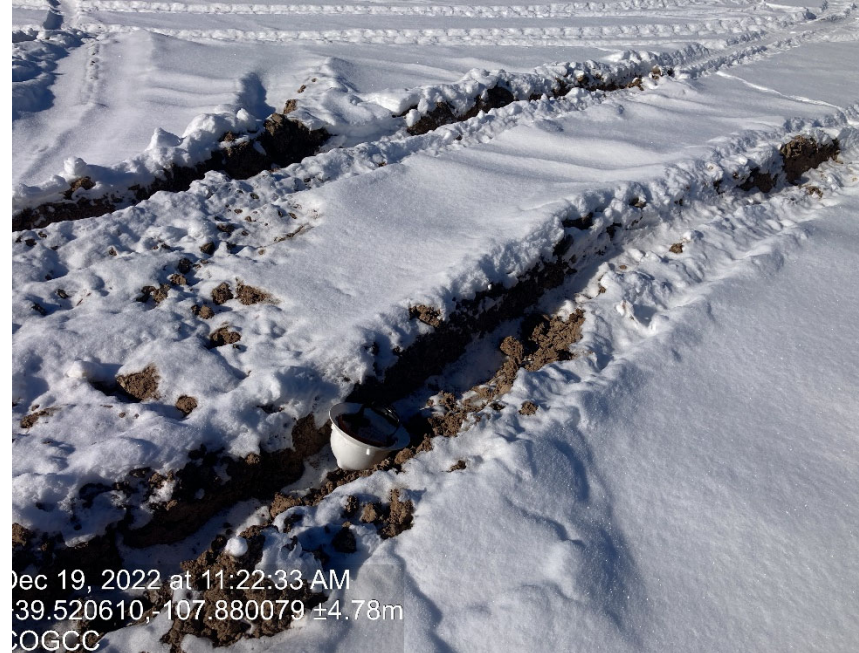
Lack of stabilization/ compaction. Hard hat in rut to help show depth.