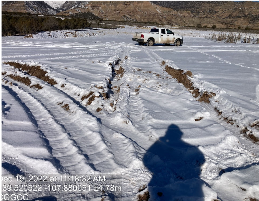
Lack of stabilization/ compaction