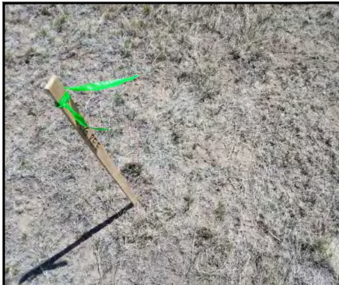
PHOTO: VIEW FROM ABOVE REFERENCE AREA