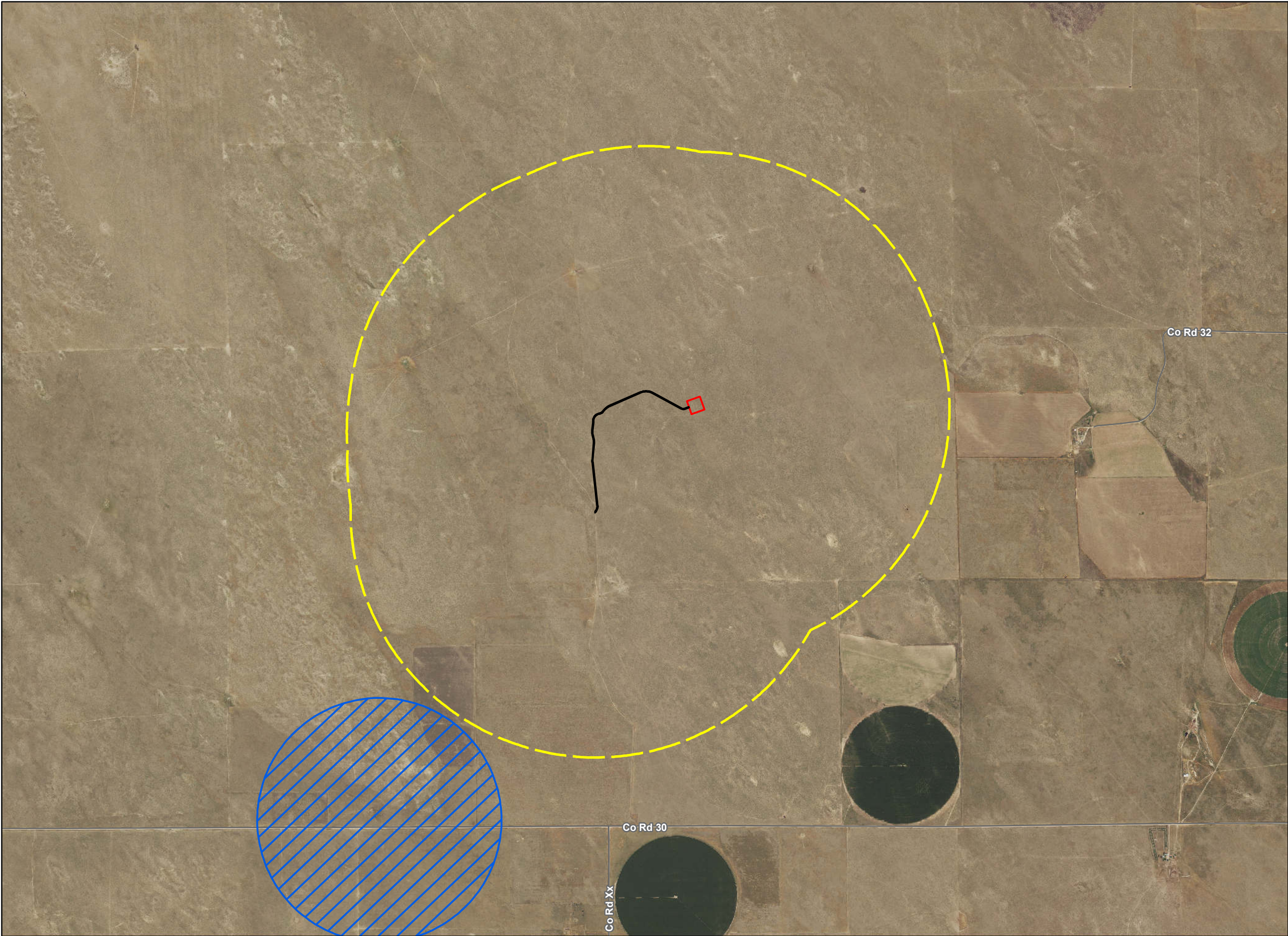
Figure 4 Wildlife Habitat

P:\0204_0003_Denova_Env_Surveys_COGIS\Layouts\Wildlife_Report\Figure4_Wildlife_Habitat.mxd