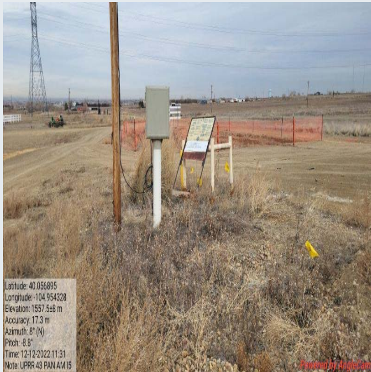
General Site - General 1