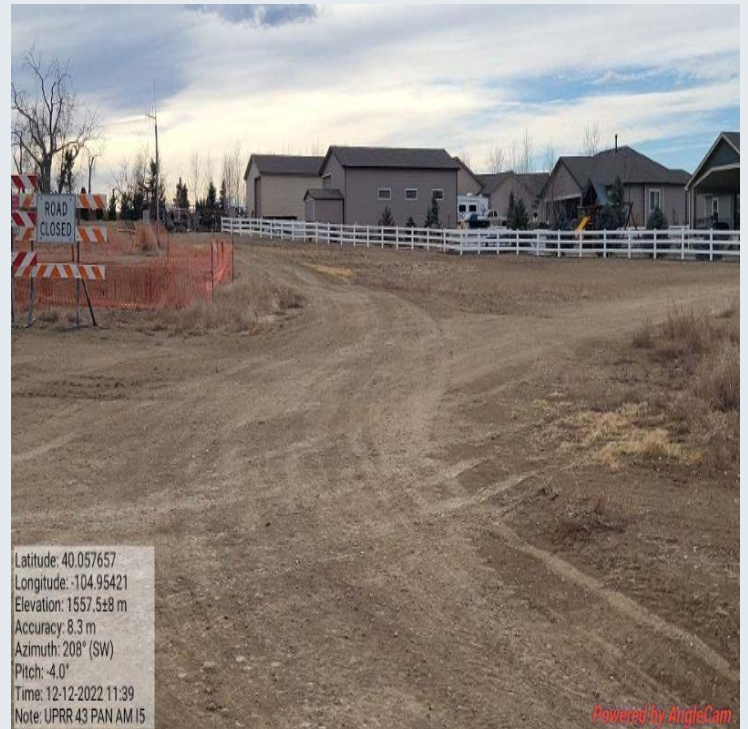
General Site - General 2