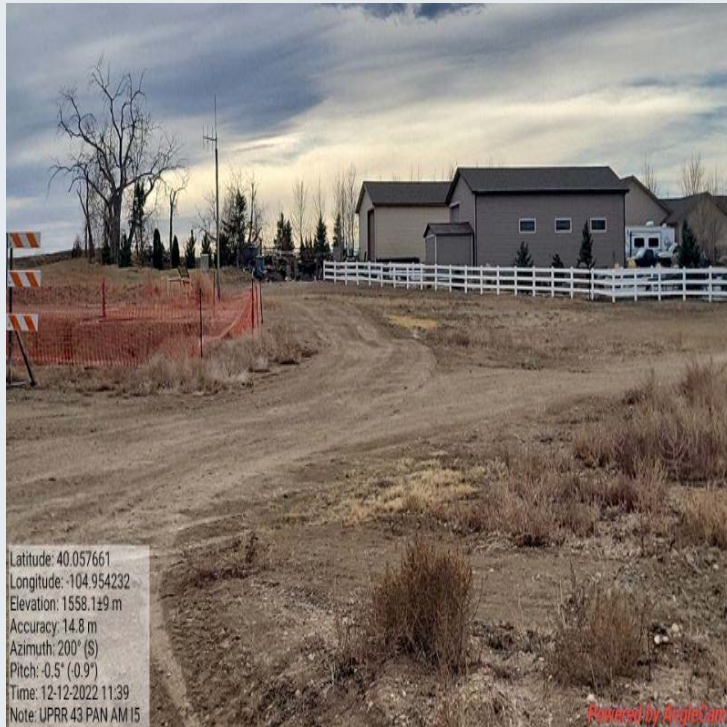
General Site - General 3