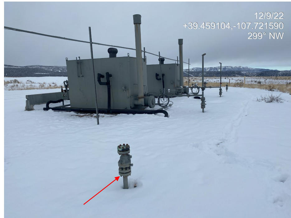
Photo 3. Photos show unused equipment (two (2) risers) at the separators at the northeast of the lower production pad.