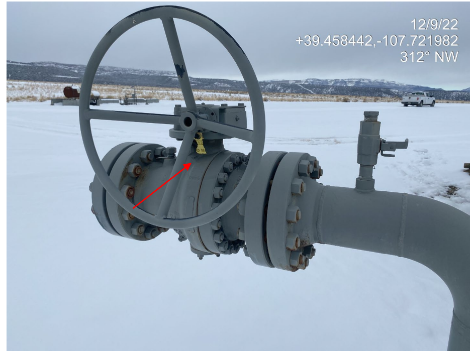
Photo 2. Photos show unused equipment (four (4) risers) at the separator at the southeast of the upper production pad. Risers are LOTO, however tags are in disrepair (right).