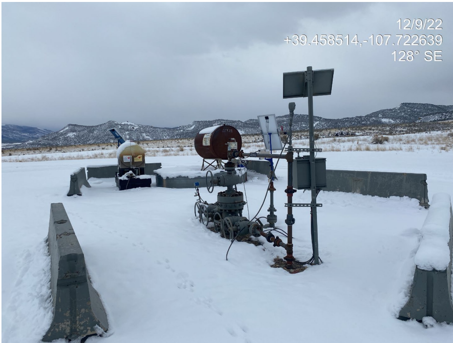
Photo 5. Photos show wells at the upper (left) and lower (right) production pads.