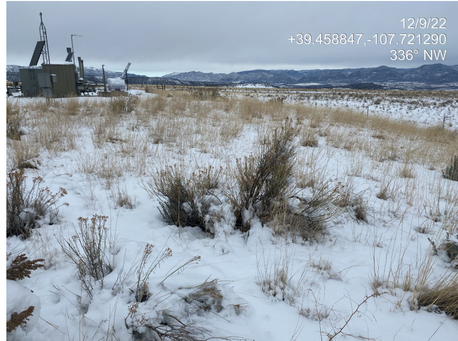
Photo 6. Photos show interim areas to the west (left) and east (right) appear dominated by introduced perennial grasses. Snow cover and dormant season prevented full vegetation assessment.