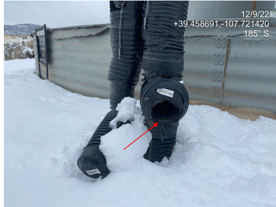
Photo 4. Photos show BMPs to prevent wildlife access to piping at tank battery are absent.