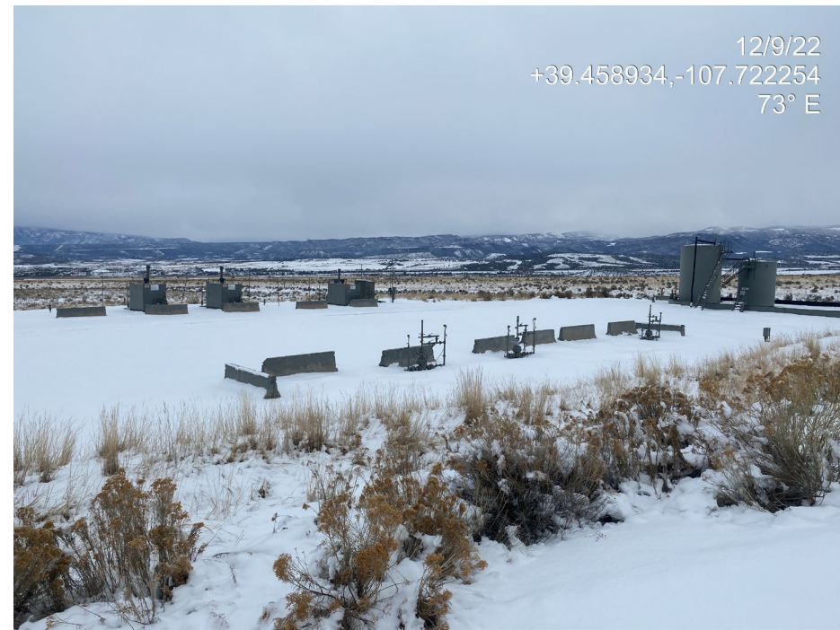
Photo 1. Photos show an overview of the western/upper (left) and eastern/lower (right) production pads.