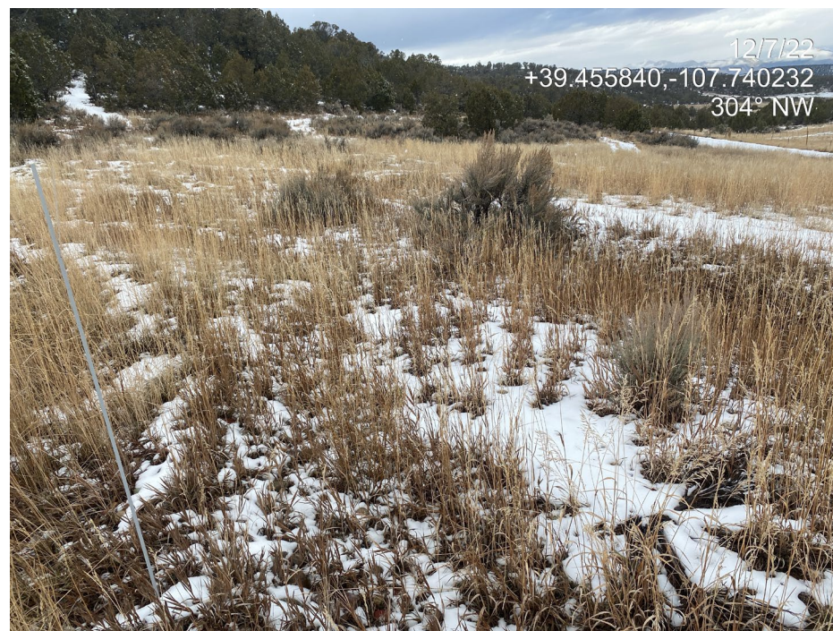
Photo 4. Photos show interim areas to the south (left) and north (right) appear dominated by introduced perennial grasses.