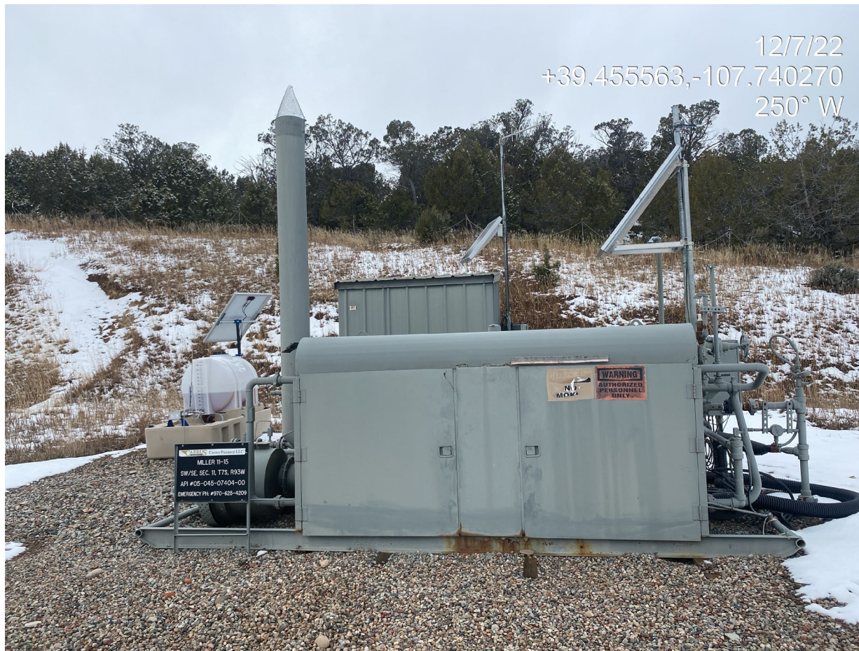
Photo 3. Photo shows production areas.