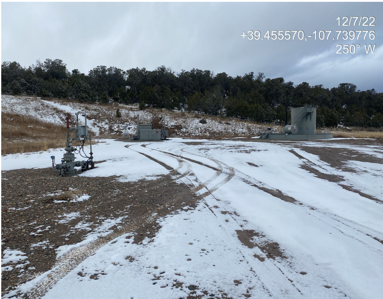
Photo 1. Photo taken from the east shows an overview of the location.