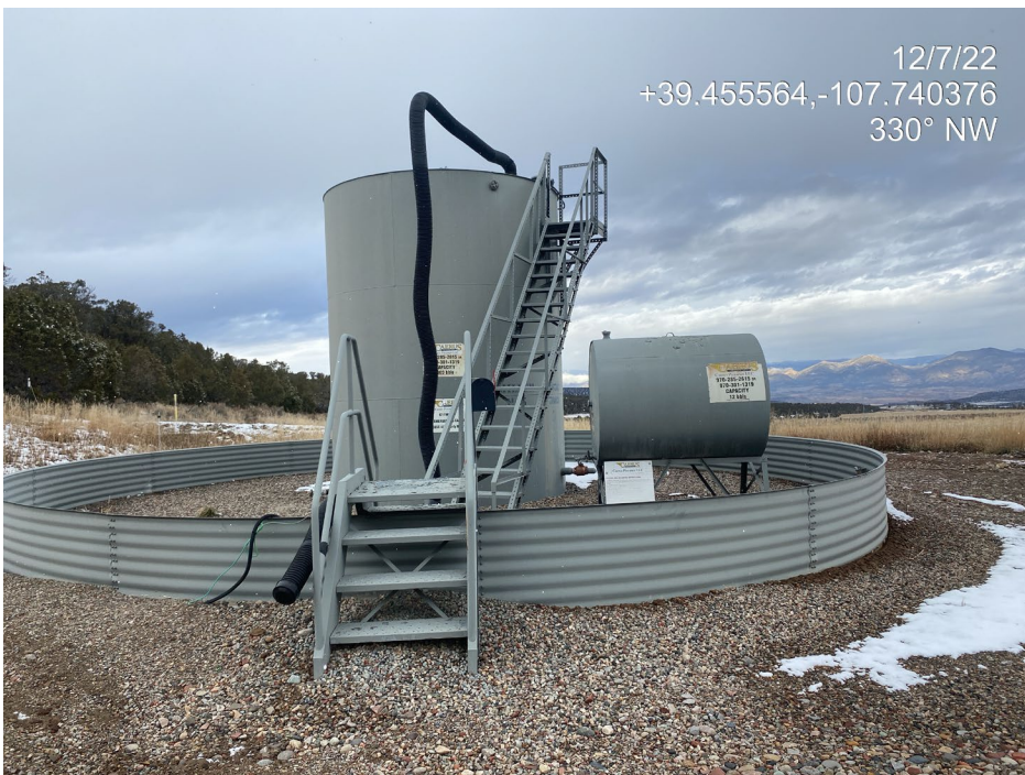
Photo 2. Photos show production areas.