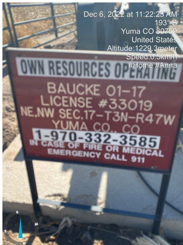
1. Lease sign by well