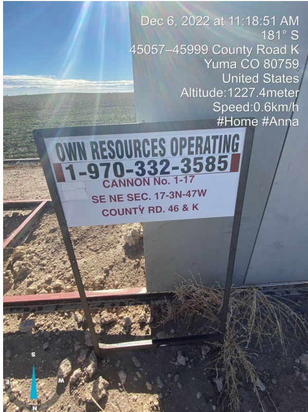
3. Lease sign by Meter shed