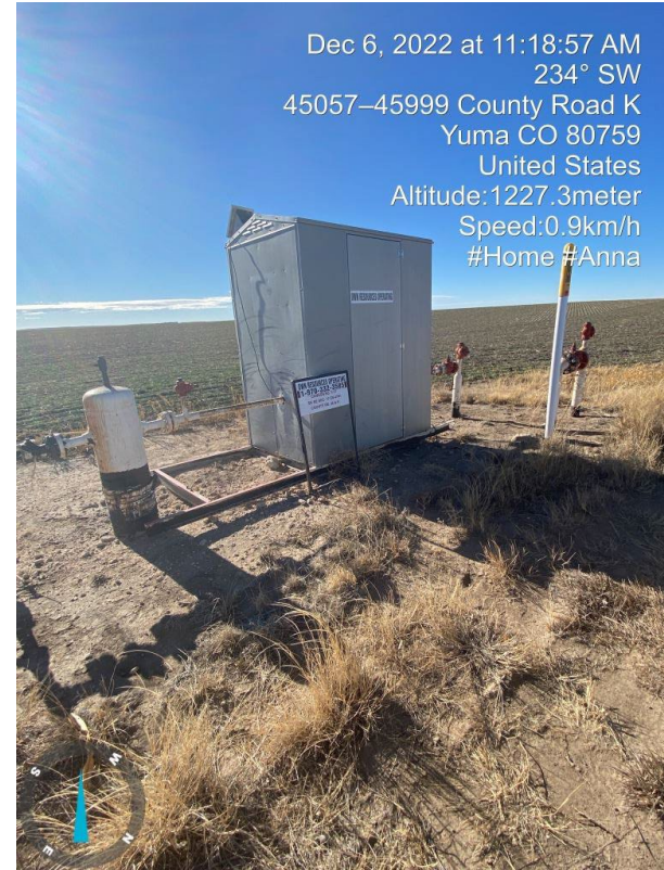
4. Meter shed and VGS 50% buried