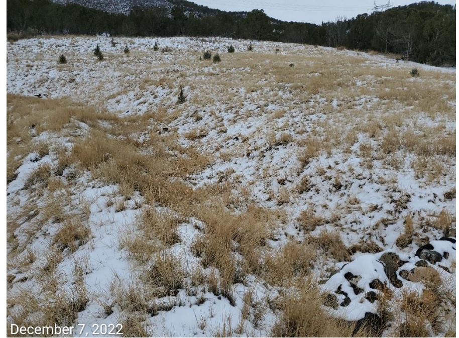
Photo 8: Photos example showing the interim areas of the Location.