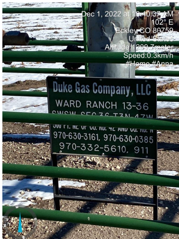
1. Lease sign by well