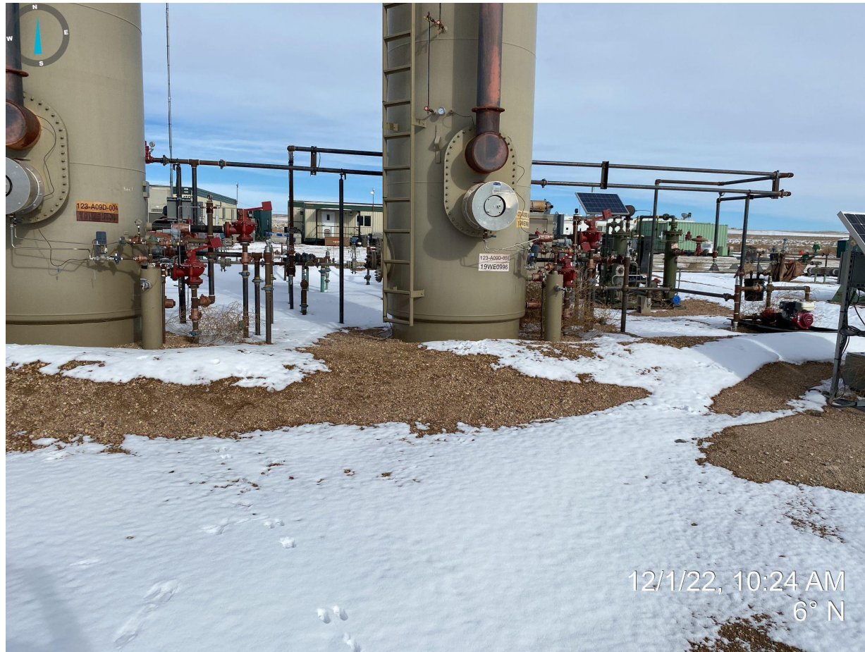
Photo 3. Taken near the western portion of the location, facing north. Photo illustrates tumbleweeds piled up against equipment.