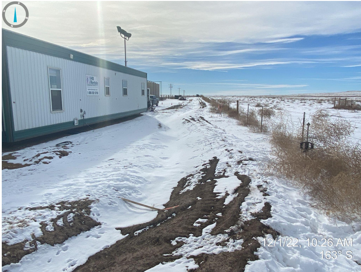
Photo 9. Facing south from northwest corner, see comments in Photo 5.