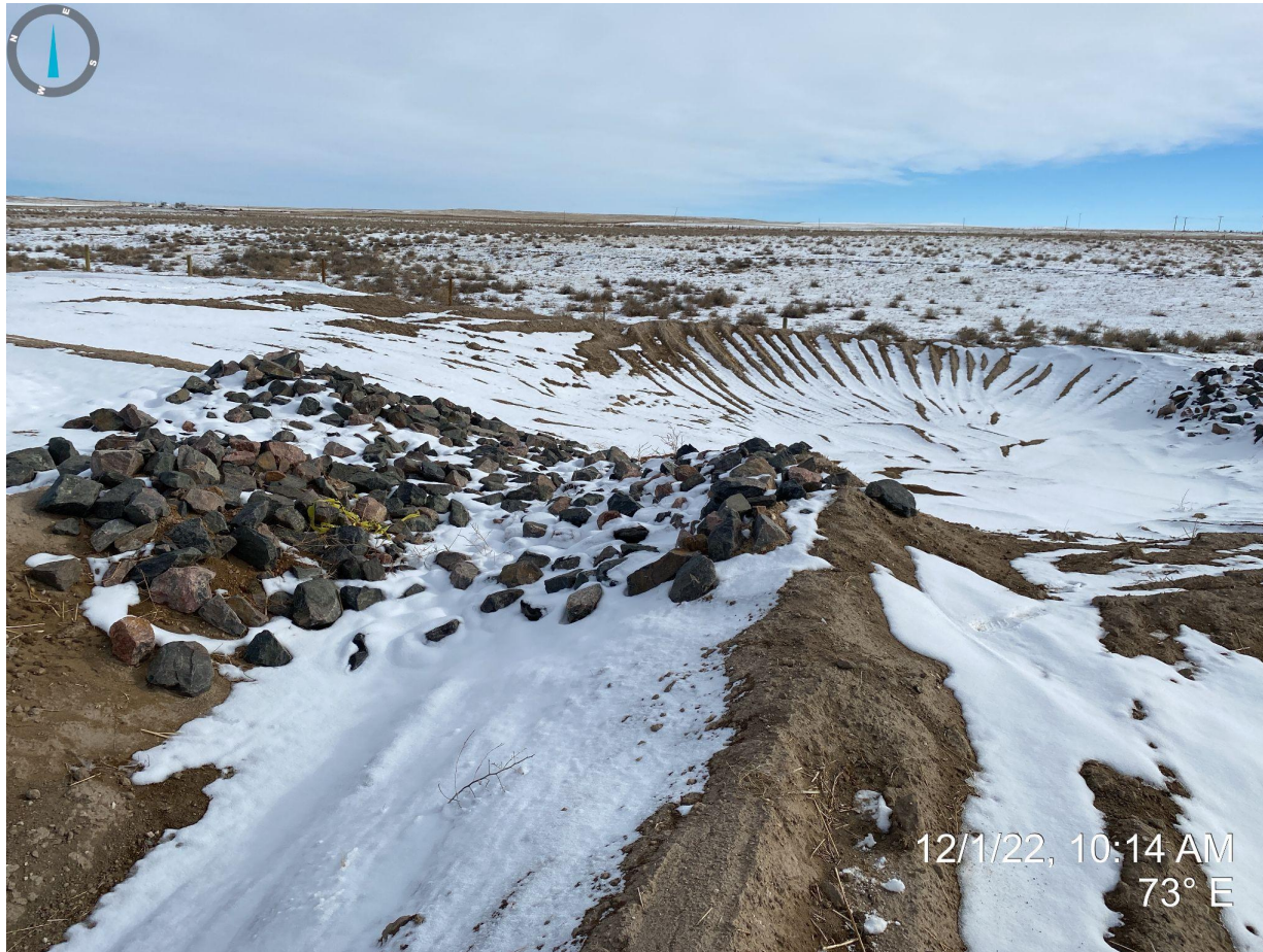
Photo 6. Facing east from sediment trap, see comments in Photo 5.