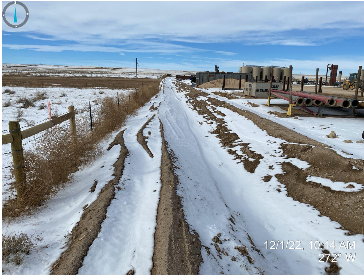
Photo 7. Facing west from sediment trap, see comments in Photo 5.