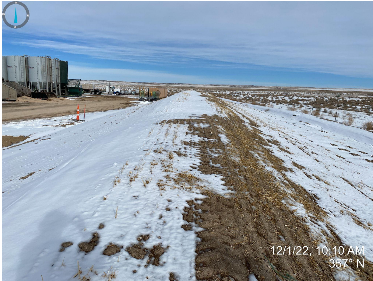
Photo 4. Facing north from topsoil stockpile. Photo illustrates the stockpile has been temporarily stabilized with evidence of drill rows and crimped straw mulch.