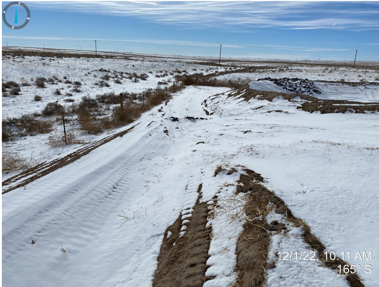
Photo 5. Facing south from topsoil stockpile. Photo shows stormwater BMPs (e.g. perimeter ditch and berm, and sediment trap, etc) have been installed during the construction phase of the location.