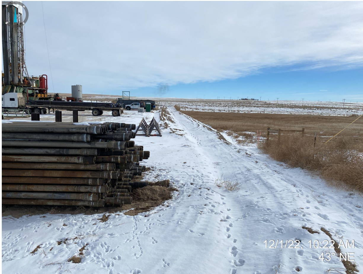
Photo 8. Facing northeast from the southwest corner of location, see comments in Photo 5.