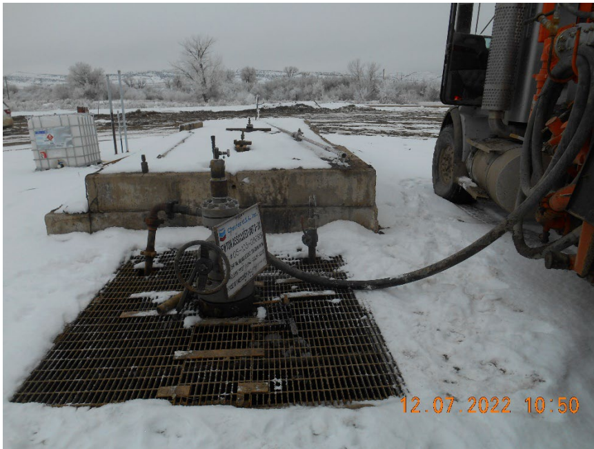
Monitor wellhead during MIT