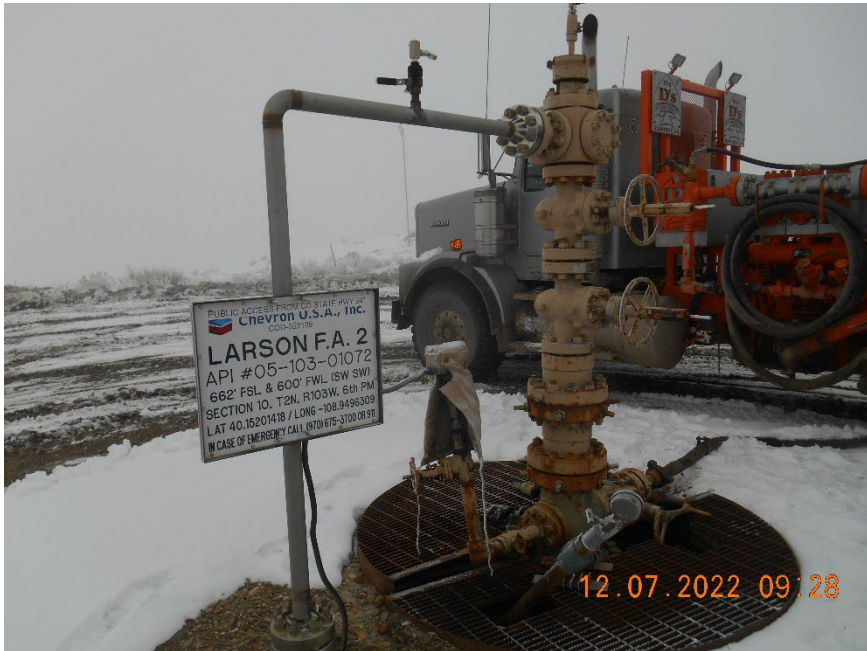
Injection wellhead during MIT