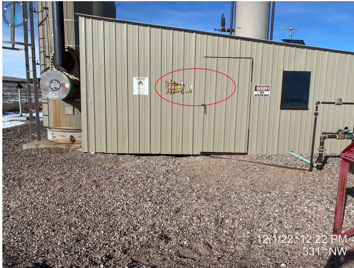
Photo 5. Taken south of the treater/building, facing northwest. Photo illustrates no emergency contact information and illegible signage.