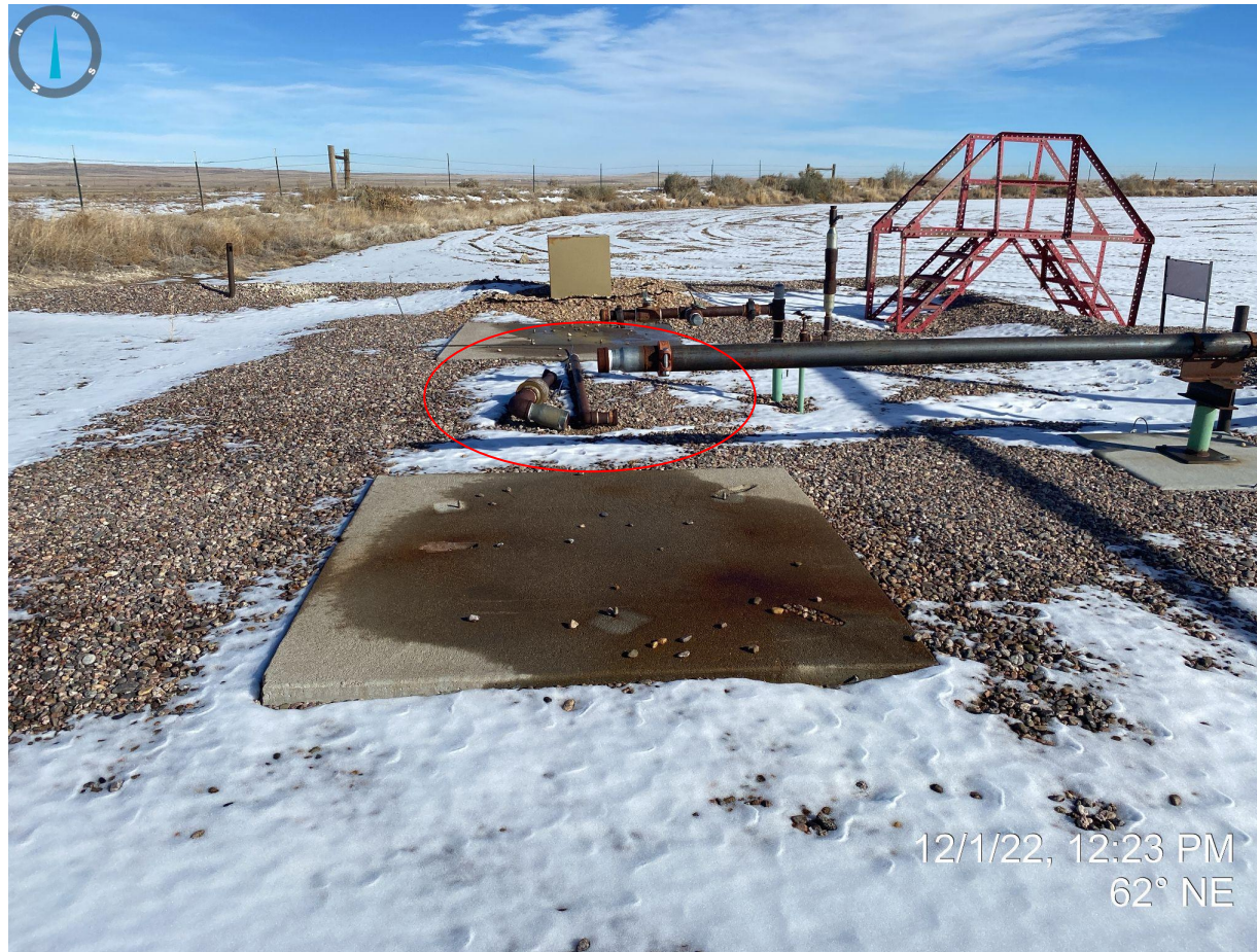
Photo 6. Taken from northern portion of location, facing northeast. Photo shows unused pipe and fittings that need to be removed if not currently in use.