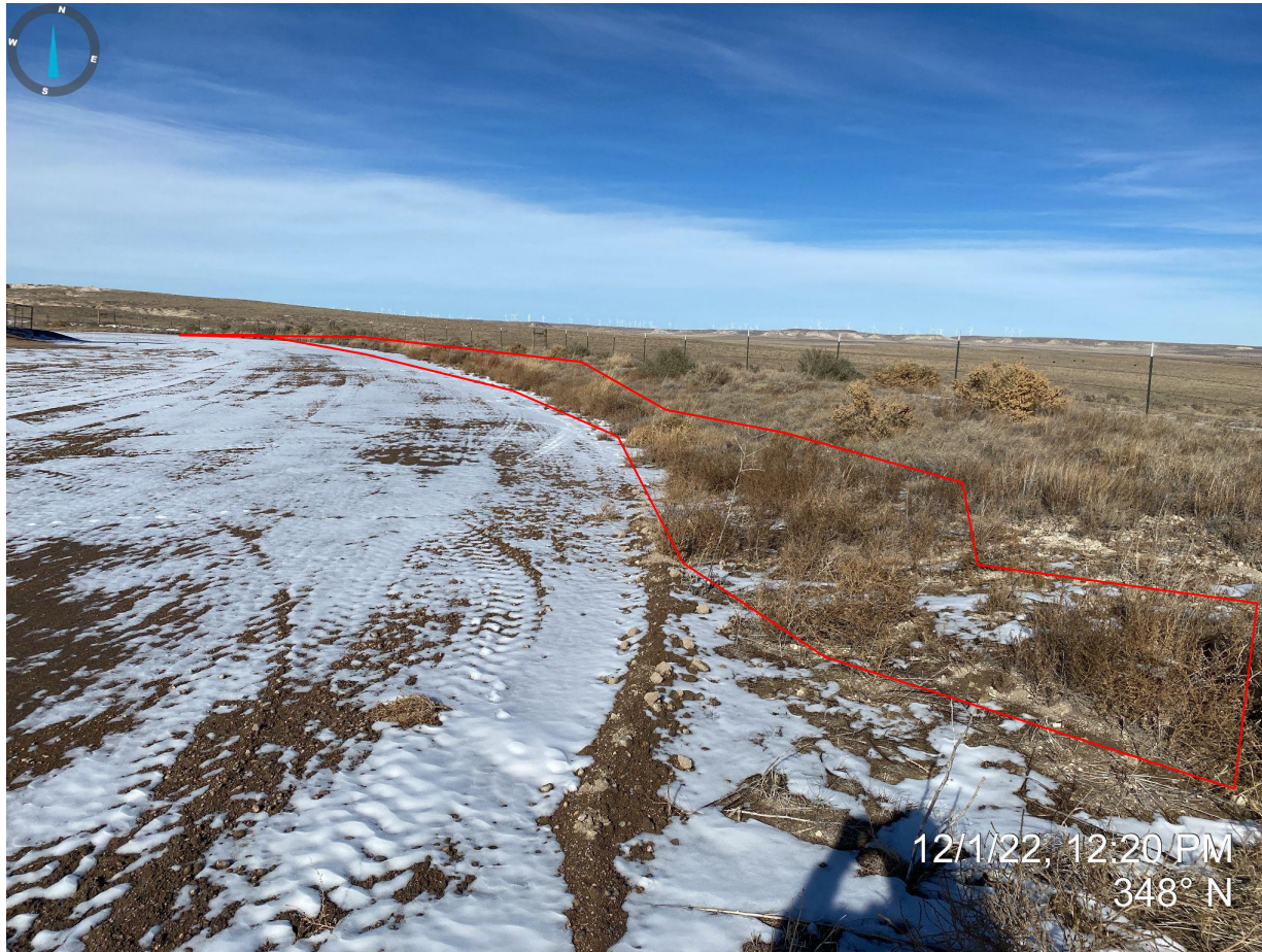
Photo 2. Taken from southeastern portion of location, facing north. See comments in Photo 1.