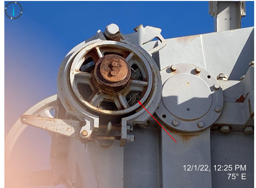
Photo 7. Pump jack photo illustrating a bird nest in equipment.