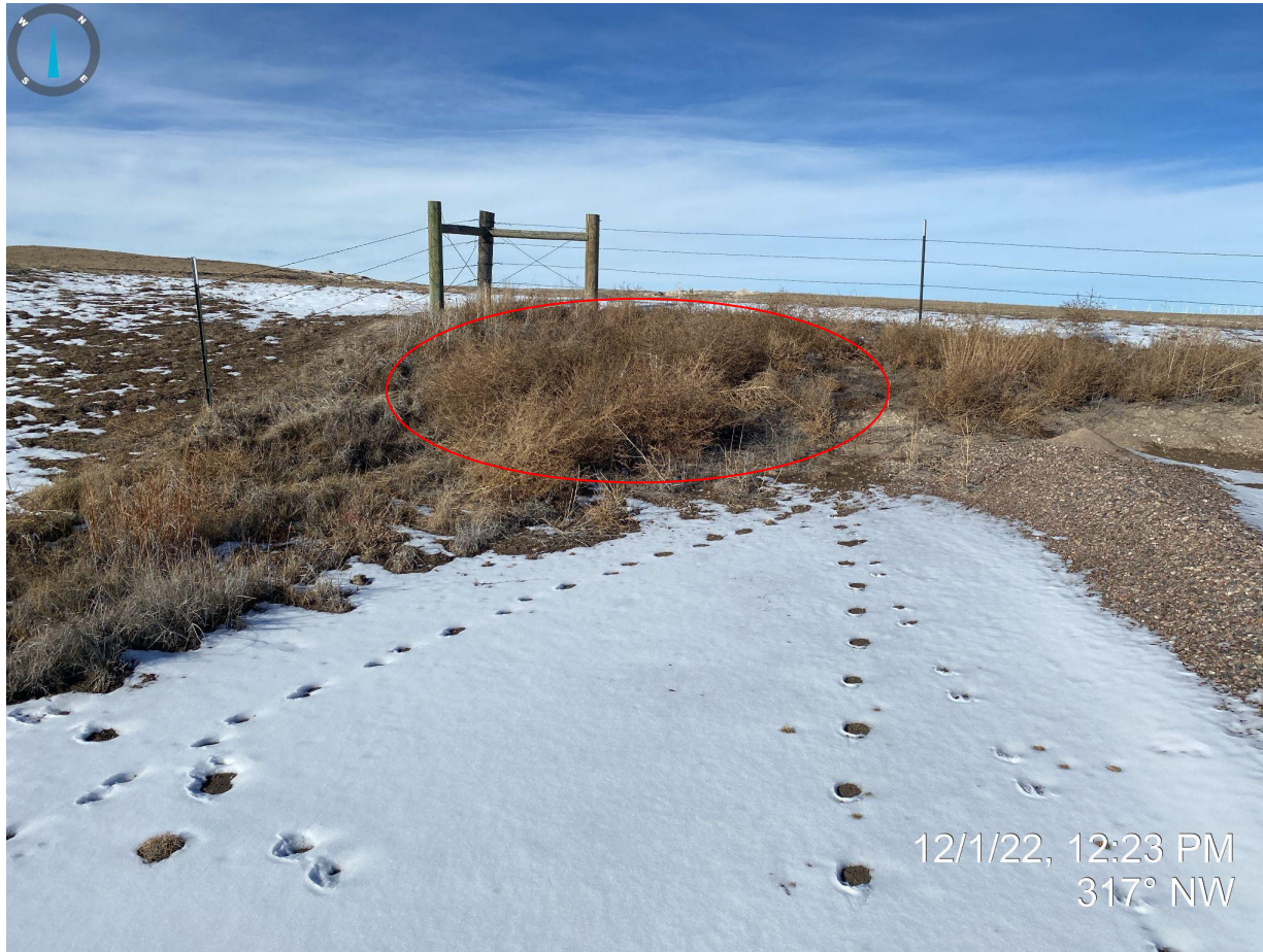
Photo 4. Taken near the northwest corner, facing northwest. See comments in Photo 1.