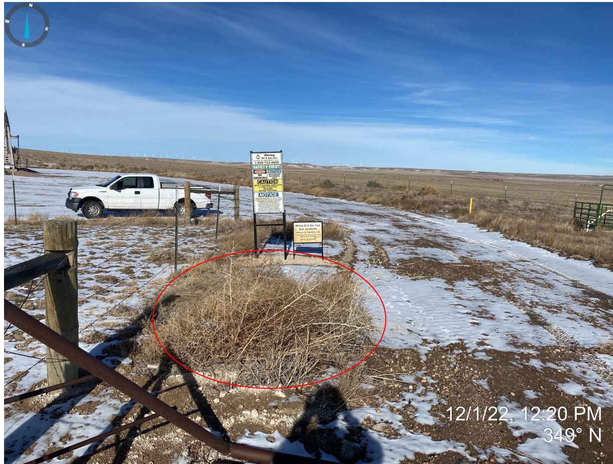
Photo 1. Taken from entrance, facing north. Photo illustrates presence of undesirable vegetation (e.g. kochia and russian thistle).