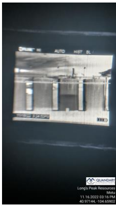
Motu East 28-21-16-1CH GPS Site Photo for Inspection Performed On 11/16/2022