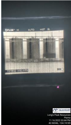
Pismo East 35-26-23-2-1CH GPS Site Photo for Inspection Performed On 11/16/2022