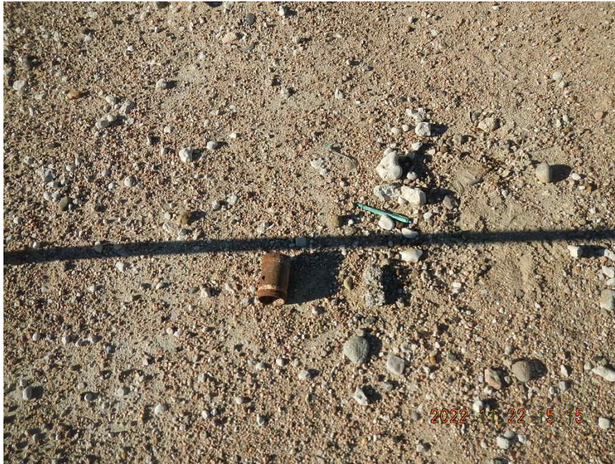
Photo 15. Trash and debris near pit.