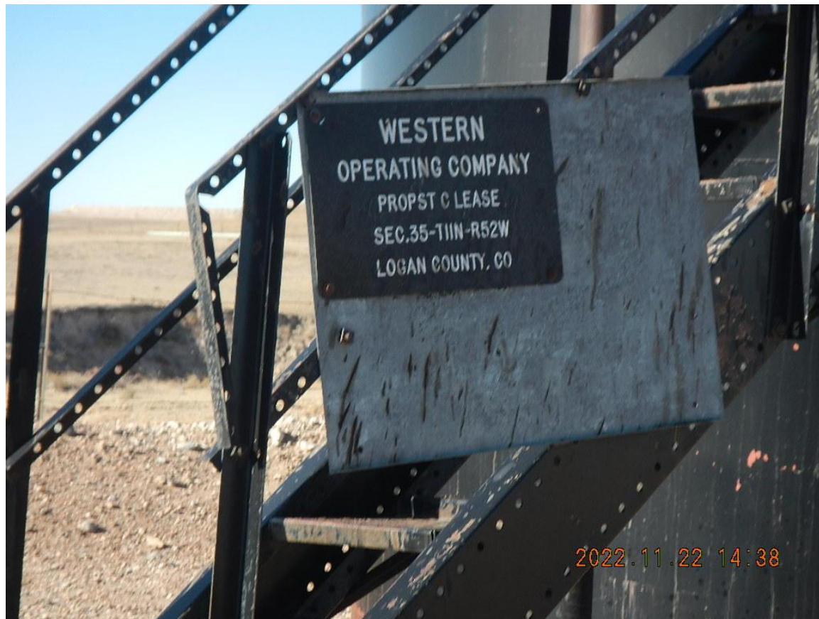
Photo 1. Sign at tank battery.