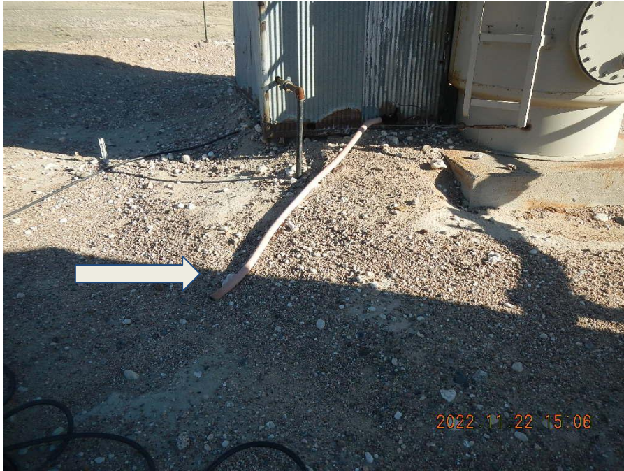
Photo 7. Discharge line to ground surface. Any discharge to the ground surface is considered a Spill. Discharge should be to secondary containment,