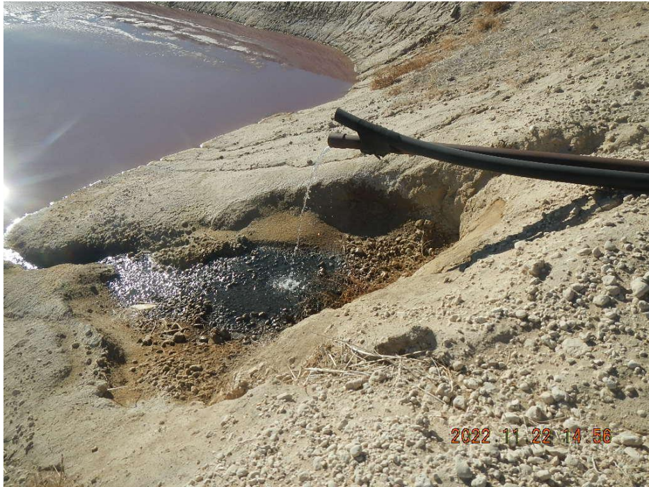
Photo 19. Fluid discharge to Pit Facility ID 256304. Not erosion and hydrocarbon staining. Strong HC odors were noted at time of inspection. Flow into pit estimated to be approximately 20 gpm.