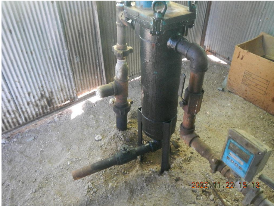
Photo 13. Filter with oil staining and oil staining on the ground.