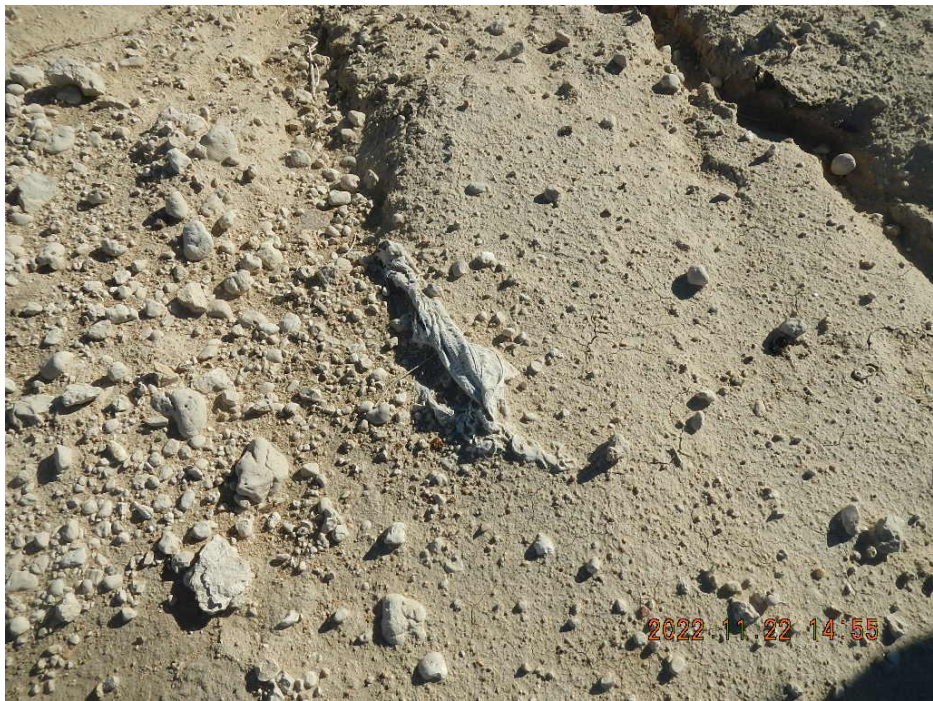
Photo 21. Trash near pit.