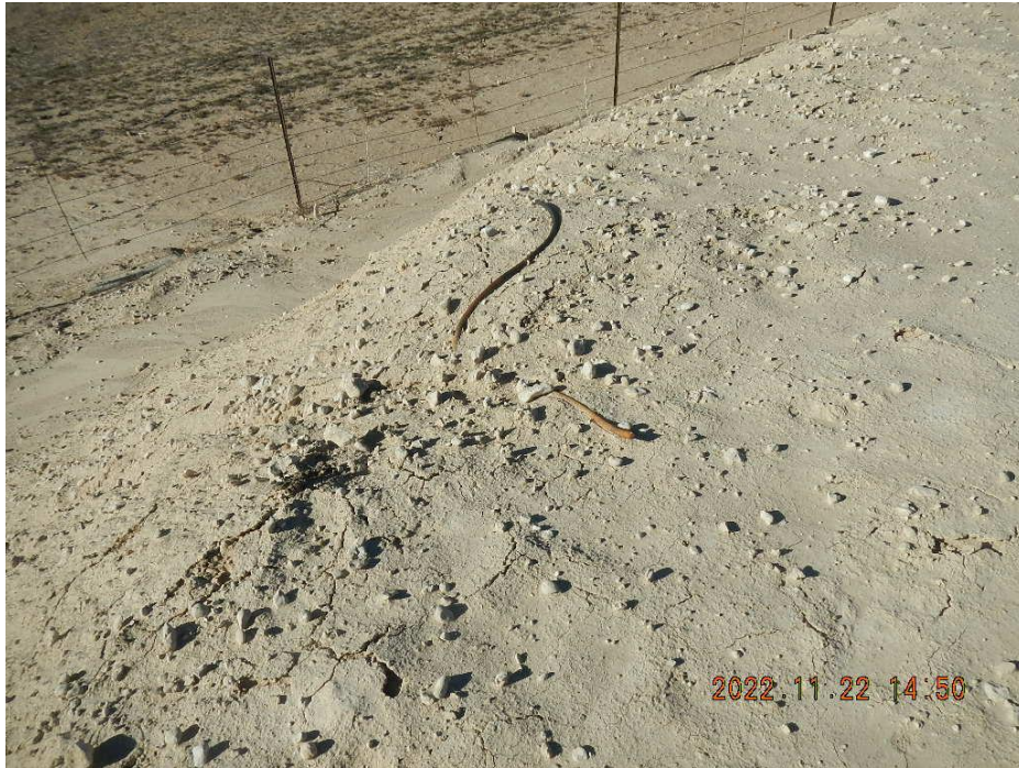
Photo 23. Trash/debris inside the pit complex.