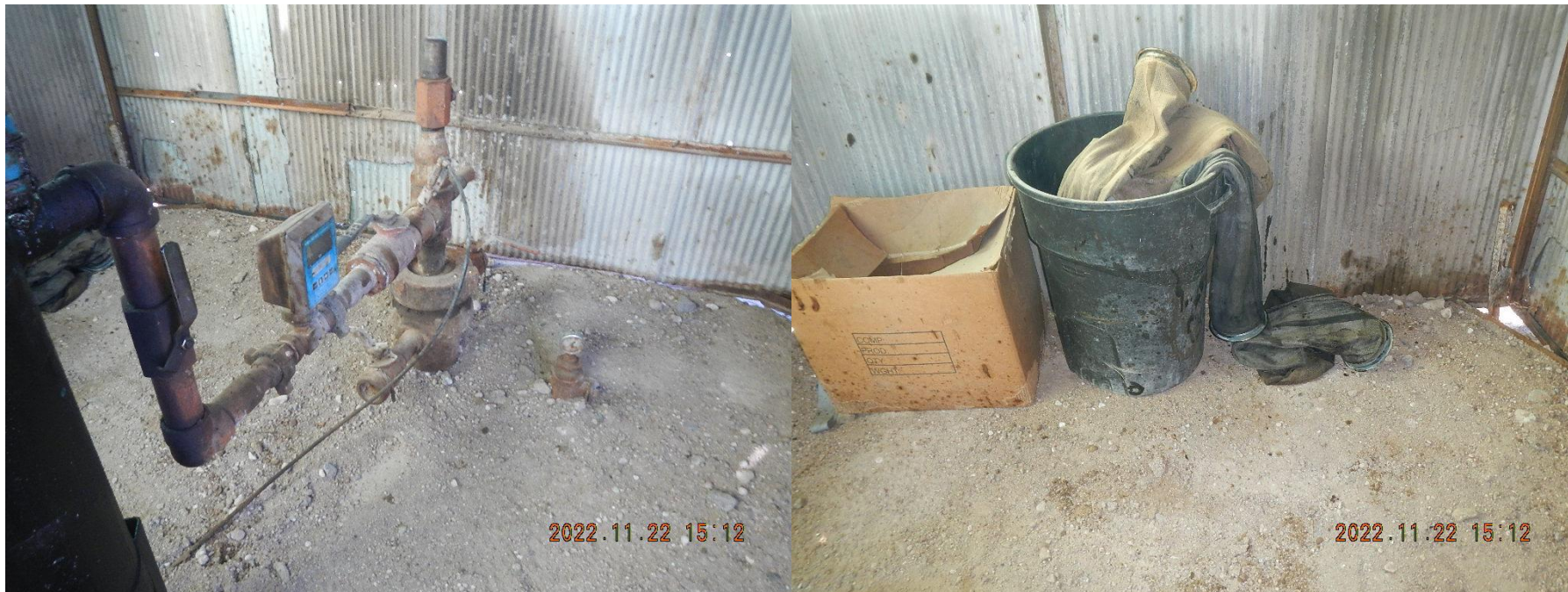
Photo 11. Probst 1 UIC well; API 075-09204