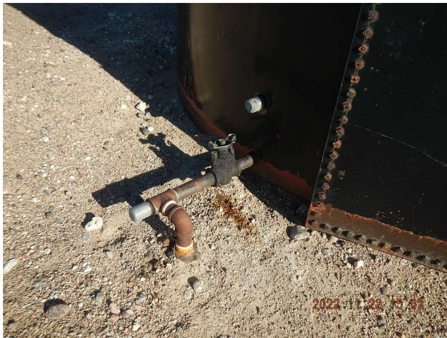
Photo 5. Oil weeping from valve.