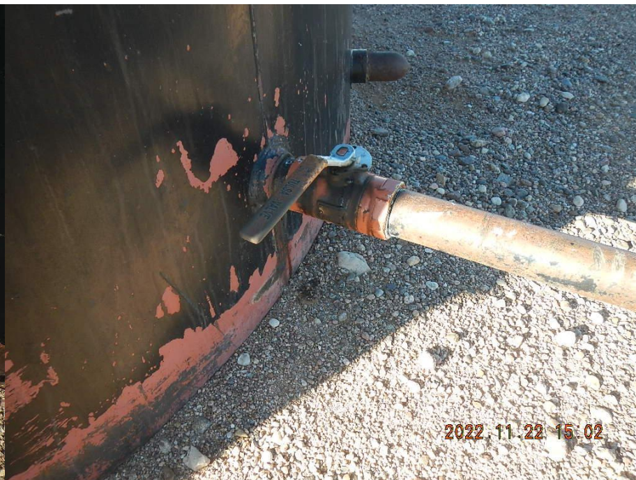
Photo 6. Oil weeping from valve and fittings.