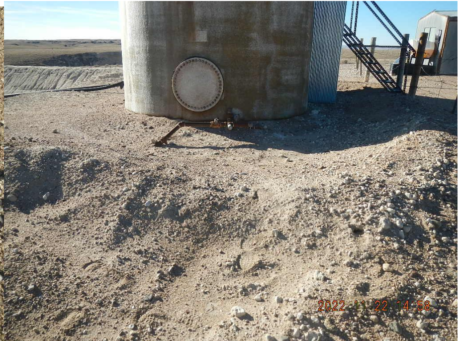
Photo 16. Berms do not appear to be adequate to contain volume of tank.