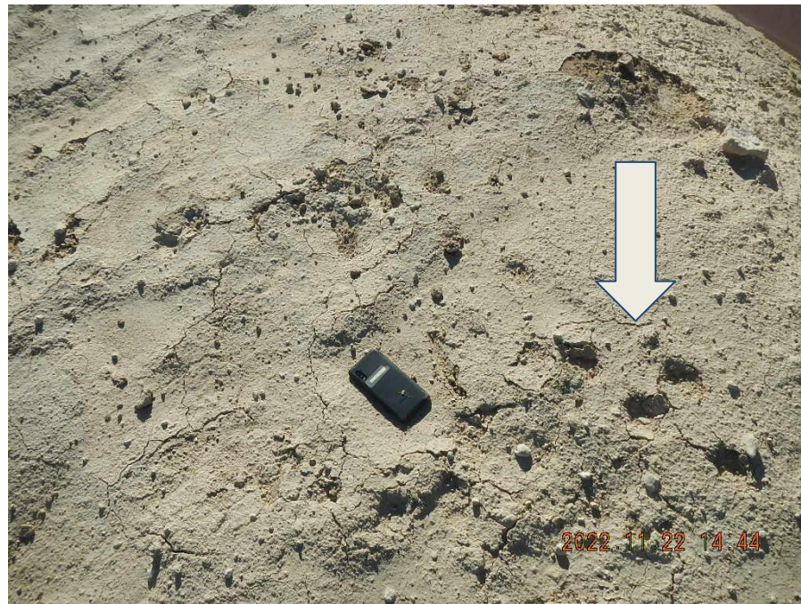
Photo 26. Signs of wildlife inside pit facility complex.