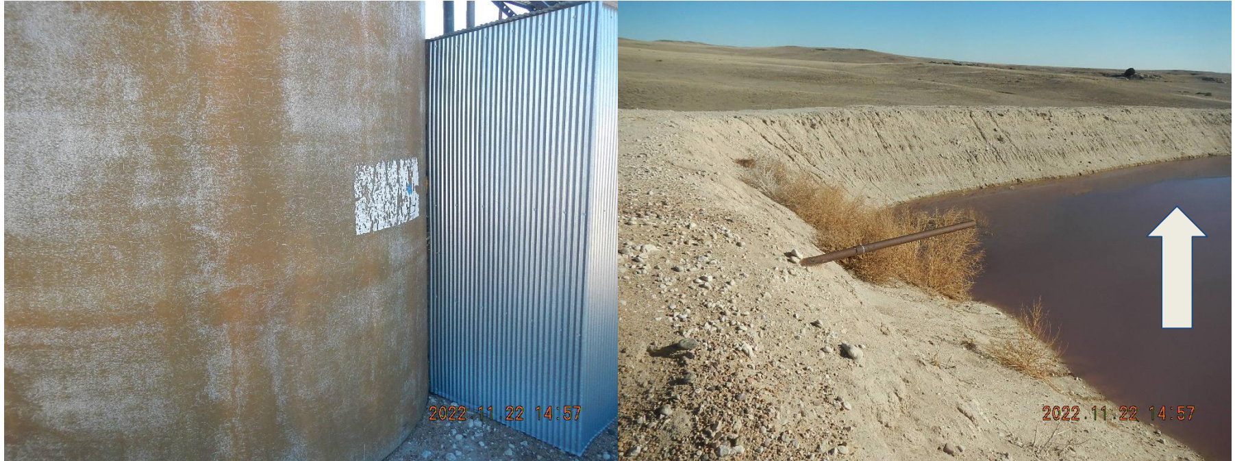
Photo 17. Signage and label illegible.