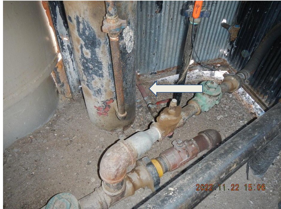
Photo 8. Discharge line from previous photo.