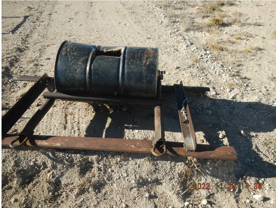
Photo 27. Unused equipment. Note: The 55-gallon drum was partially full of oil and paraffin. Contents to be removed and disposed of as E&P waste.