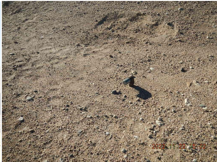
Photo 4. Unmarked flowline riser.