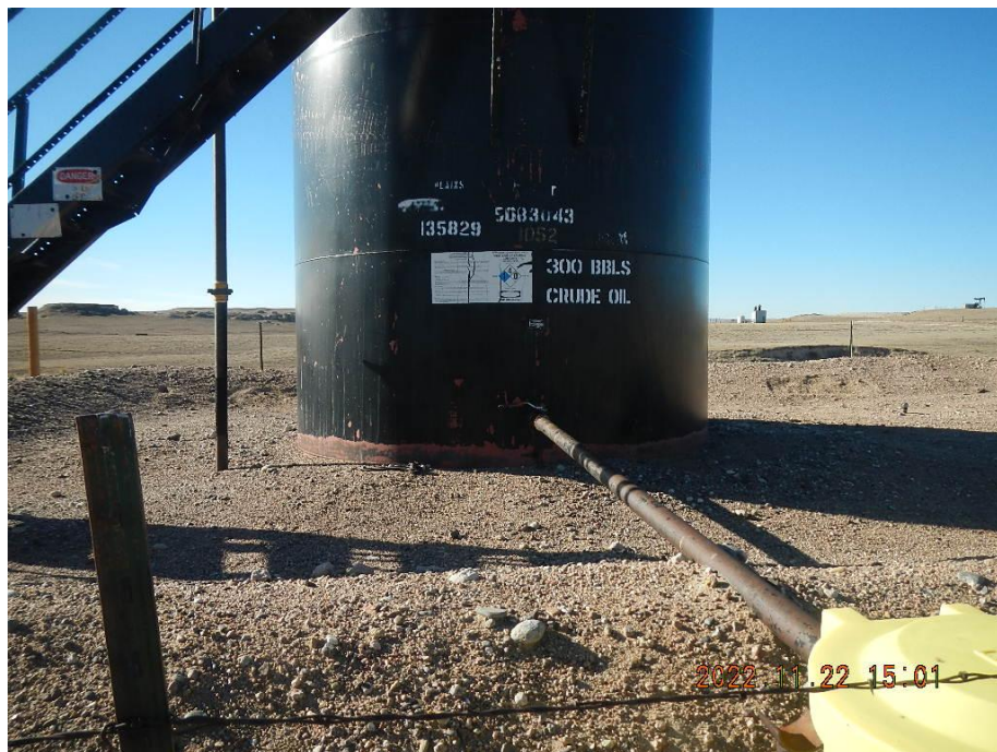
Photo 3. Placard labeling getting faded. Note: Emergency Contact # illegible from a distance.