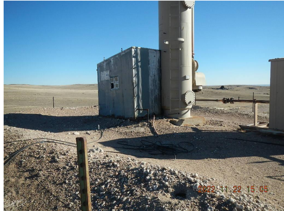
Photo 10. Vertical separator. Placard and signage on shed in disrepair and cannot be read from a distance.