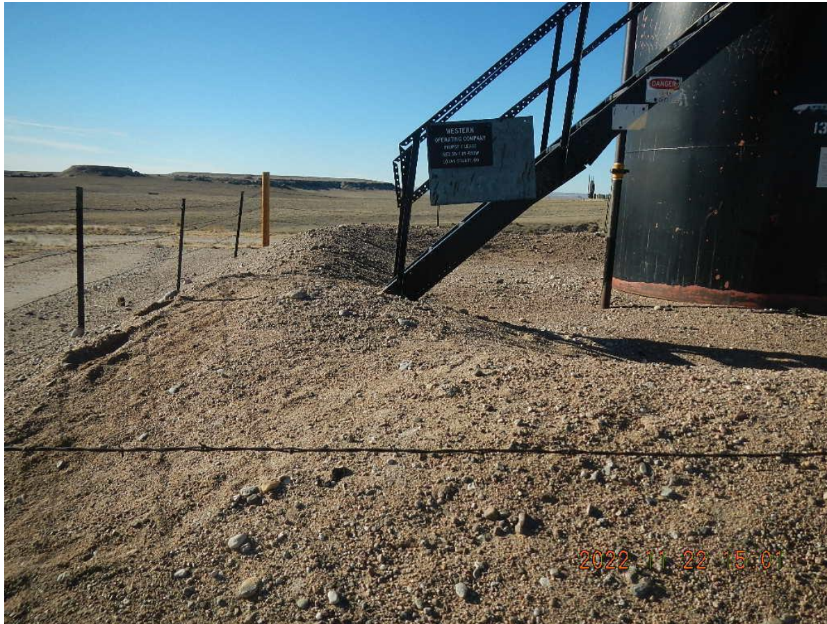
Photo 2. Berms do not appear to be adequate to contain volume of tank.