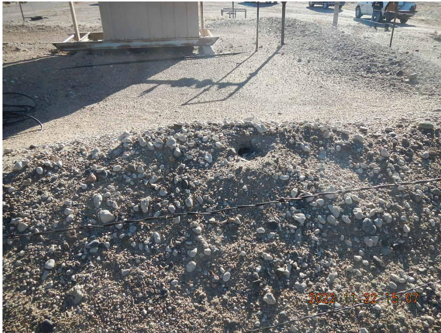
Photo 9. Burrows compromising secondary containment berm.