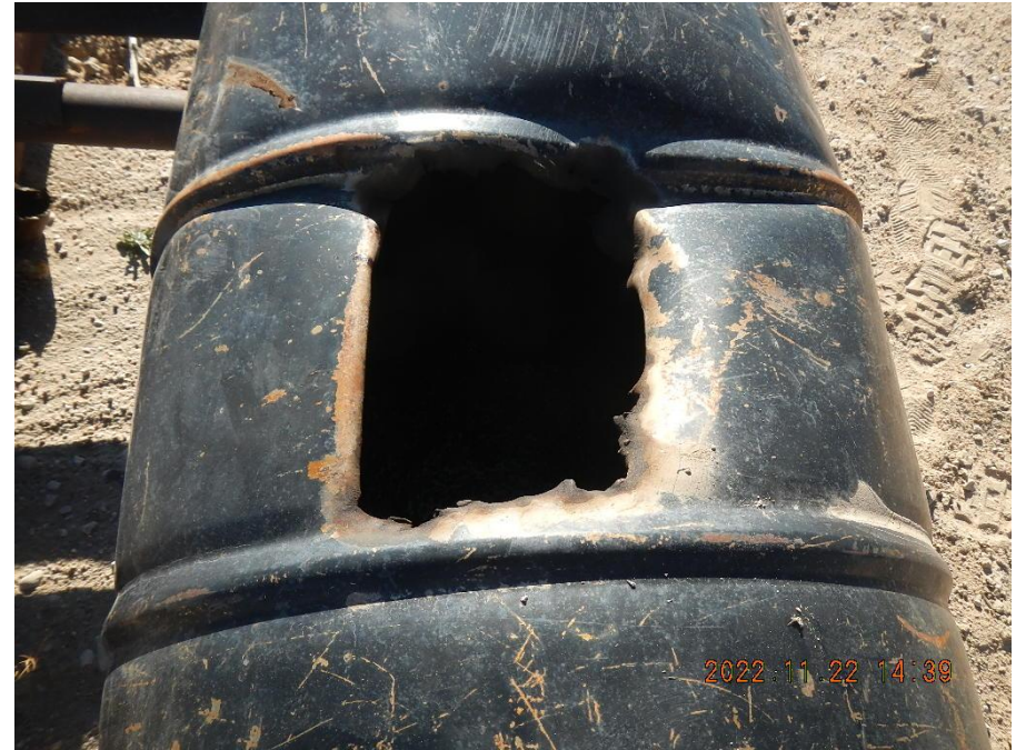
Photo 28. See photo 27 description.