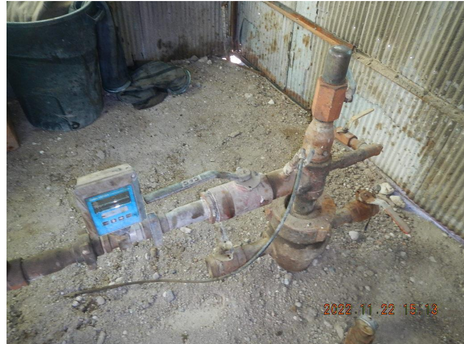
Photo 14. Oil staining around valve threads and on the ground.