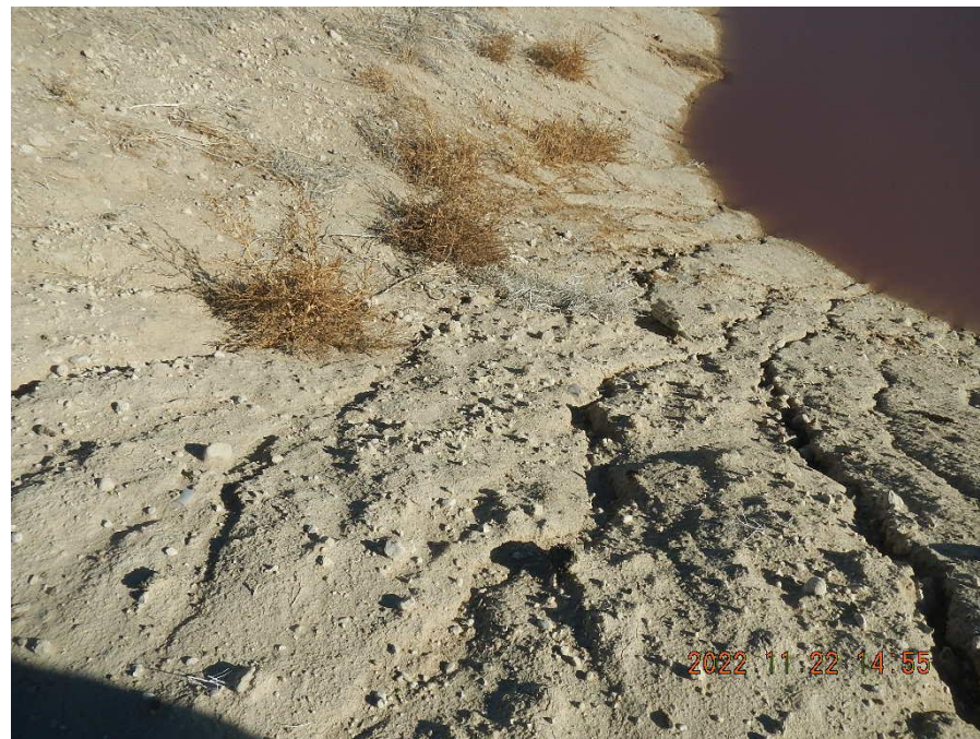
Photo 22. Erosional rills into pit. There should not be any surface runoff into the pit.