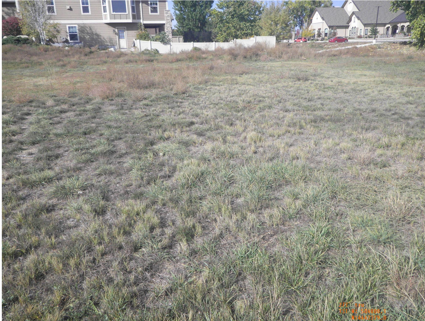
Photo 5. Well pad reference area. Note: no Canada thistle observed in reference area.