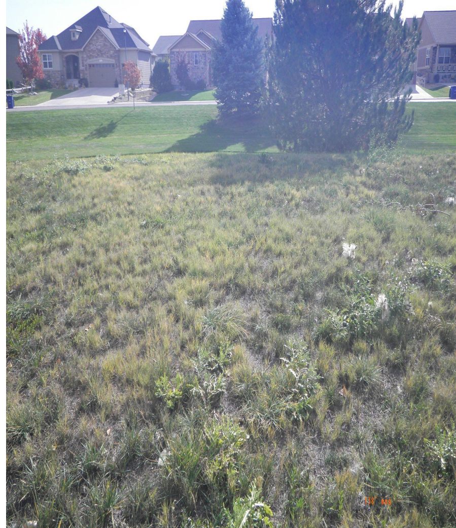
Photo 3. Cardinal photos taken at ground level from the middle of the well pad. Left photo facing north, right photo facing east.