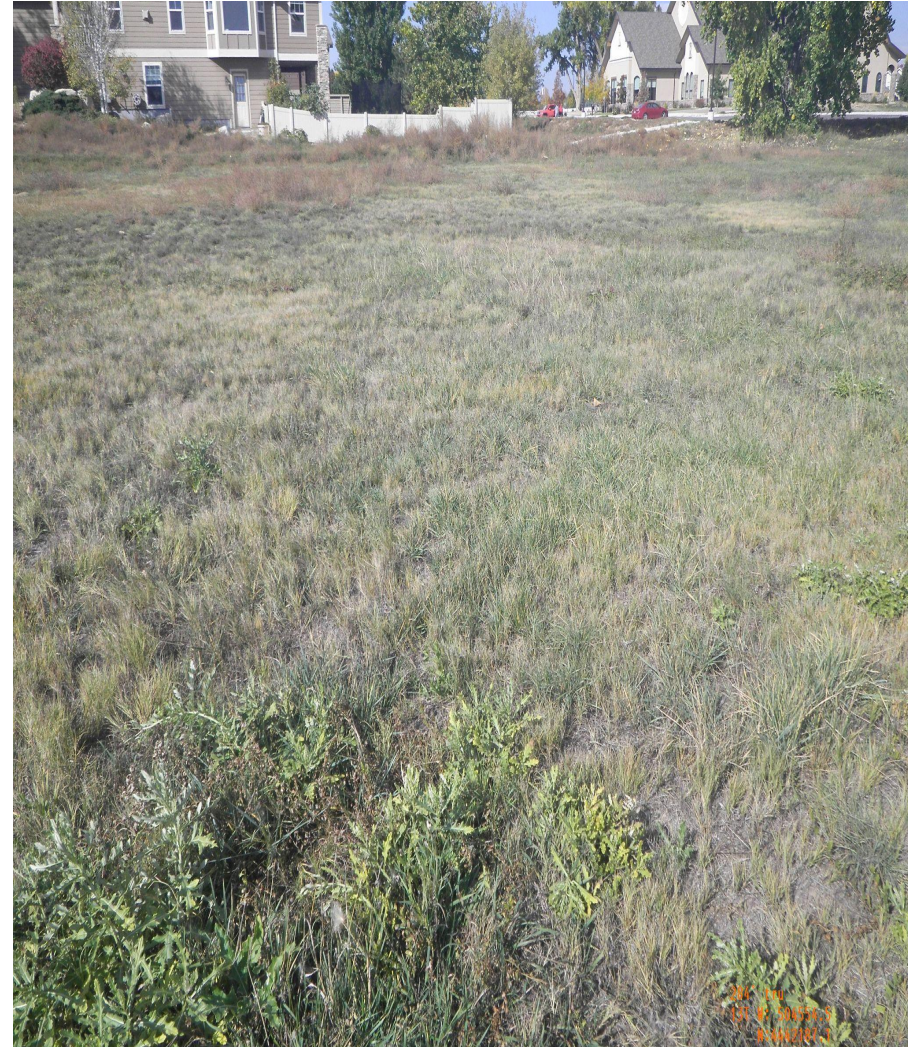
Photo 4. Cardinal photos taken at ground level from the middle of the well pad. Left photo facing south, right photo facing west. Note: well pad is dominated by Canada thistle, a Colorado List B noxious weed.