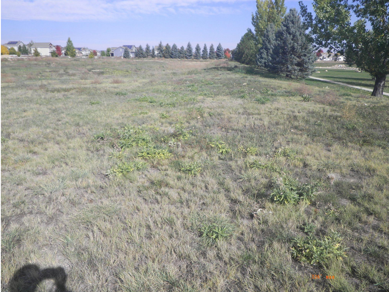
Photo 2. Overview photo of the well pad taken at ground level from the southern edge facing north.