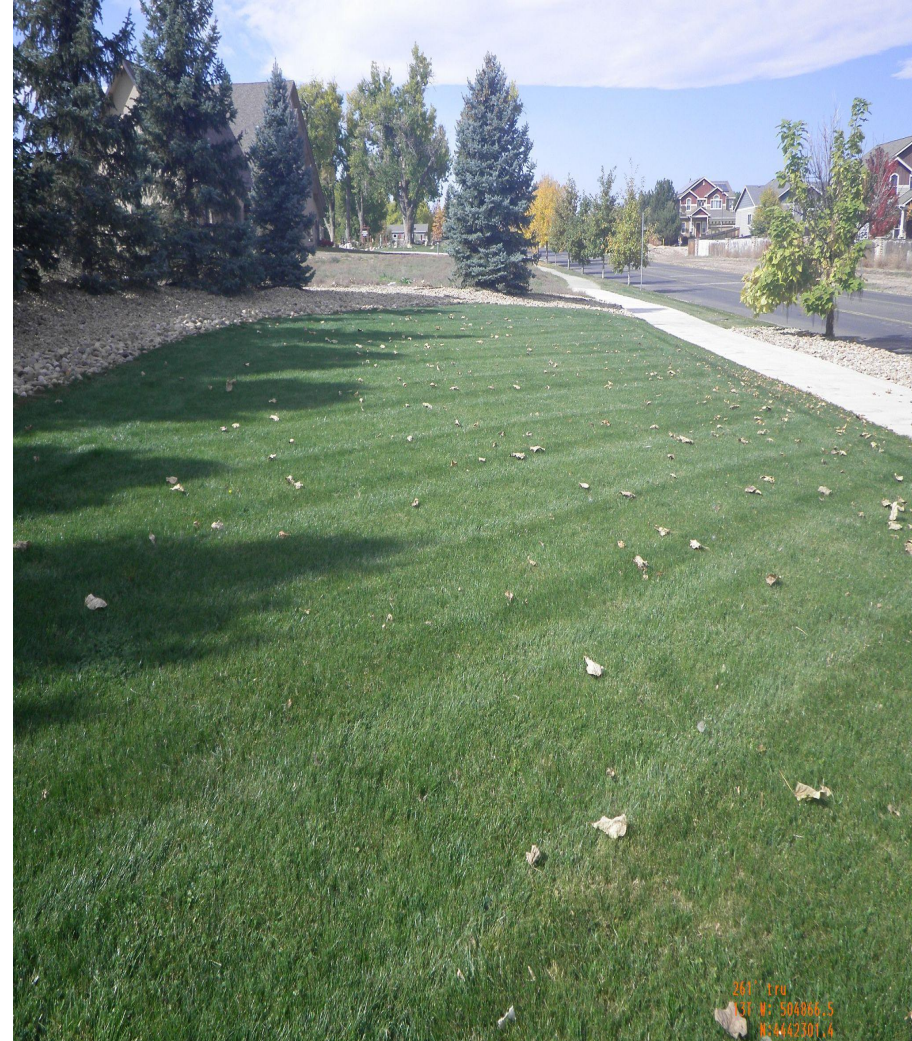
Photo 8. Cardinal photos taken at ground level from the middle of the tank battery. Left photo facing south, right photo facing west. Note: tank battery falls within a residential area, no signs of oil and gas operations.