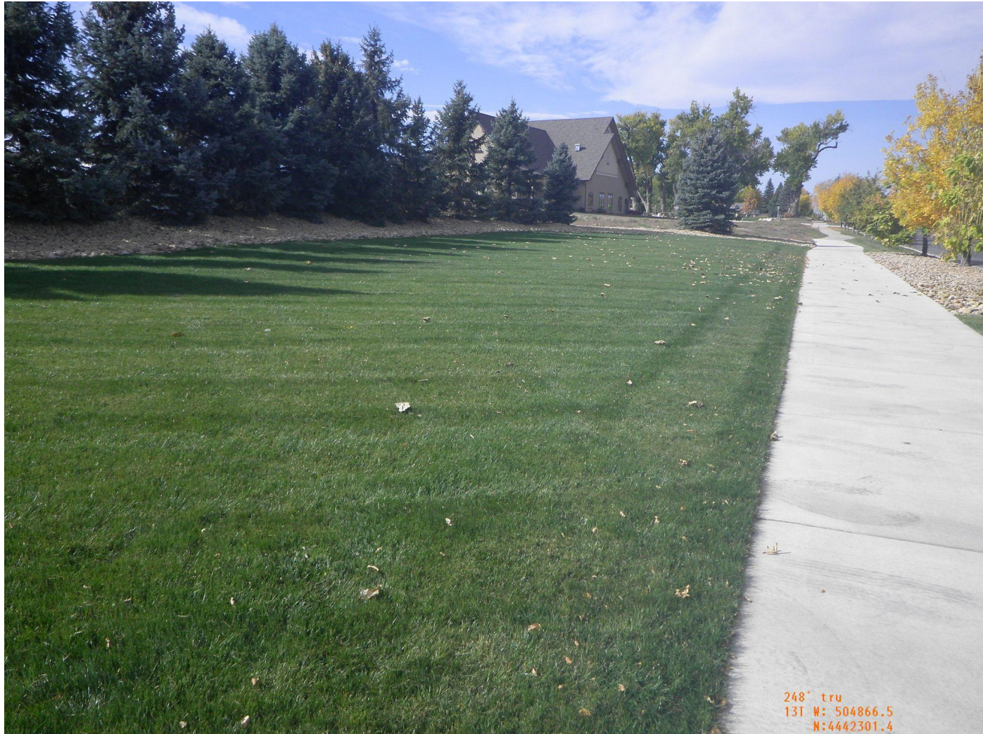
Photo 6. Overview photo of the tank battery taken at ground level from the eastern edge facing west.