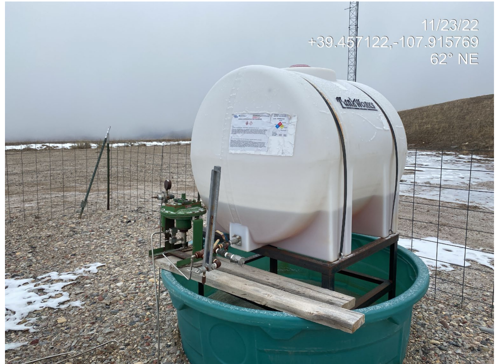
Photo 5. Photos show two secondary containment tanks lacking wildlife protection BMPs.