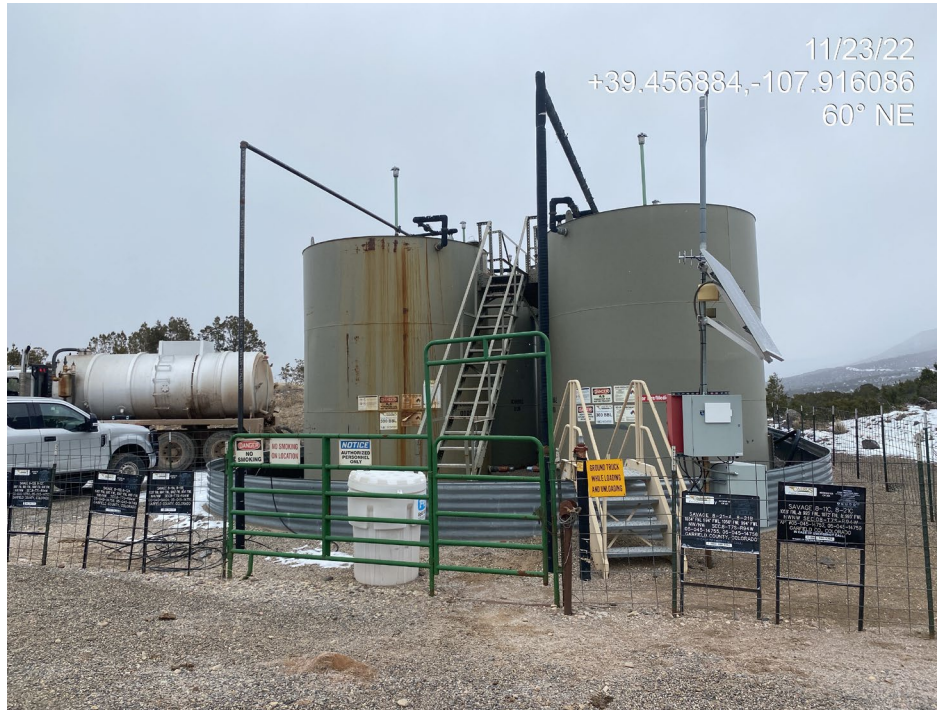
Photo 2. Photo shows production areas.