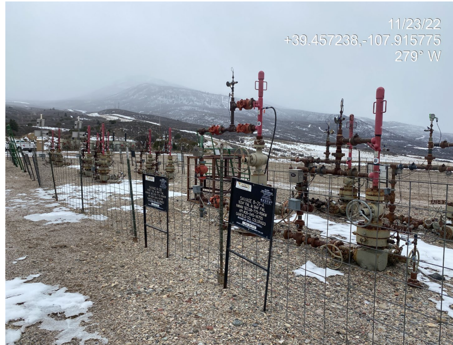
Photo 3. Photo shows production areas.