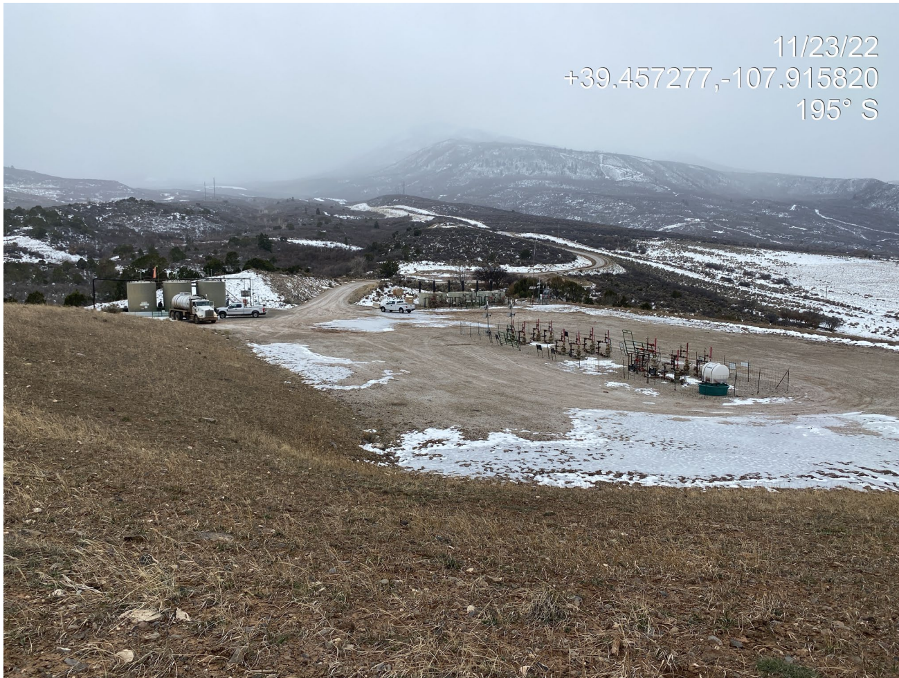
Photo 1. Photo taken from the north shows an overview of the location.