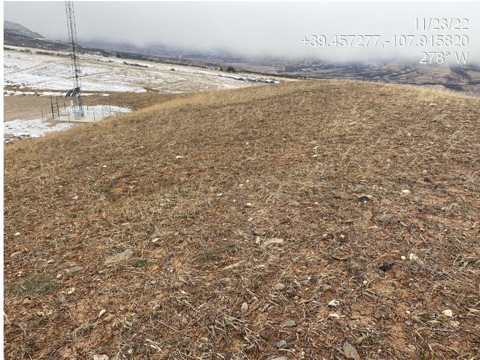
Photo 6. Photo shows interim areas are dominated by introduced perennial grasses smooth brome and crested wheatgrass.