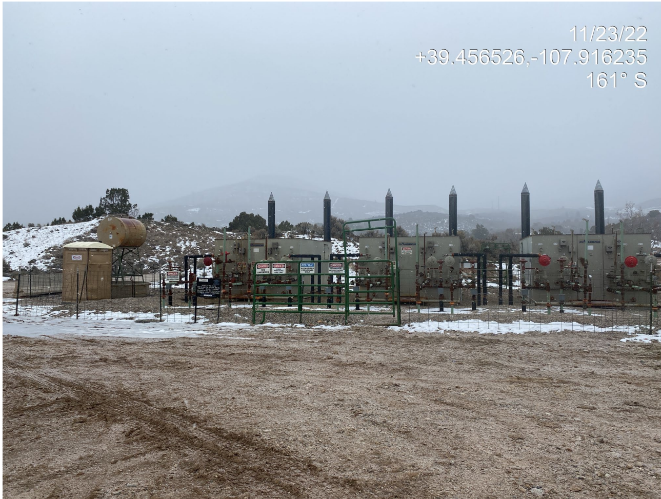
Photo 4. Photo shows production areas.