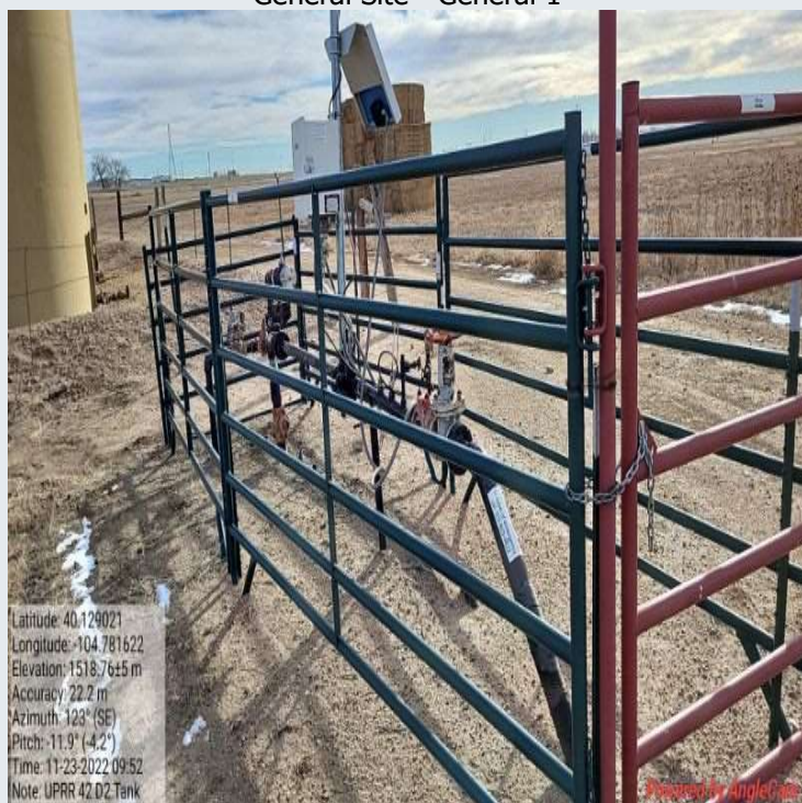
General Site - General 1