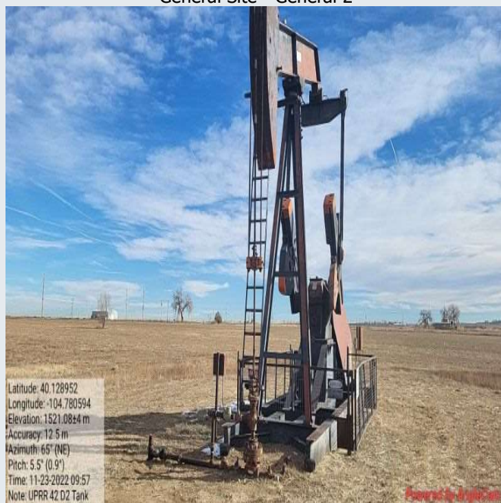
General Site - General 2