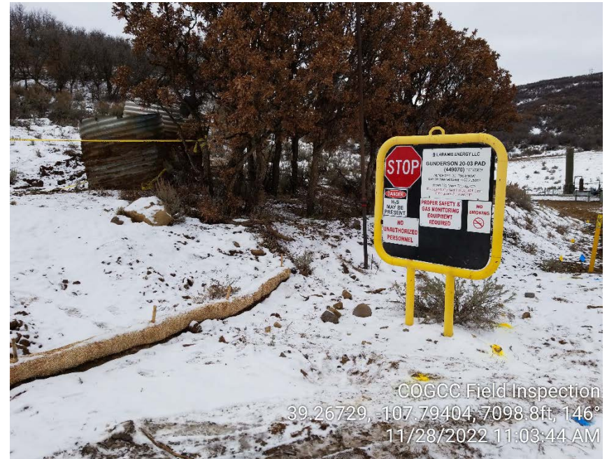
Photo #9 – View of recovery trenches at northwest end of flow path, looking north.

COGCC Field Inspection 39.26729, -107.79404, 7098.8ft, 146° 11/28/2022 11:03:44 AM