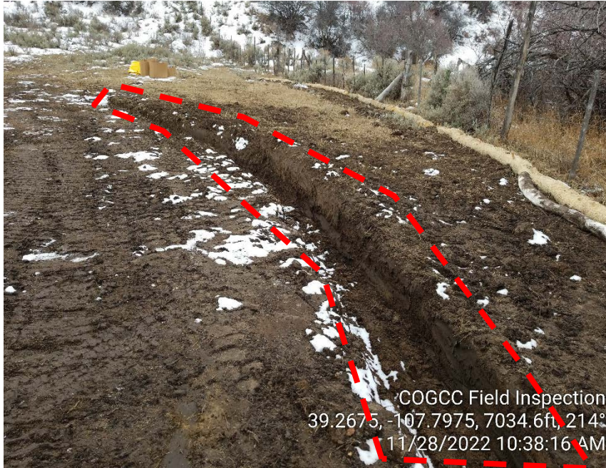
Photo #5 - Distal recovery trench measured approximately 18 inches wide by 12 inches deep by 35 feet long.