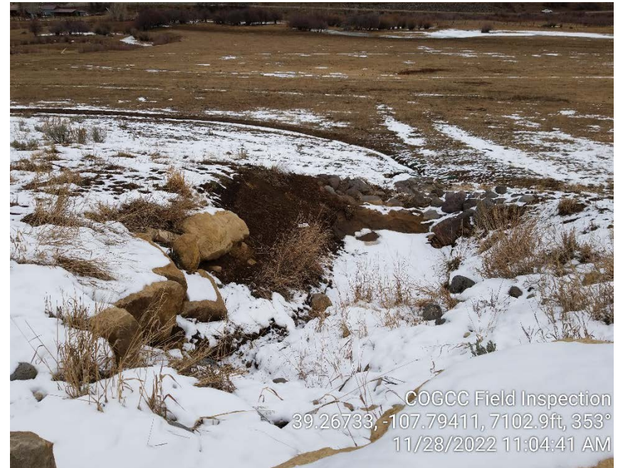
Photo #12 – Sediment trap and stormwater ditch located north of POR conveyed released fluids off-location. Fluids escaped the ditch and ultimately entered Buzzard Creek.