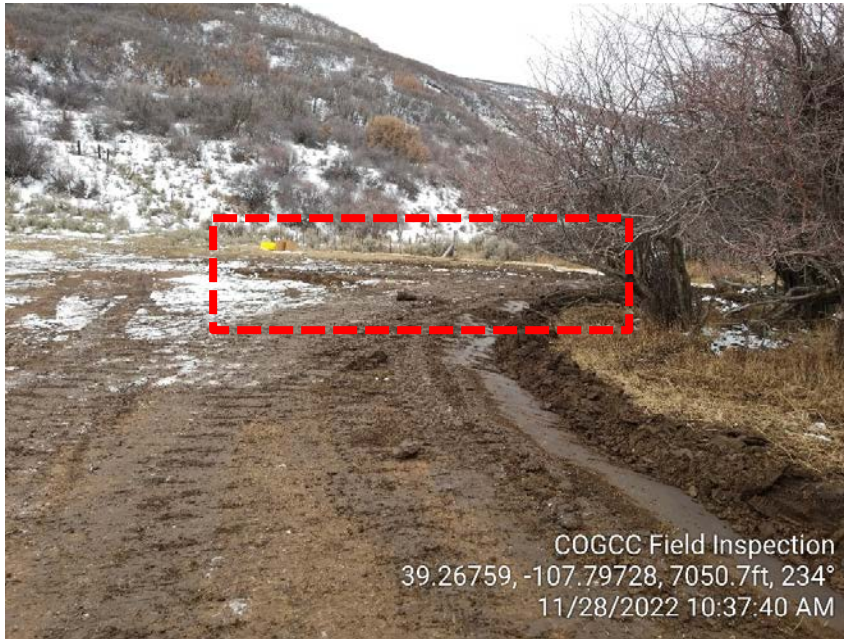
Photo #3 – Surface soil had been removed with heavy equipment prior to inspection date. This photo depicts the northwest extent of the scraped area with trees remaining. Red square depicts approximate location of two recovery trenches that were constructed as emergency pits to contain released fluids.