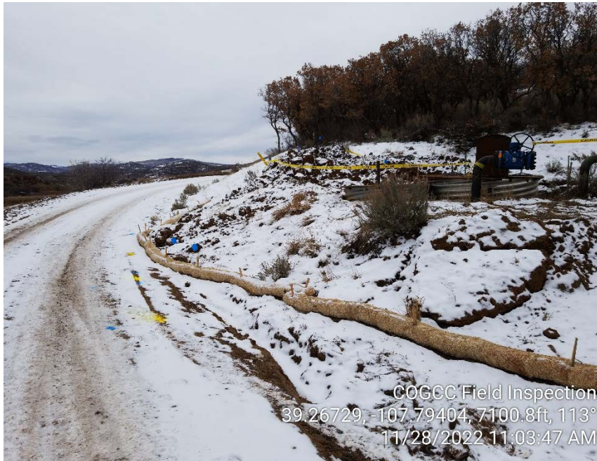
Photo #11 – Excavated valve cans at the Point of Release (POR) of Spill/Release ID #483326.