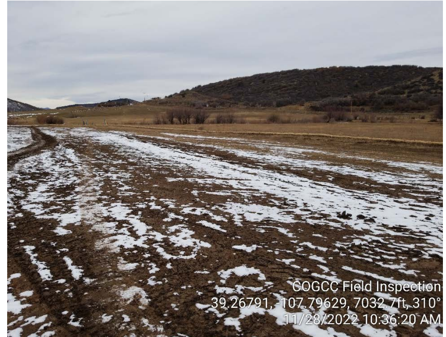
Photo #2 – View of northern end of flow path, looking northwest. Operator had installed straw wattle along north end of impact area prior to inspection date.