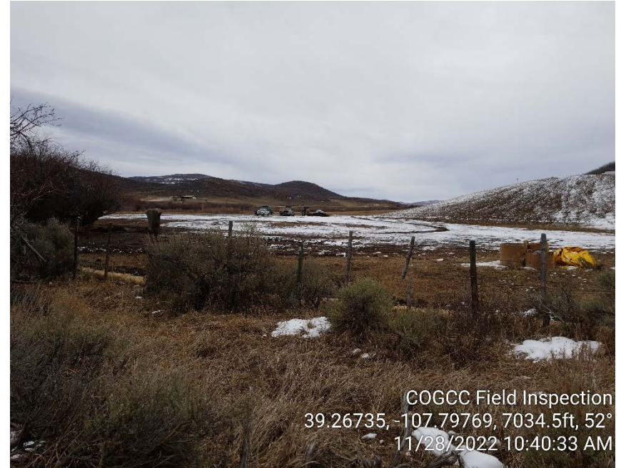
Photo #8 – View of flow path area from Buzzard Creek, looking east.