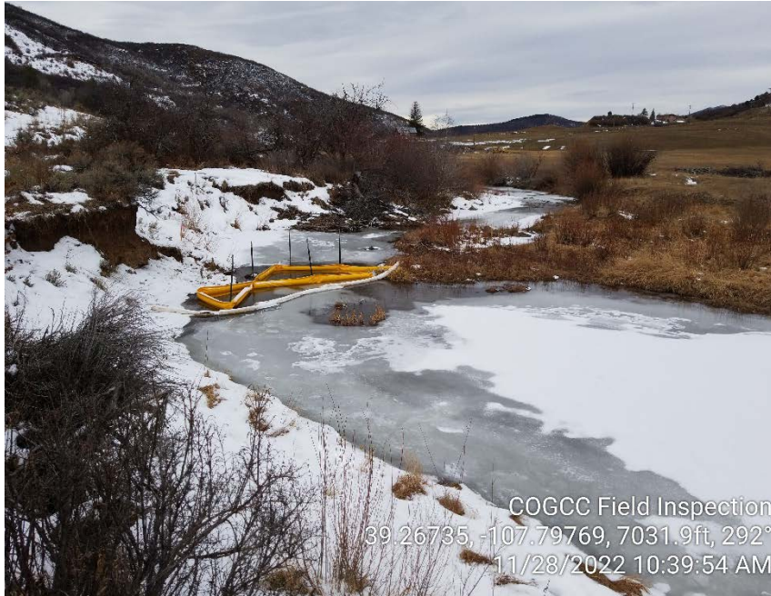
Photo #7 – View of surface booms installed on Buzzard Creek downstream from area where released fluids entered the creek channel.