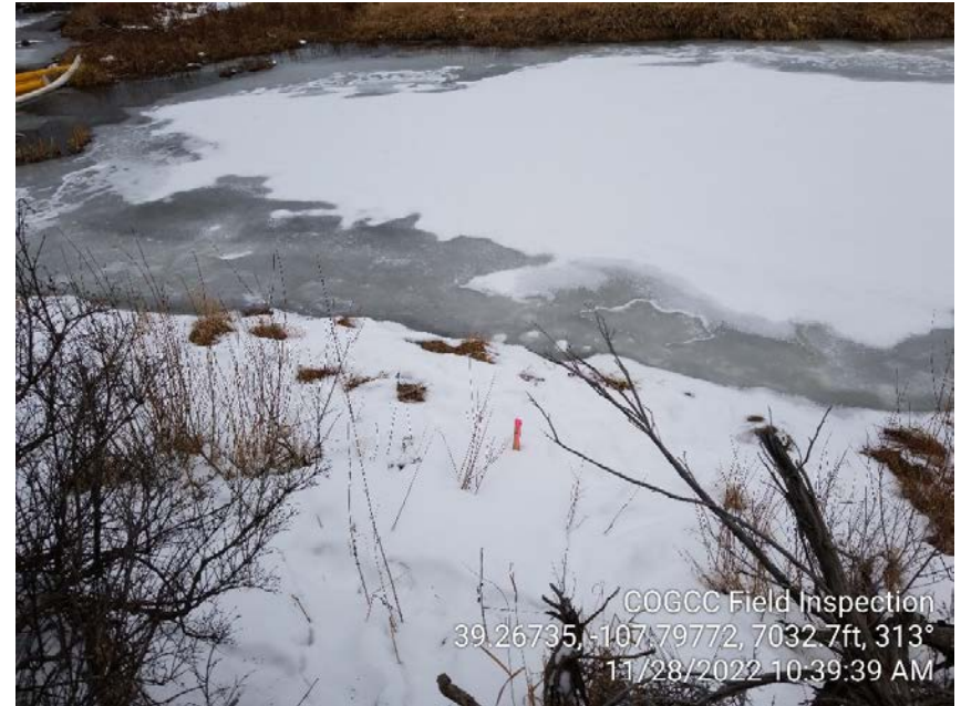
Photo #6 – View of Buzzard Creek at approximate location of released fluids flow path. Stake in photo is at the Operator's surface water sampling location for the release area of produced fluids into Buzzard Creek.