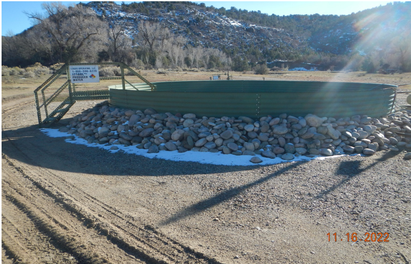
Photo 2. Facing toward the open top tank. There has been round rock placed around the containment. The round rock is pervious and will not prevent flood water from entering underneath the steel containment. Round rock will also be easily displaced as they do not lock in place as well as angular rock. Another solution needs to be implemented.