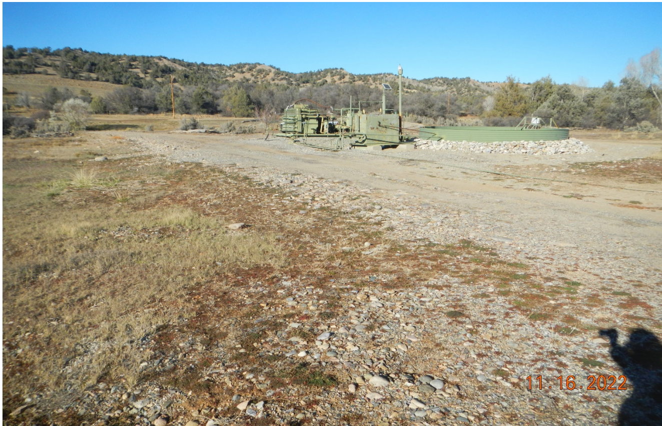
Photo 8. Facing northeast toward the location.