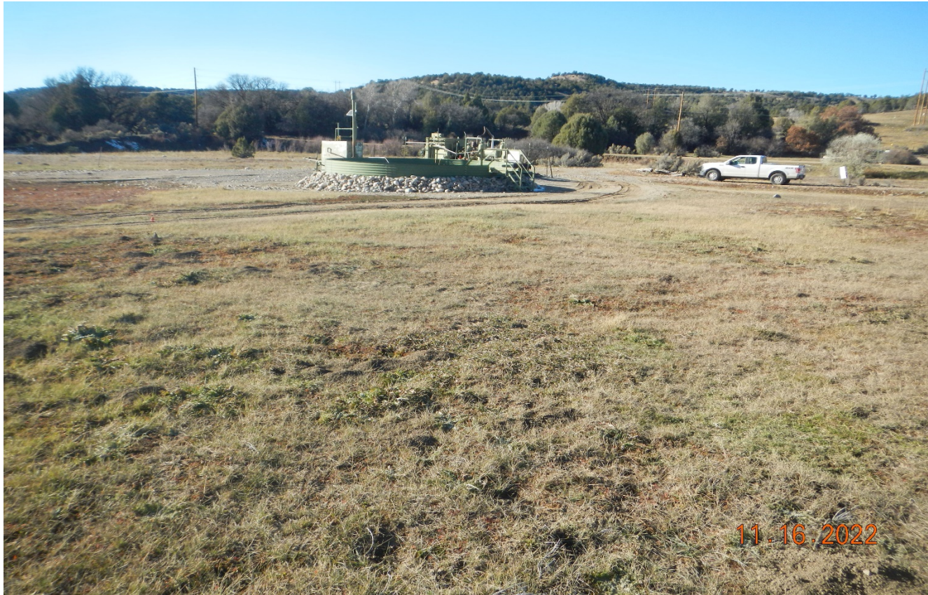
Photo 6. Facing northwest toward the location.