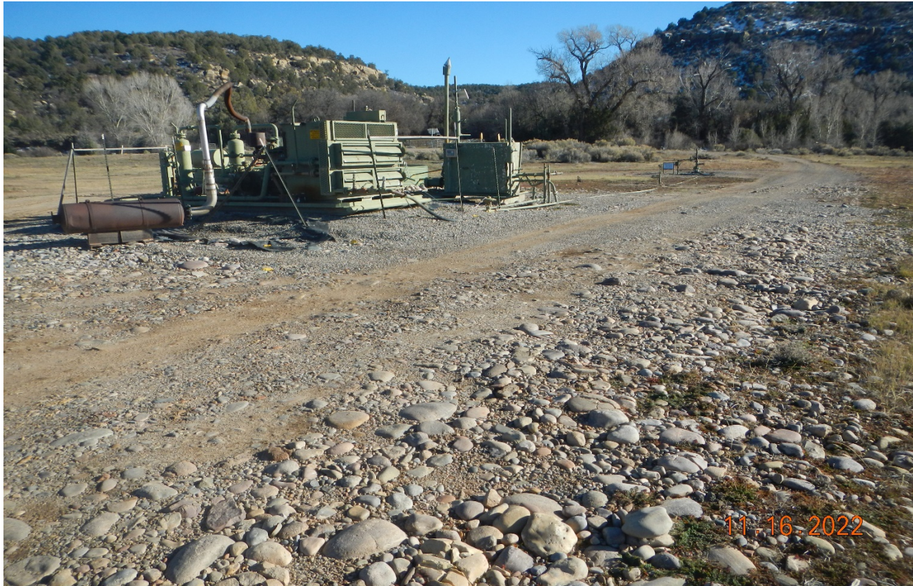
Photo 9. Facing southeast toward the location. The area of the road shows signs of scouring where flood flows across the road from left to right towards the Florida River.