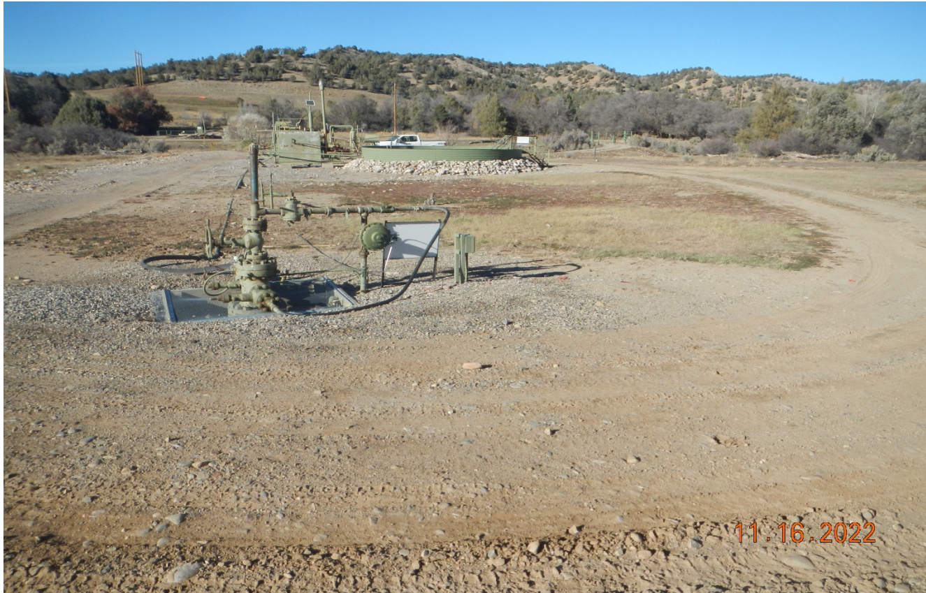
Photo 7. Facing north toward the location. The wellhead cellar was covered to prevent entry.