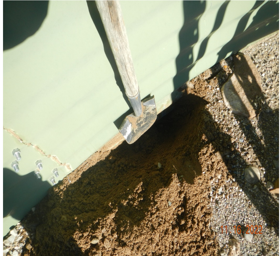
Photo 4. The steel containment is only about 4 inches below grade. The steel containment is not constructed per the Operator's SWMP.