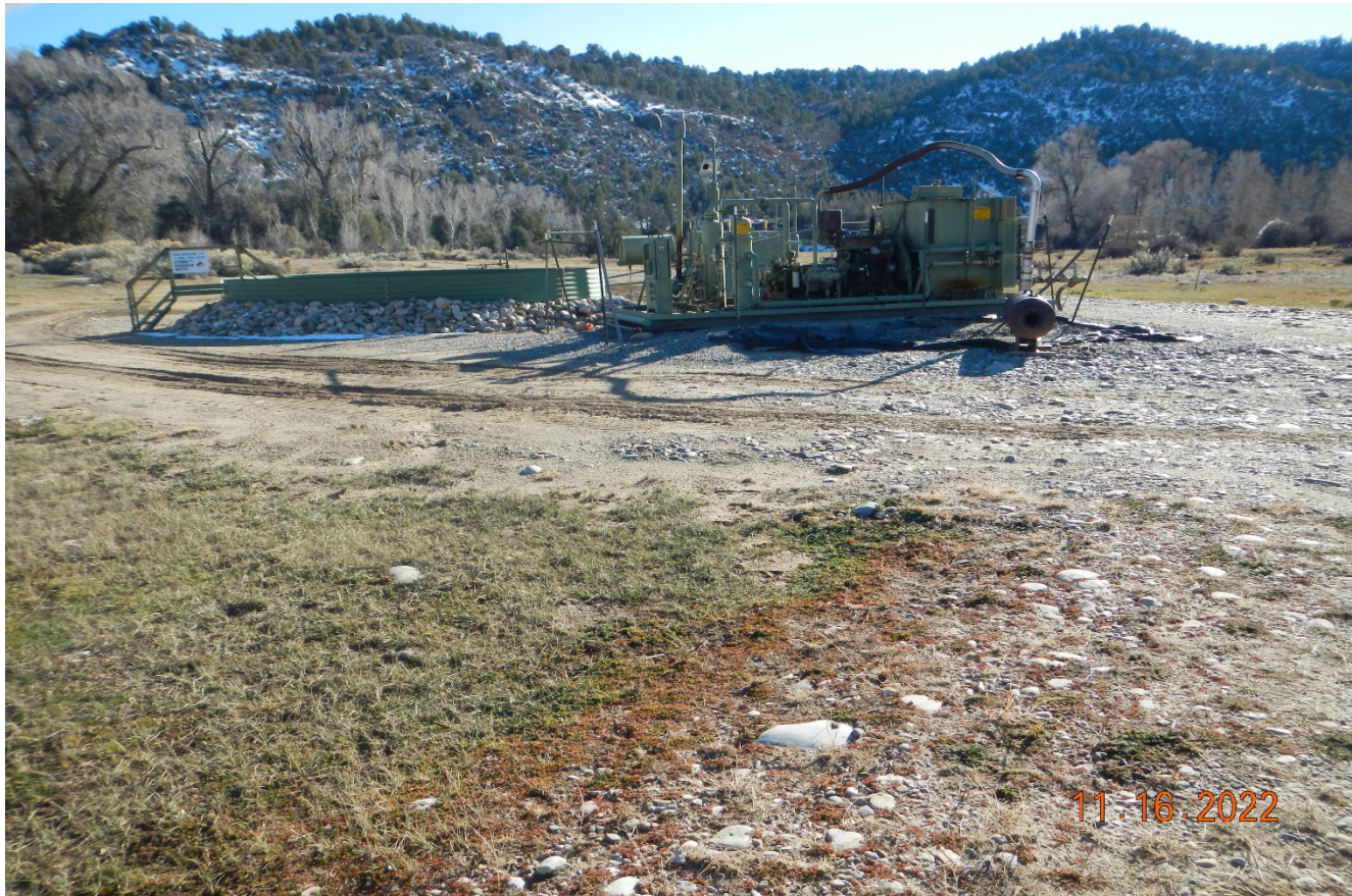
Photo 1. Facing southeast toward the location and production equipment. The wellsite is located within an oxbow of the Florida River that is prone to flooding.