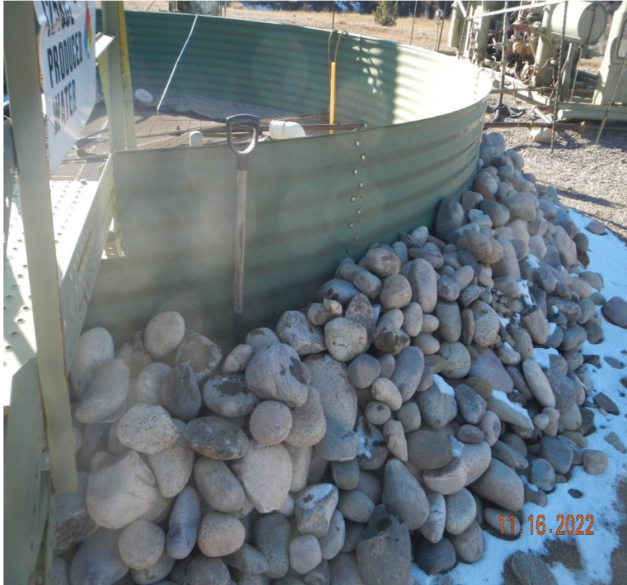
Photo 3. The steel containment is no constructed per the Operator's SWMP. A 3.5 ft. shovel was placed at the containment for scale.