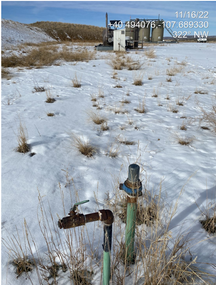
Photo 11. Photos taken from the southwest shows two (2) unused risers.