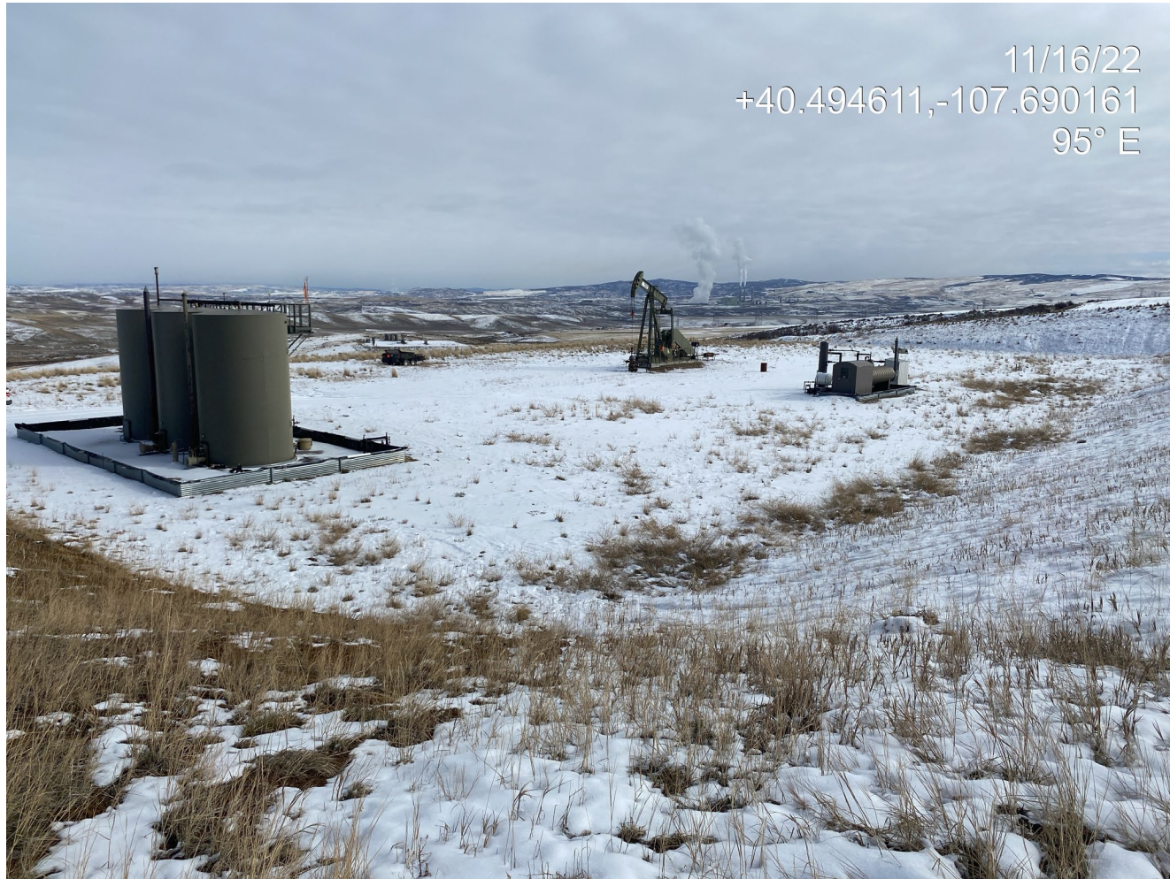
Photo 1. Photo taken from the northwest shows an overview of the Location.