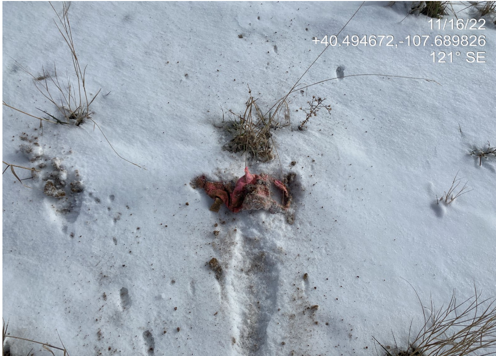
Photo 4. Photos show trash.