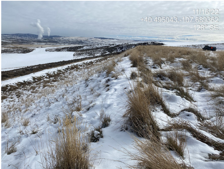
Photo 6. Photo taken from the northeast of the Location shows interim reclamation has not been performed. The location still has large cut and fill slopes with a topsoil berm below, and a flat pad.