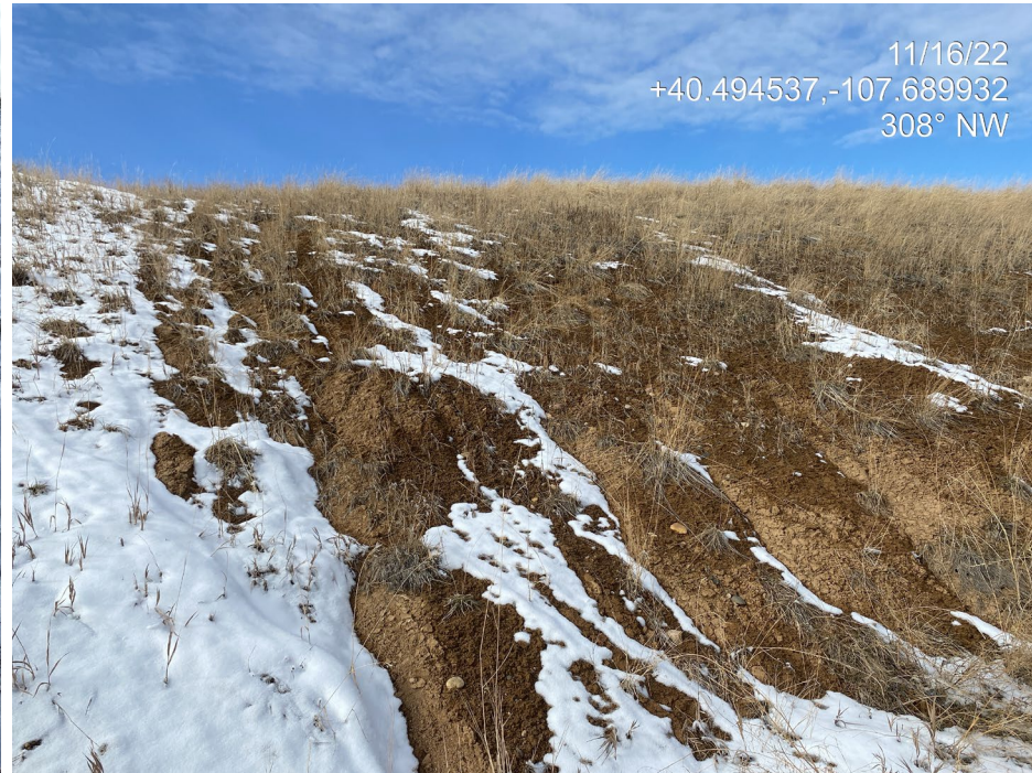
Photo 10. Photos shows cut slopes to the northwest of the Location where rill erosion is occurring.