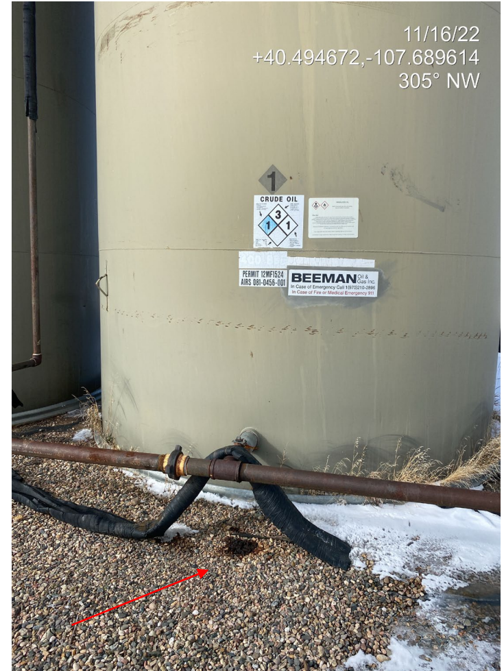
Photo 3. Photo shows staining within the tank battery secondary containment BMP.