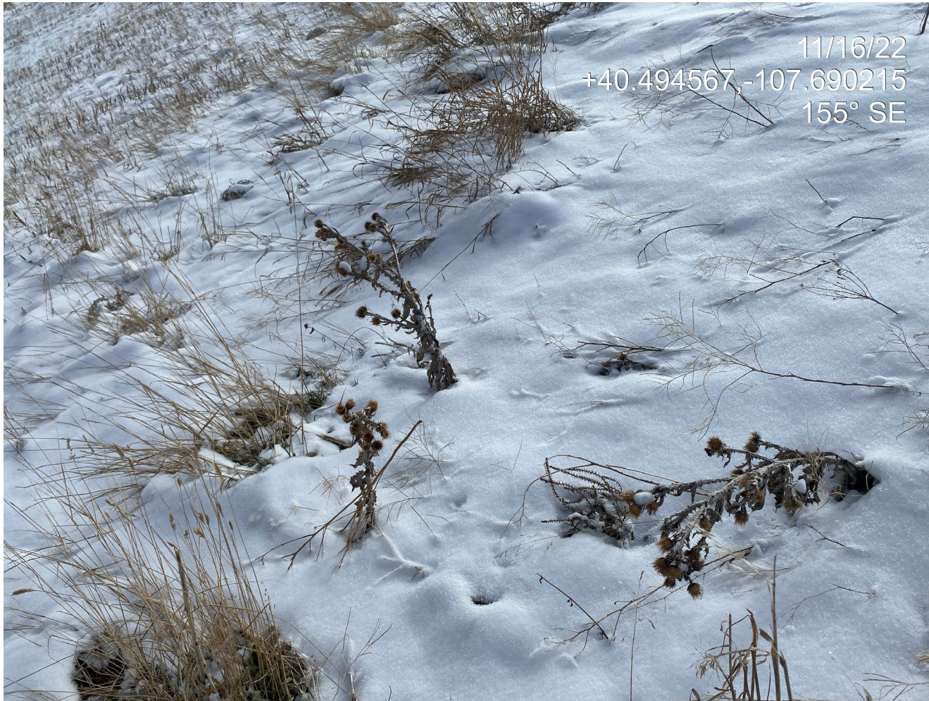
Photo 5. Photo taken from the northwestern cut slopes of the Location shows scotch thistle (List B Noxious). No evidence of weed management observed.