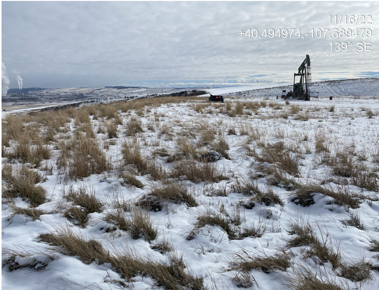
Photo 8. Photo taken from the northeast of the Location shows areas not needed for production operations where interim reclamation is required. Re-seeding alone is not sufficient. Interim reclamation is required.