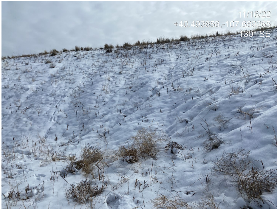
Photo 9. Photos shows cut slopes to the southwest of the Location where rill erosion is occurring. Although obscured by snow cover, rills are still evident. There is no evidence action have been taken to address erosion issues.