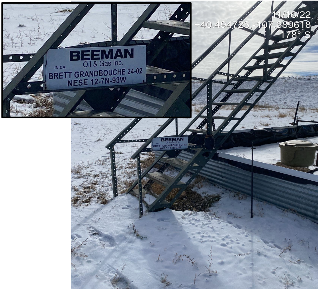
Photo 2. Photo shows the tank battery sign does not comply with Rule 605.e.