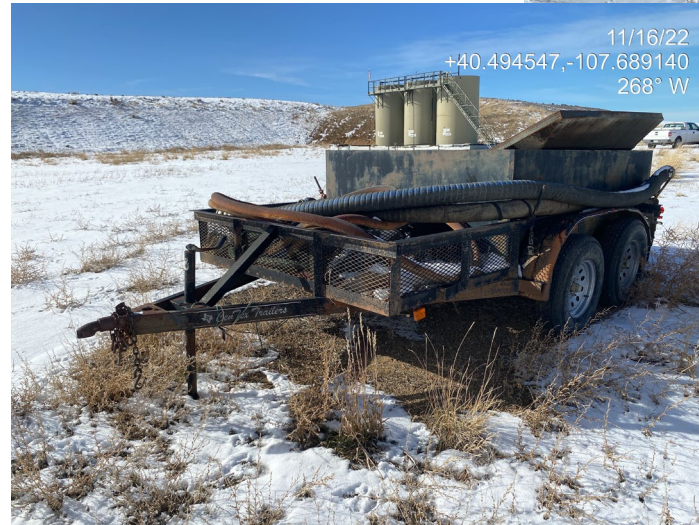
Photo 12. Photos shows storage of supplies/equipment.