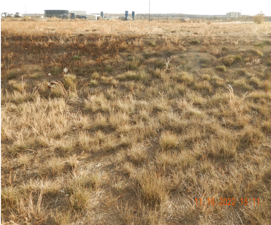
Photo 4. Photo taken from the southern tank battery location, facing South. See comments under Photo 2.