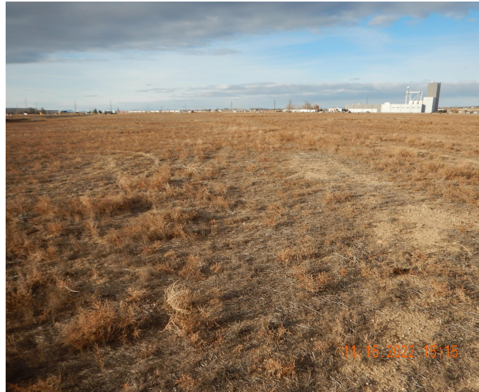
Photo 3. Photo taken from the well location, facing North. Photo illustrates vegetation is a mix of perennial grasses and annual weeds throughout the location and reference areas.