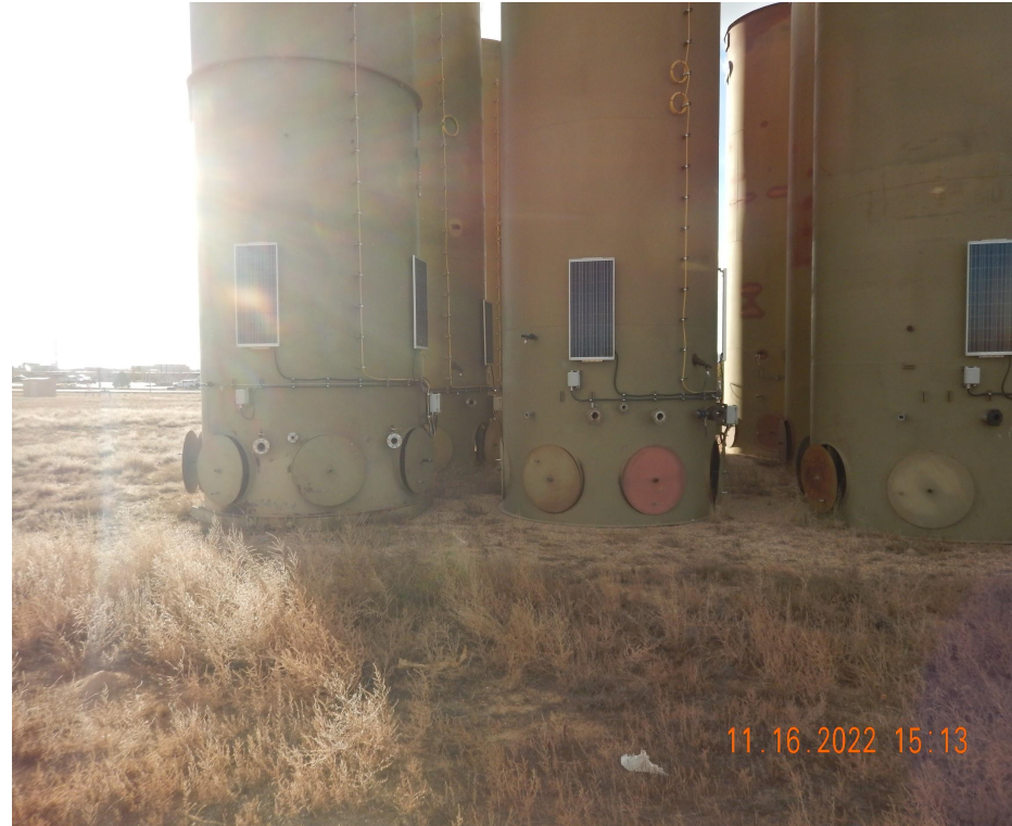
Photo 5. Photo taken from the remainder of the tank battery location, facing West. Photo illustrates a land use change and equipment is now be stored at location.