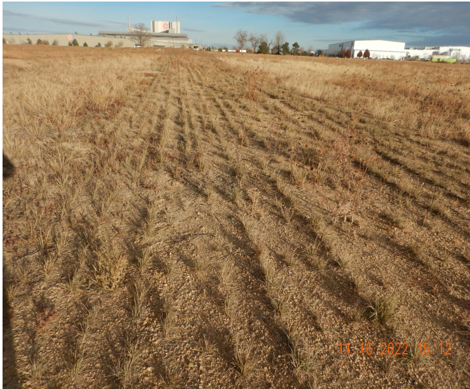
Photo 2. Photo taken from a portion of the well location access road, facing East. Photo illustrates perennial grasses established along the access road with mostly annual weeds throughout the reference areas.