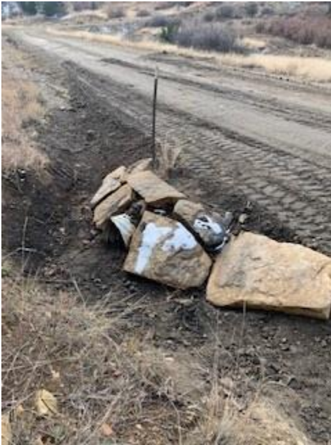
Installed and repaired the required BMP's per Rule 1002.f.(2)C