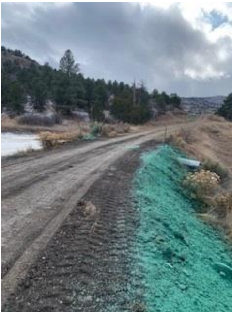
Installed and repaired the required BMP's per Rule 1002.f.(2)C