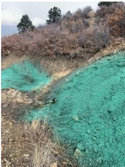
Installed and repaired the required BMP's per Rule 1002.f.(2)C