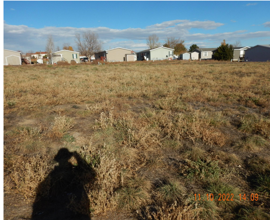
Photo 3. Photo taken from the well location, facing North. See comments under Photo 2.