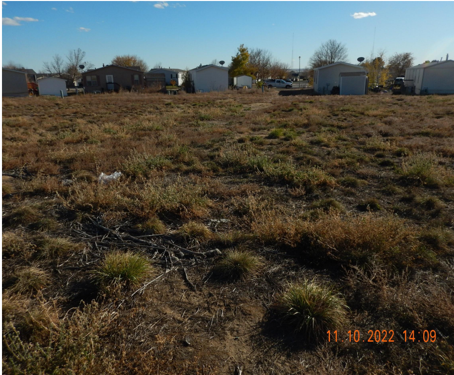
Photo 4. Photo taken from the well location, facing South. See comments under Photo 2.