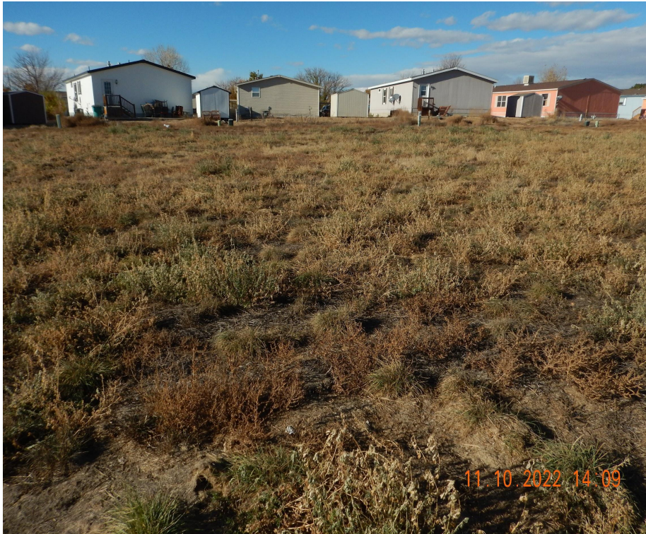
Photo 2. Photo taken from the well location, facing North. Photo illustrates location is now part of a mobile home park.