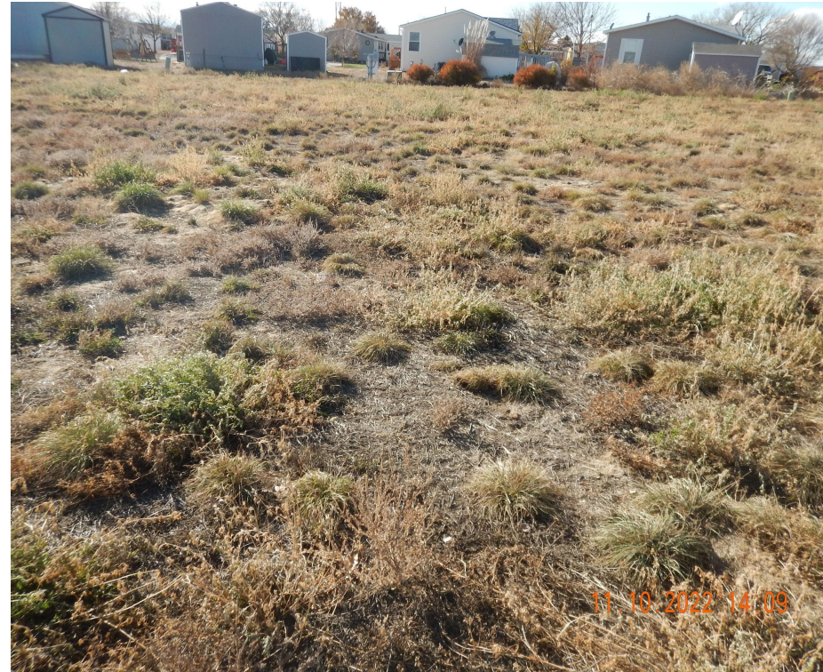
Photo 5. Photo taken from the well location, facing West. See comments under Photo 2.