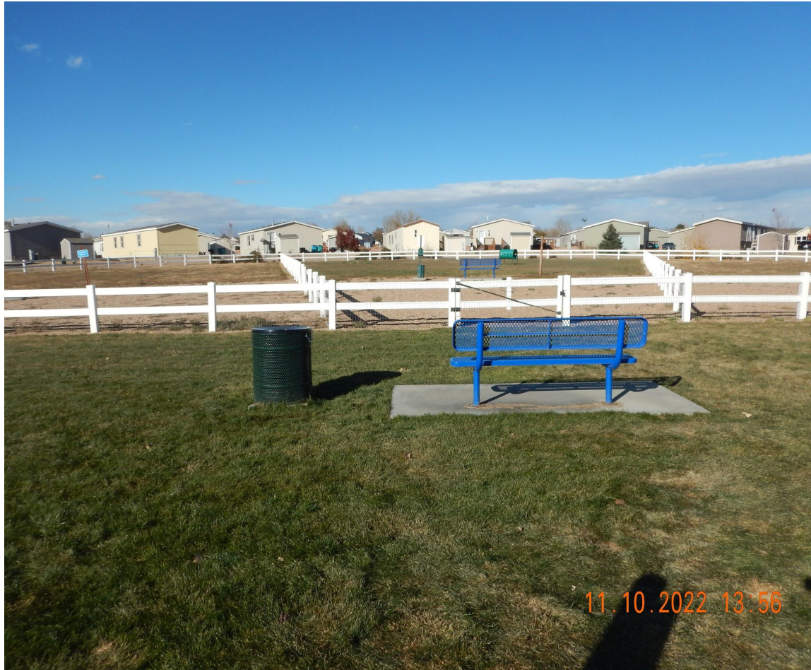
Photo 2. Photo taken from the well location, facing North. Photo illustrates a dog park and location is now part of a mobile home park.