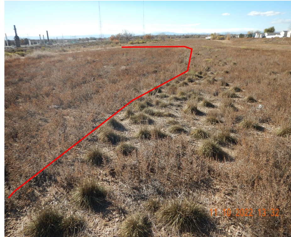
Photo 4. Reference areas are everything right of the red line, facing West. Photo illustrates the establishment of perennials with annual tumbleweeds.