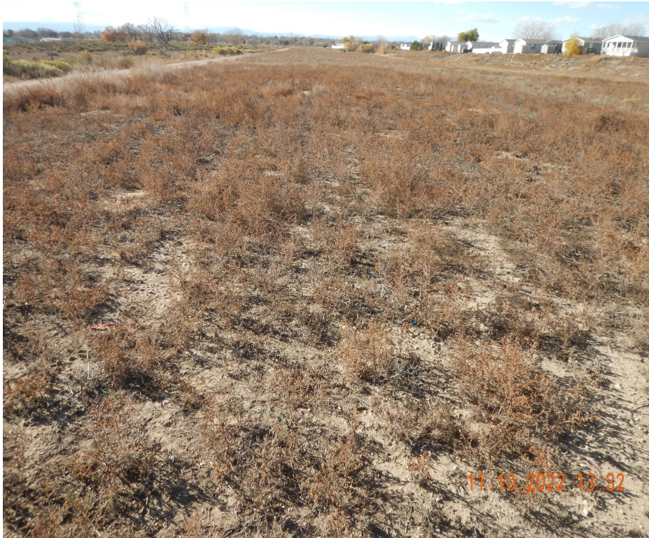
Photo 3. Photo taken from the associated tank battery, facing West. Photo illustrates mostly annual tumbleweeds.