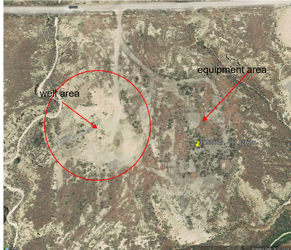
Photo 2. Photo shows satellite imagery of the location dated 6/17/2016, nine days after the Operator indicated final reclamation corrective action was addressed. Imagery shows evidence of potential work around the wellhead (increase in bare ground/change in vegetation). The rest of the Location (in particular the equipment areas to the east remain unchanged).