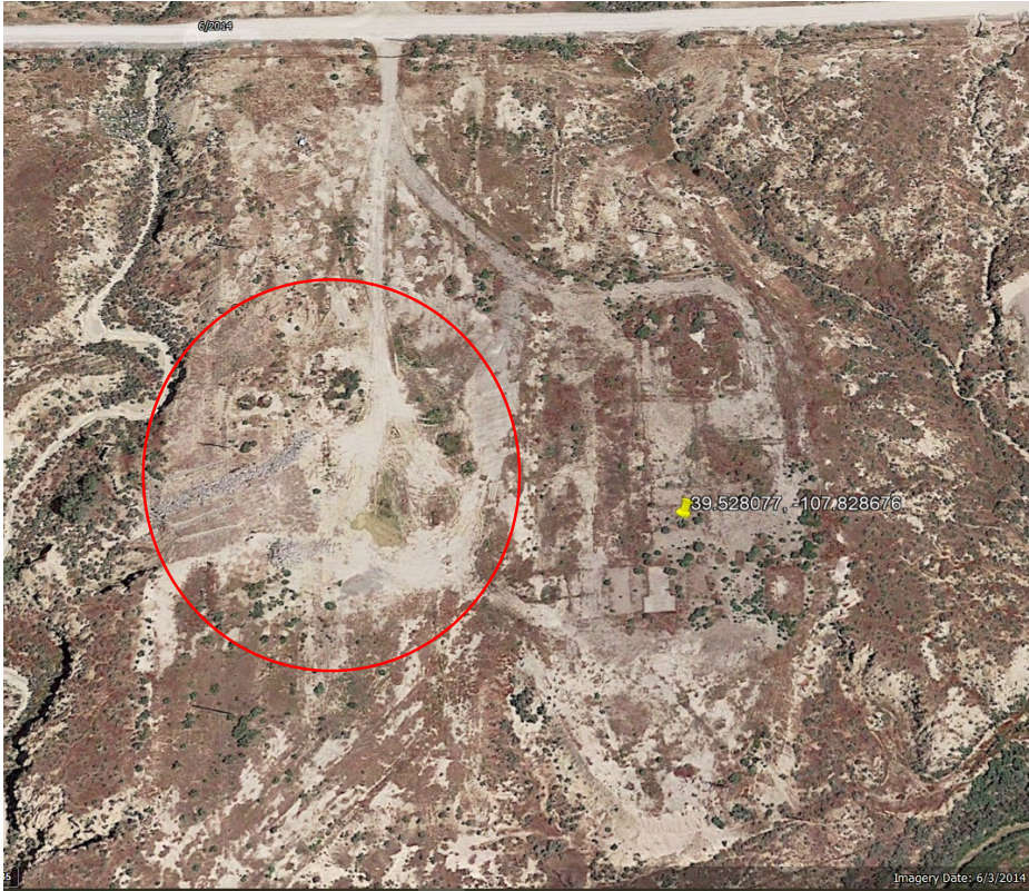
Photo 1. Photo shows satellite imagery of the location dated 6/3/2014. Note, roads and equipment footprints are evident indicating reclamation has not been performed.