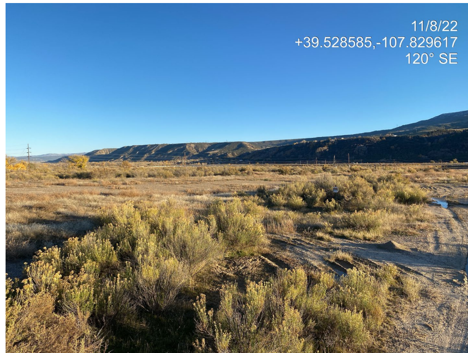
Photo 5. Photo taken from north shows an overview of the eastern portion of the location.