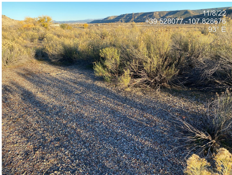
Photo 8. Photo shows a portion of the former equipment area at the east. Note compacted, graveled pad.