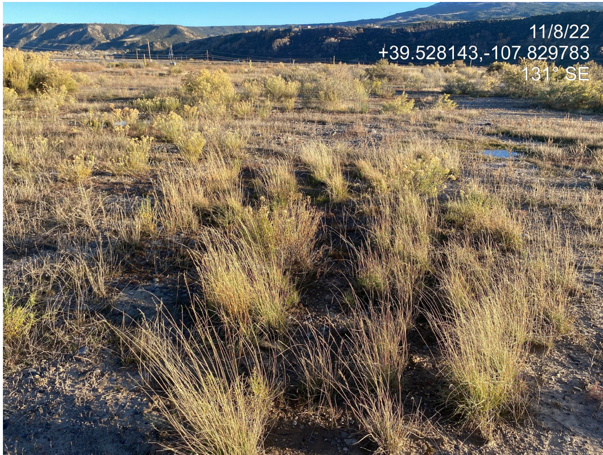
Photo 10. Photo taken adjacent to the well marker shows the area appears to have been seeded with perennial grasses. There is no other evidence of reclamation. Seeded species are sparse and restricted to a small area around the well.