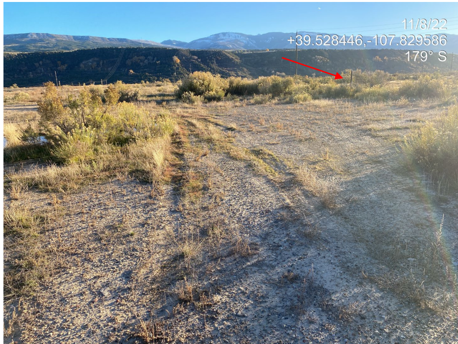
Photo 6. Photo shows an overview of the former well area from the north. Arrow indicates well marker. Note compacted, graveled pad.