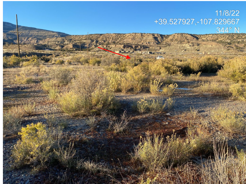
Photo 7. Photo shows an overview of the former well area from the south. Arrow indicates well marker. Note compacted, graveled pad.