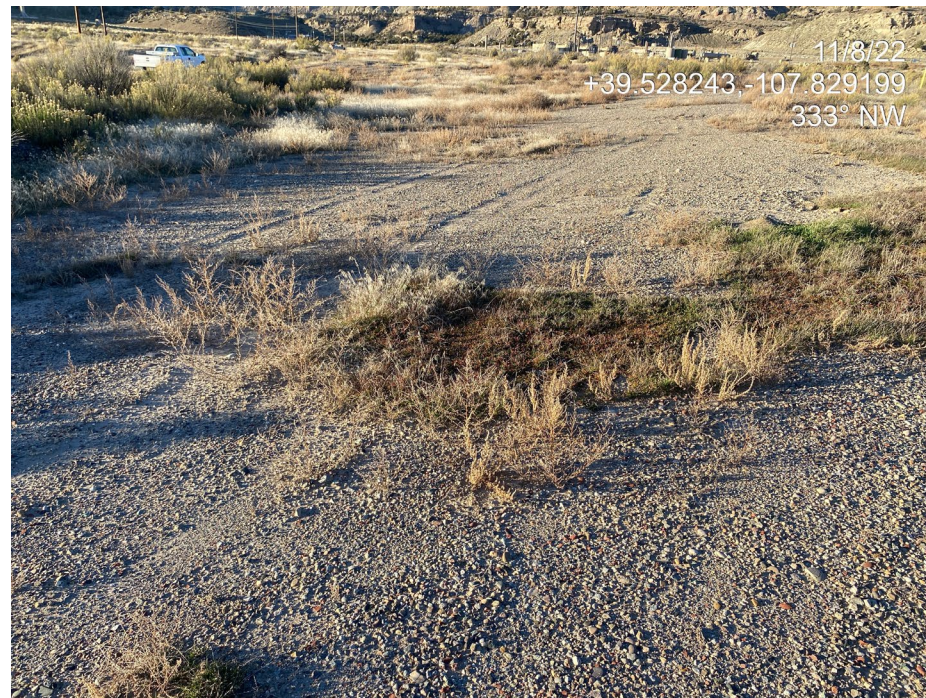
Photo 9. Photo taken from the center of the location disturbance. Note compacted, graveled pad.