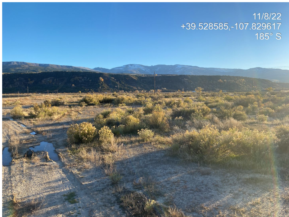
Photo 4. Photo taken from north shows an overview of the western portion of the location.