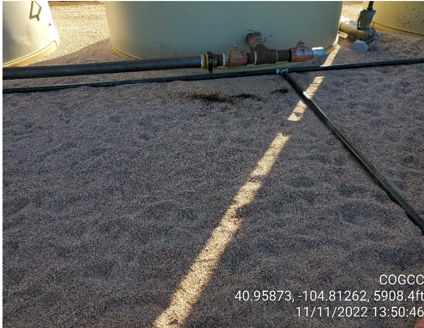
Photo 5 Leak at fittings on crude oil tank load line