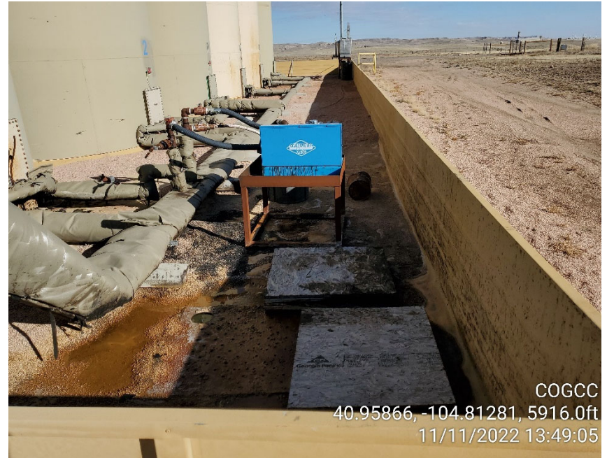
Photo 2 Southwest corner of tank battery, looking east. Pea gravel ballast removed in foreground.