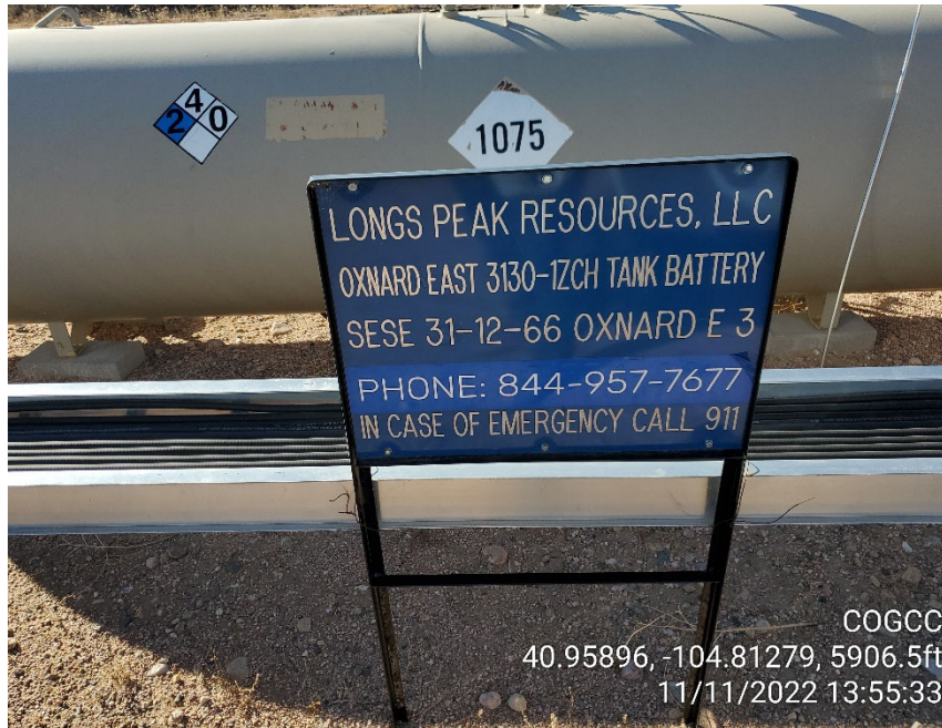
Photo 1 Sign at production facility