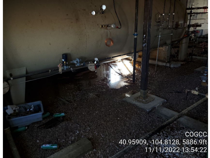
Photo 10 standing liquid inside separator building