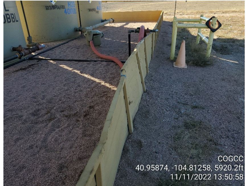
Photo 8 Damaged containment wall on north side of tank battery