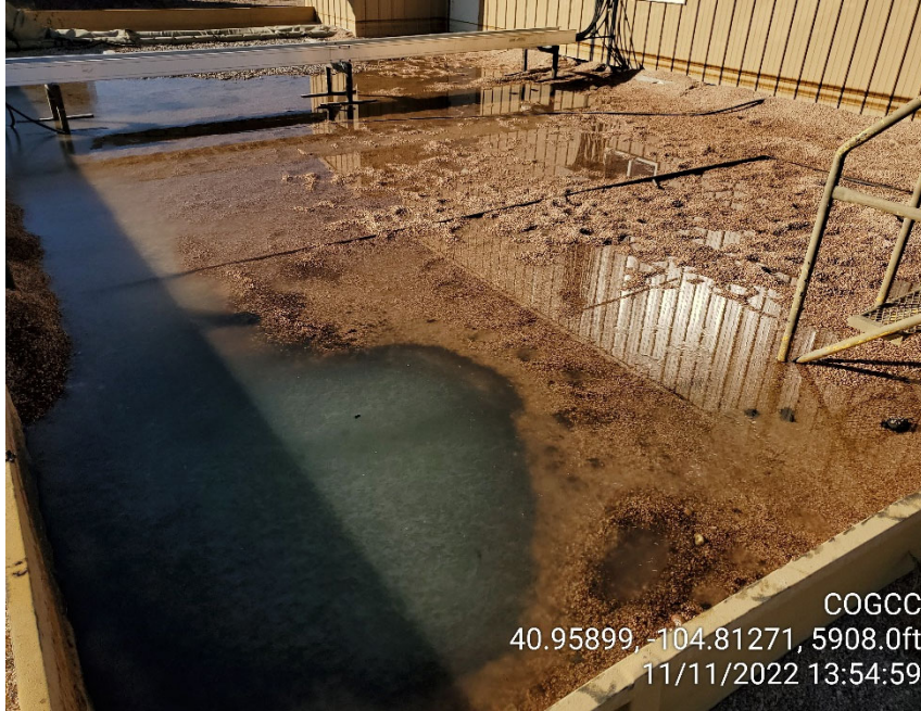
Photo 9 Standing liquid in containment at separator building