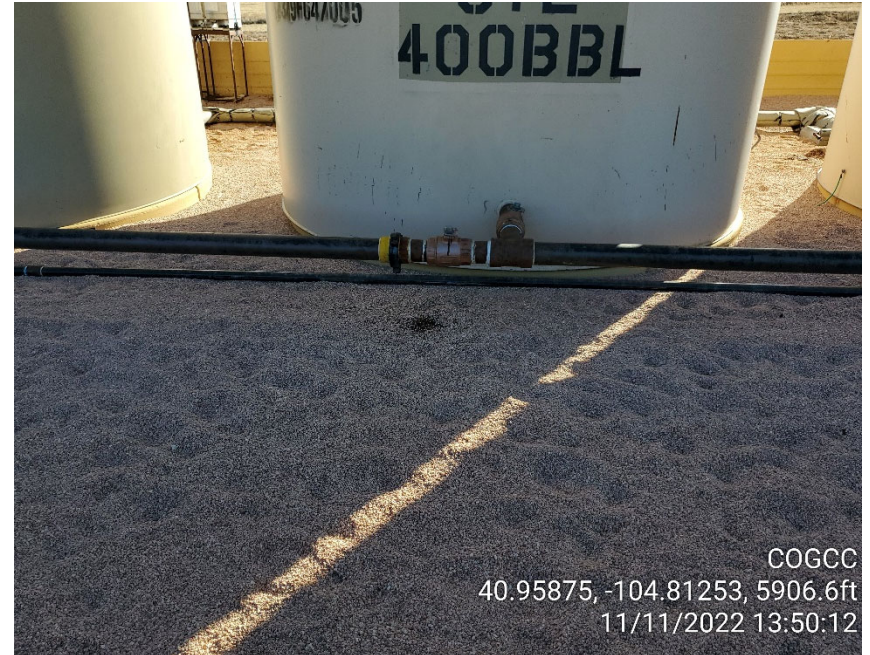
Photo 6 Leak at fittings on crude oil tank load line