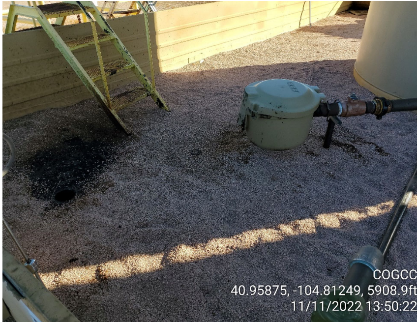
Photo 7 Staining around sump in northeast corner of tank battery