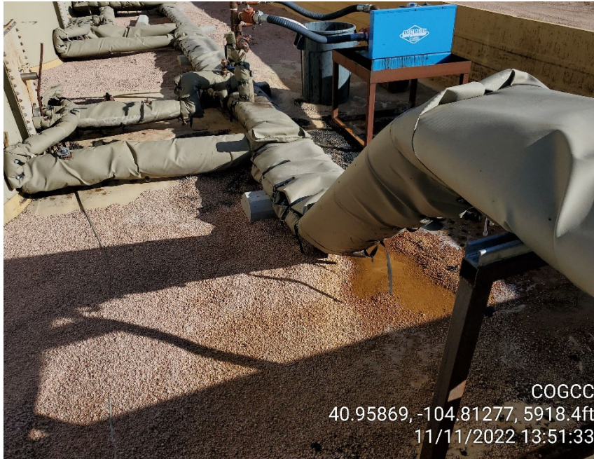
Photo 3 Southwest corner tank battery, dumpline piping.