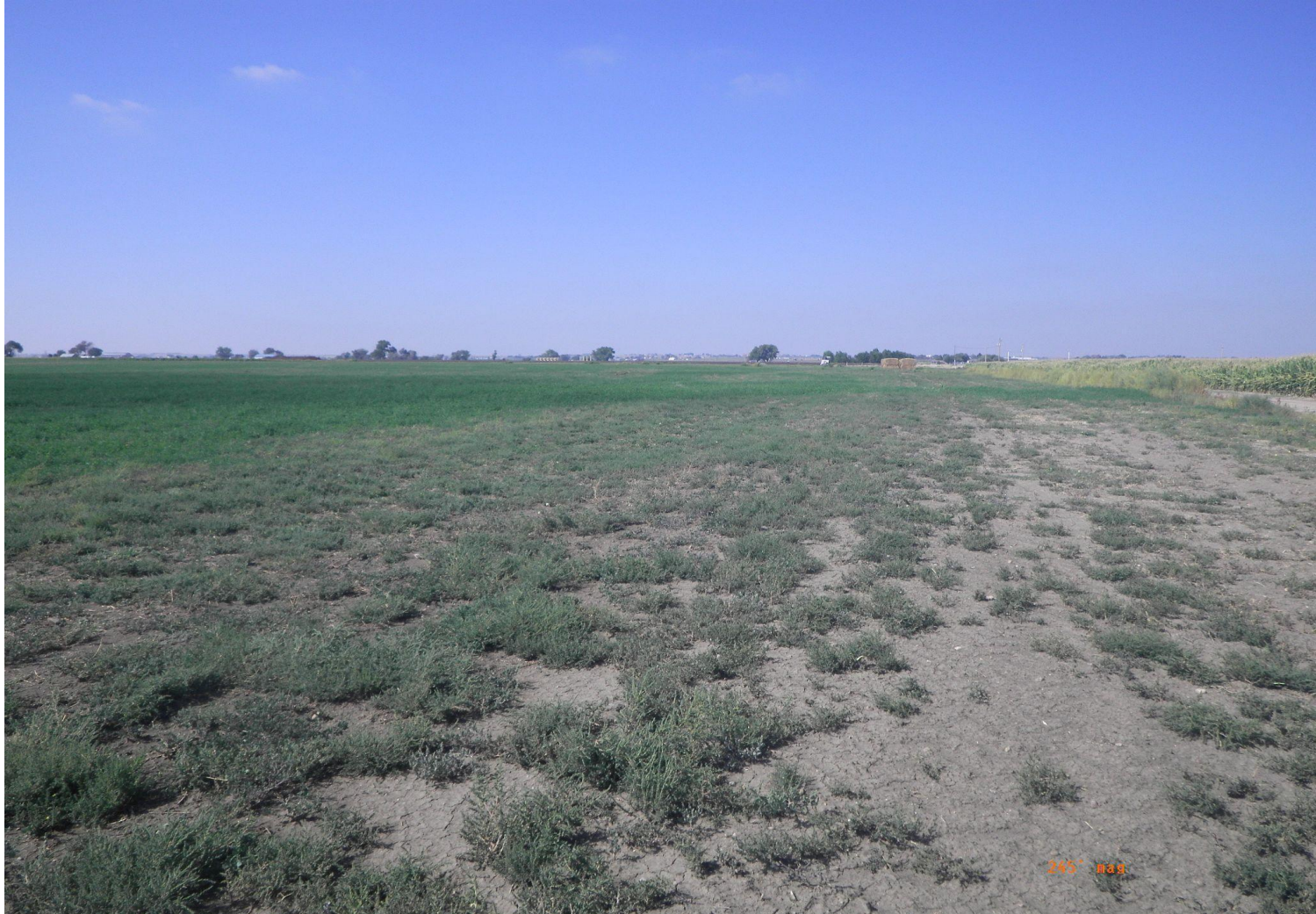
Photo 2. Overview photo of the well pad and tank battery field. Field is dominated by Kochia and appears to be fallow. Site will need to be re-inspected when crop is planted.