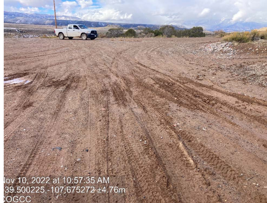
Lack of stabilization/ compaction