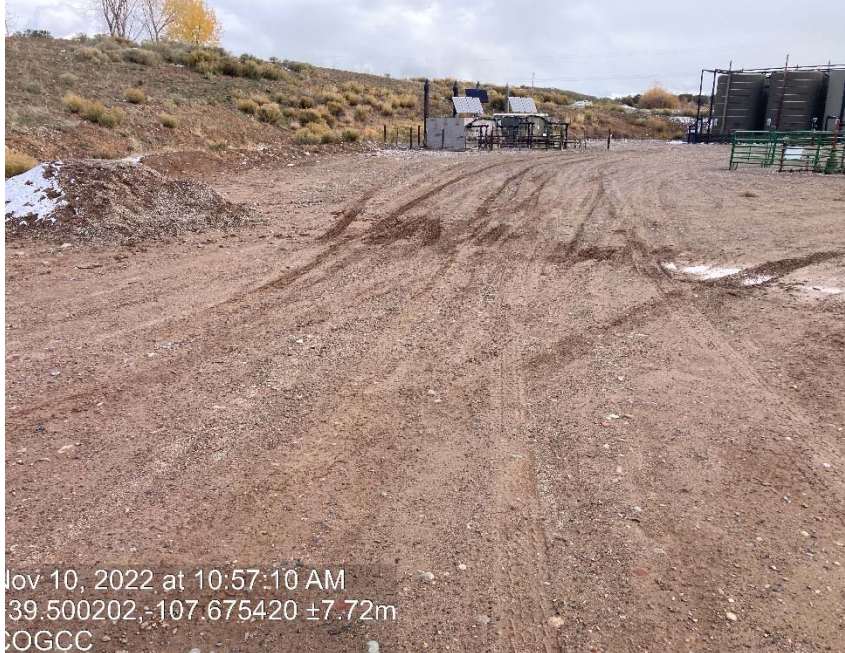
Lack of stabilization/ compaction