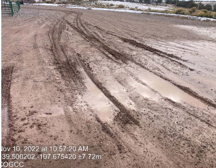
Lack of stabilization/ compaction