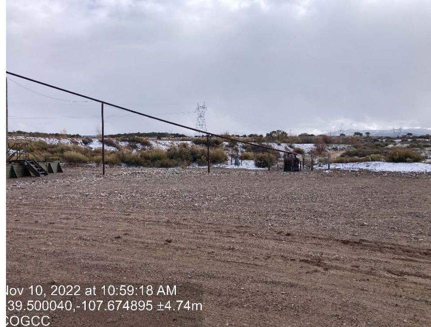
ECD has been removed piping and knock out still in place