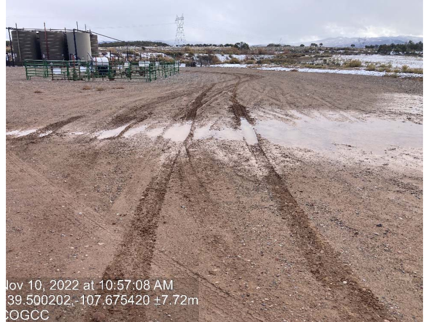
Lack of stabilization/ compaction