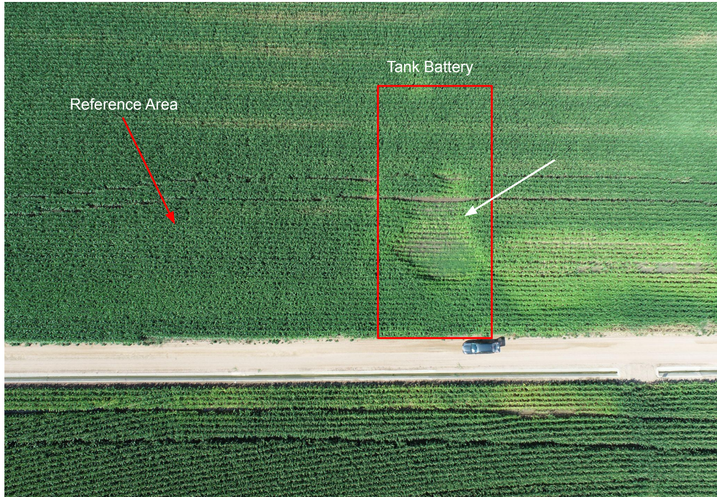
Photo 3. Overview photo of the tank battery and reference area taken from directly above the disturbance using a drone. Note: tank battery shows bare ground and stunted crop growth in the western half of the disturbance.