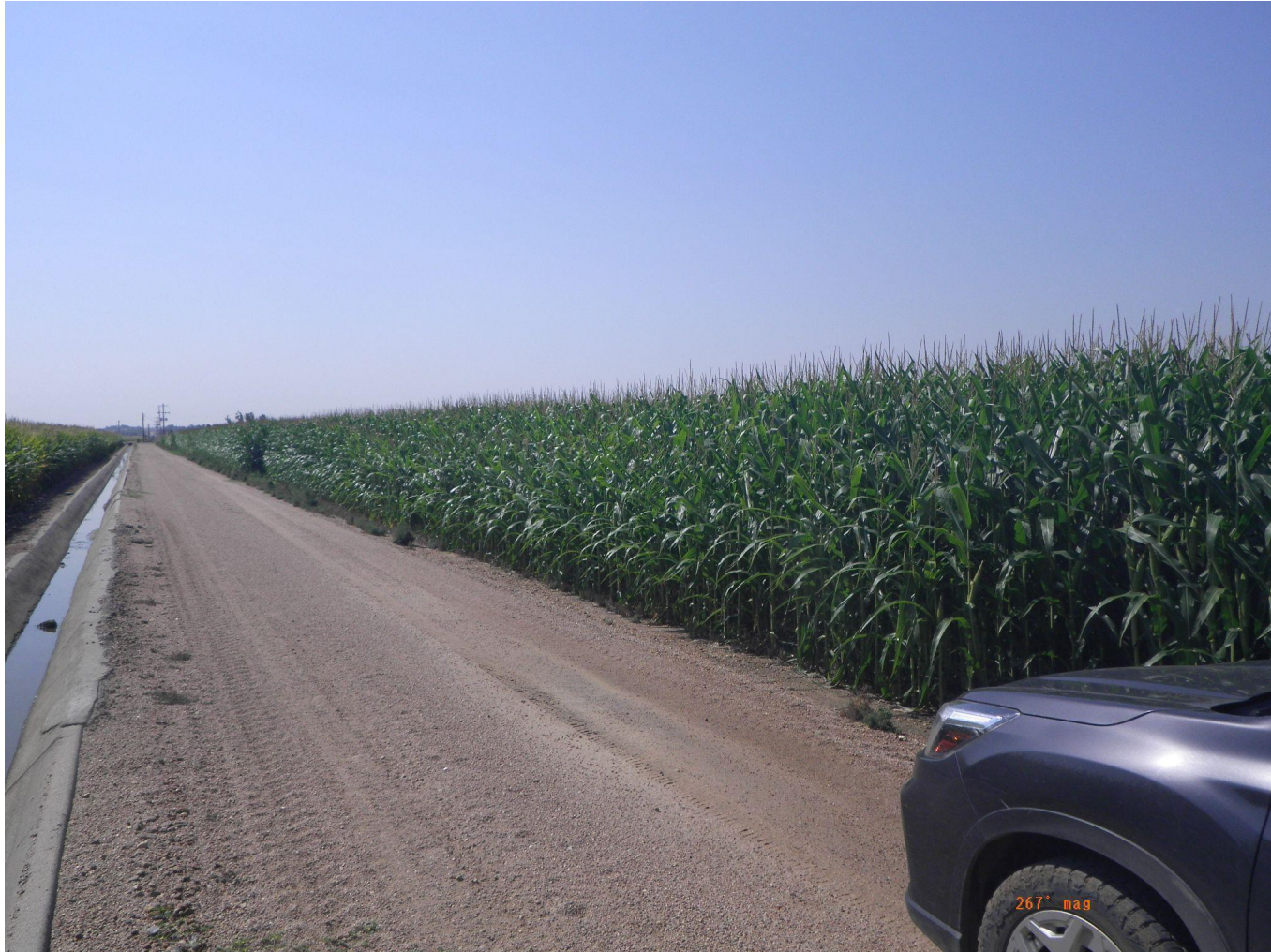
Photo 4. Ground photo of the well pad/tank battery crop field.