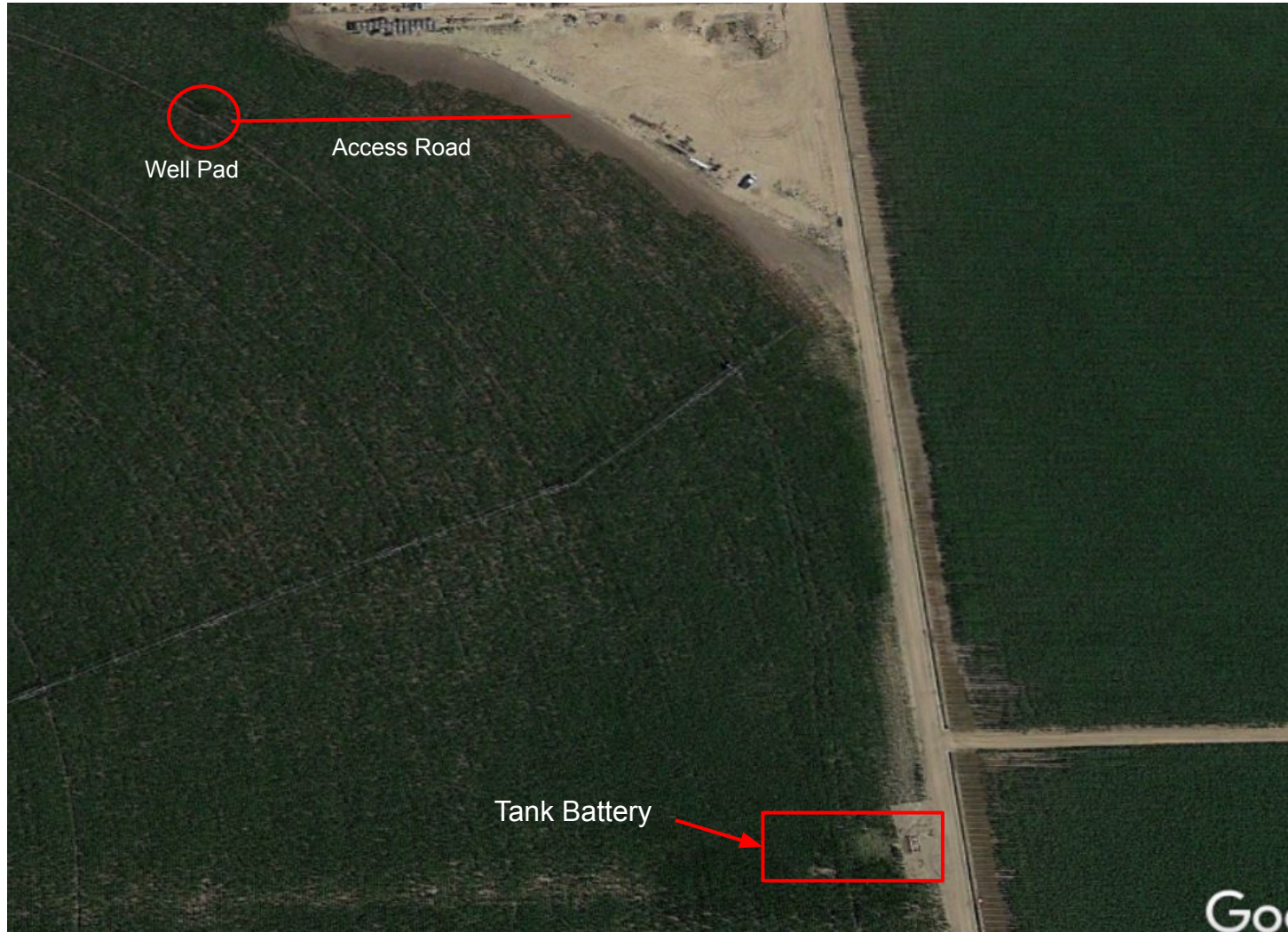
Photo 1. 2019 aerial imagery of the well pad and tank battery.