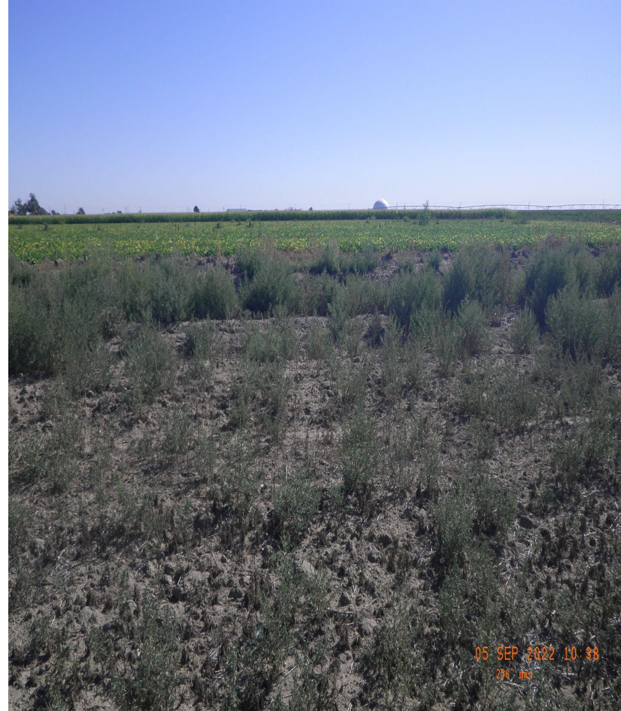
Photo 7. Cardinal photos taken from the middle of the tank battery. Left photo facing north, right photo facing east.