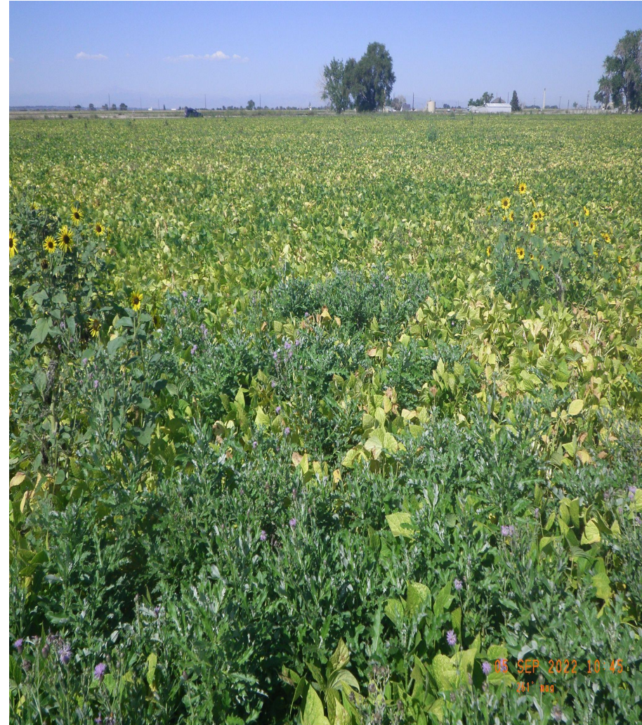
Photo 4. Cardinal photos taken from the middle of the well pad. Left photo facing south, right photo facing west. Note: well pad falls within a bean crop field and is dominated by Canada thistle; does not appear consistent with adjacent crop reference area (see photo 5).