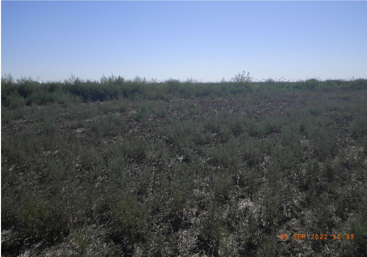
Photo 9. Tank battery reference area.