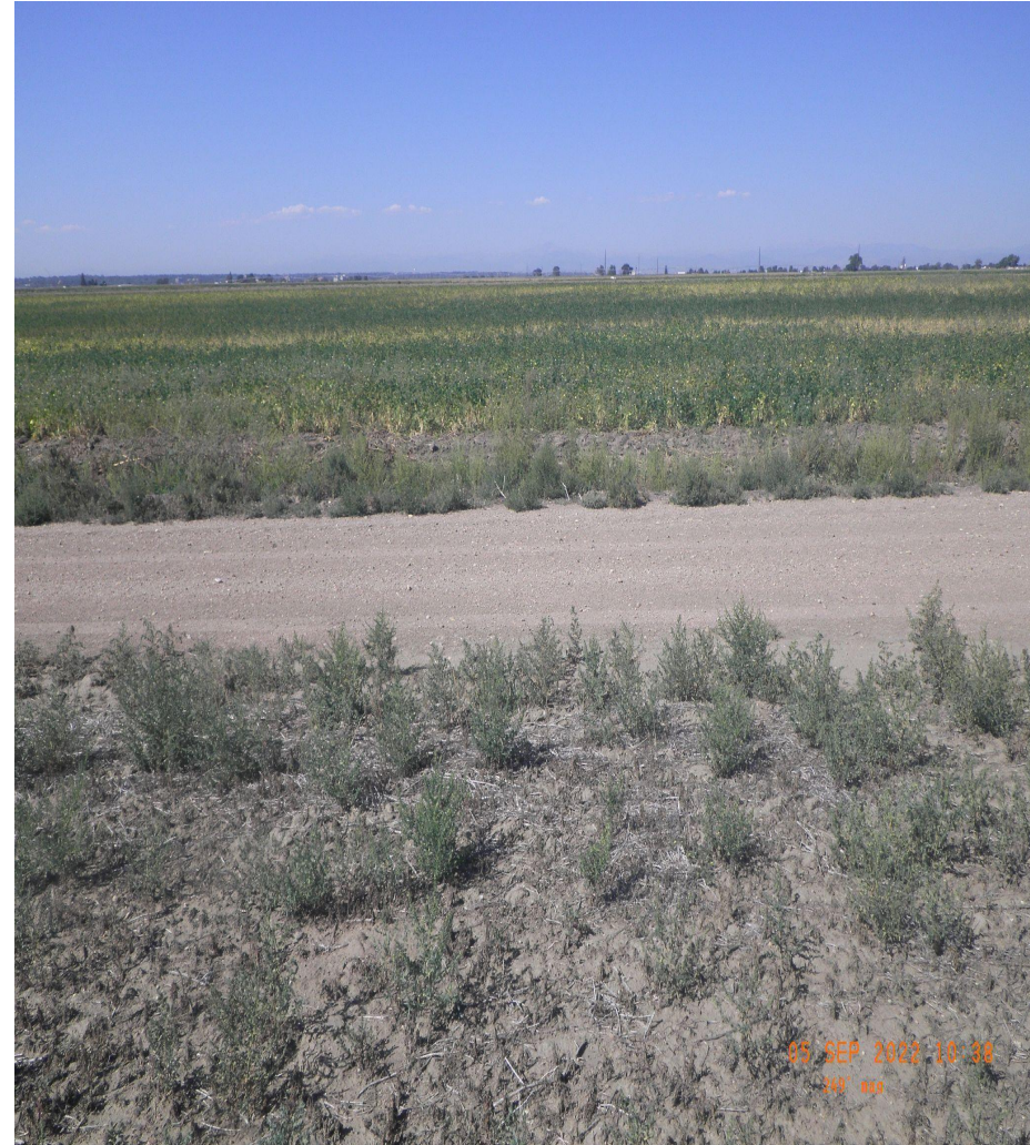
Photo 8. Cardinal photos taken from the middle of the tank battery. Left photo facing south, right photo facing west. Note: tank battery falls within an unmanaged area between two crop fields and appears consistent with the surrounding area (see photo 9).