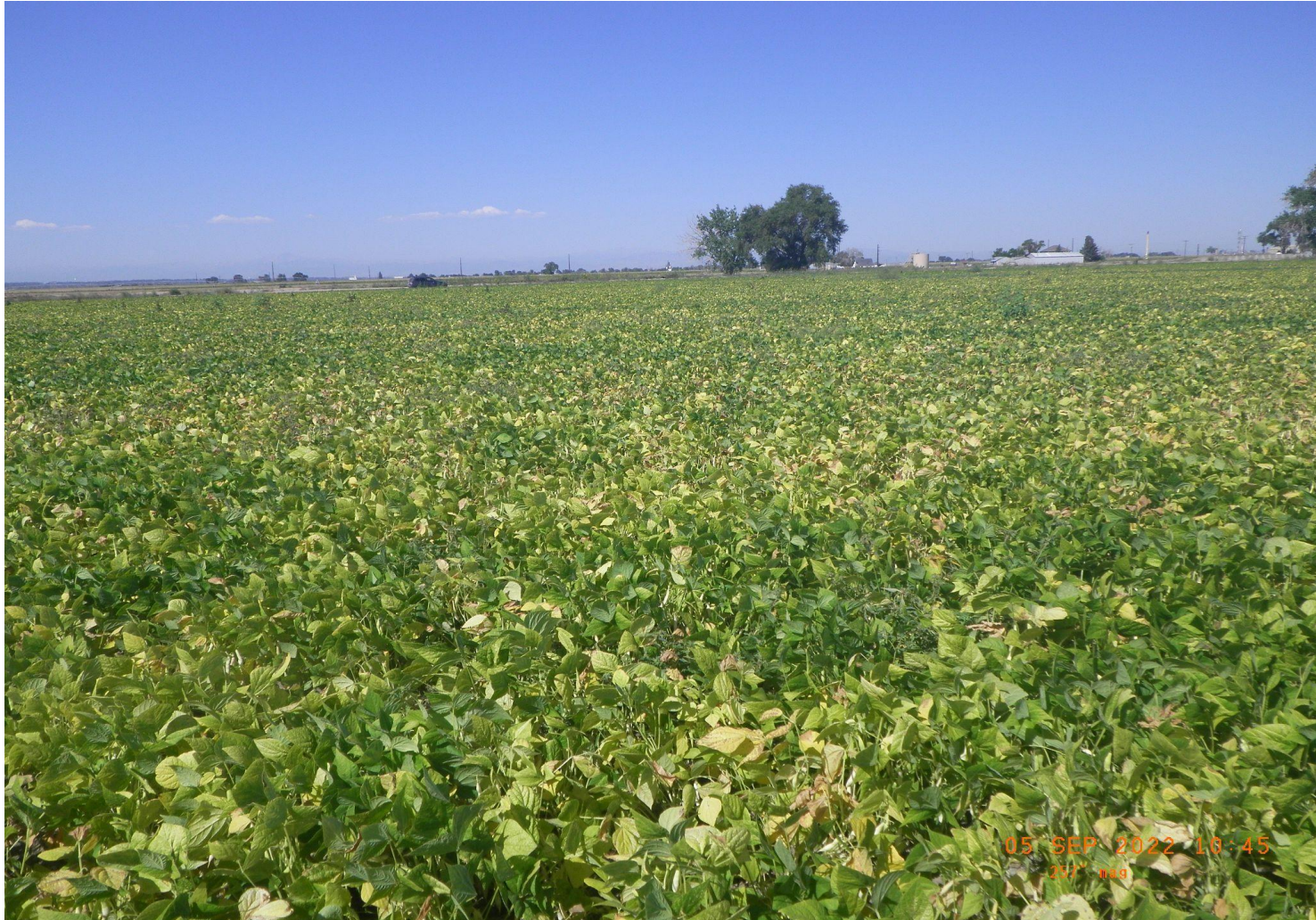
Photo 5. Well pad reference area.