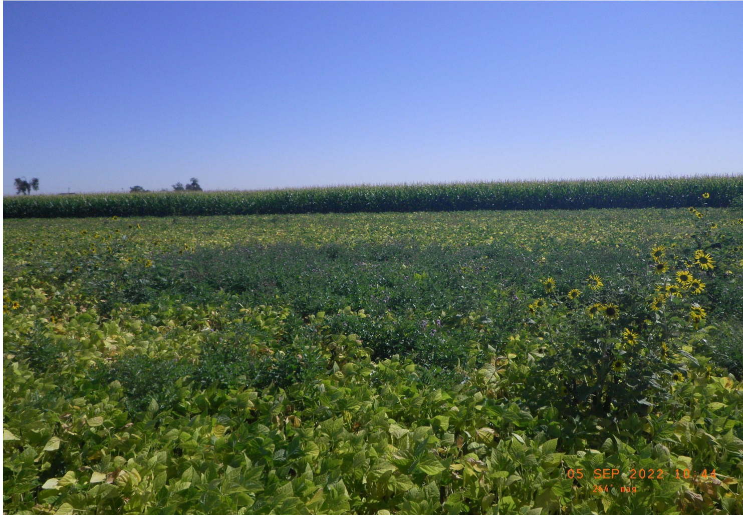
Photo 2. Overview photo of the well pad taken at ground level from the western edge facing east.