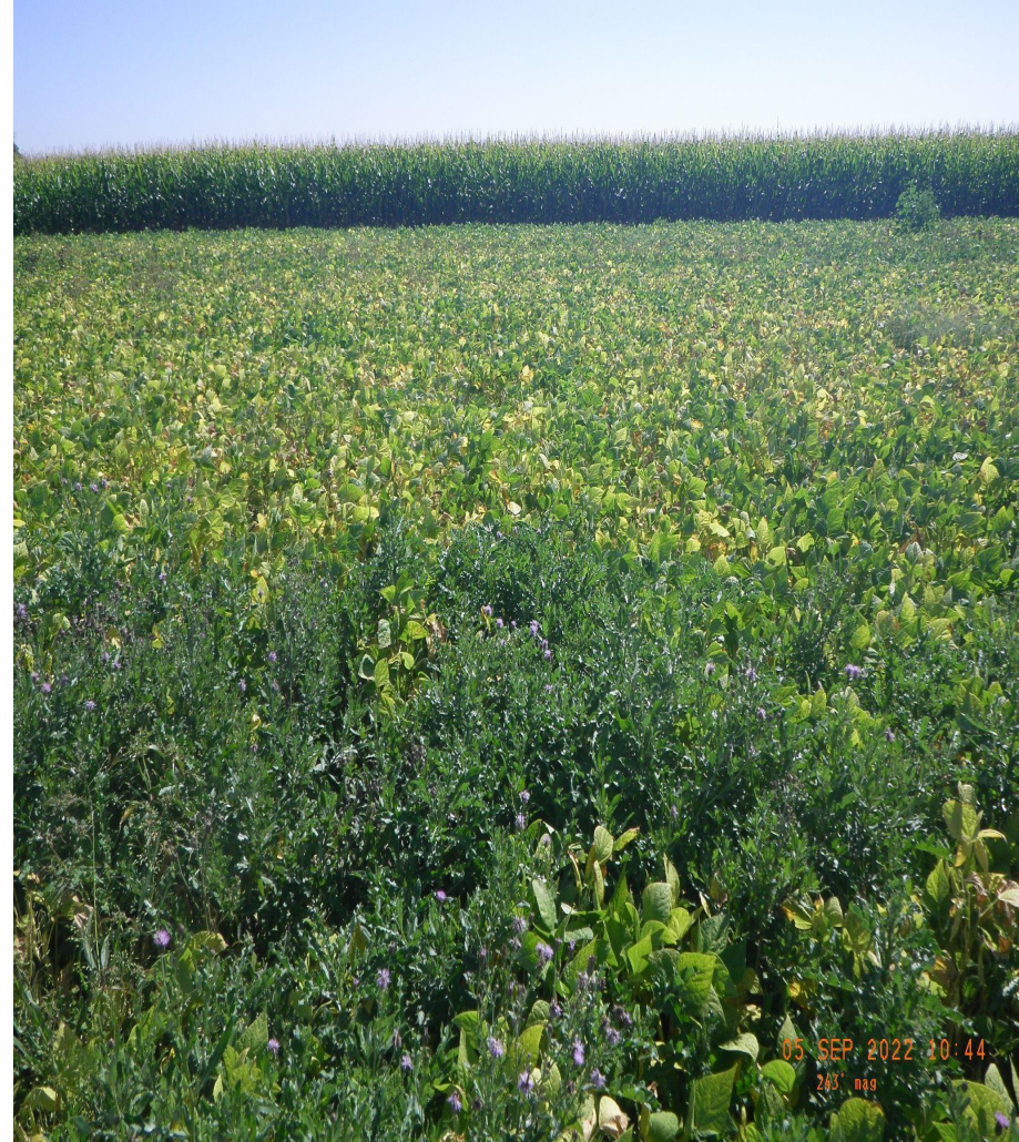
Photo 3. Cardinal photos taken from the middle of the well pad. Left photo facing north, right photo facing east.