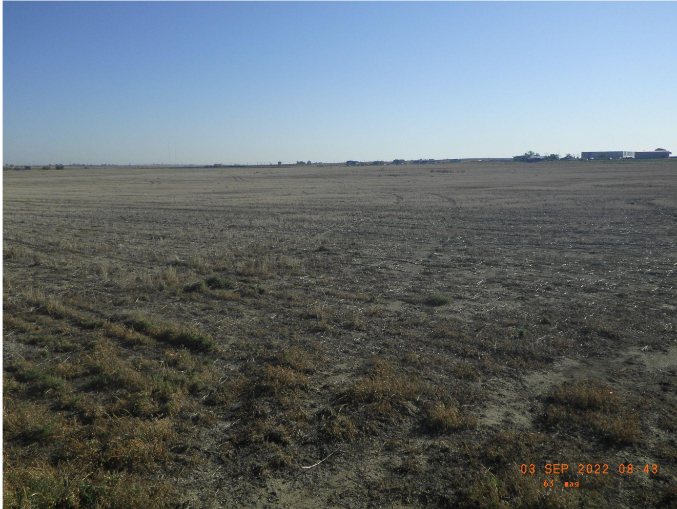
Photo 2. Well pad falls within a fallow field. Site will remain in process until field is planted with crop and site can be re-inspected.