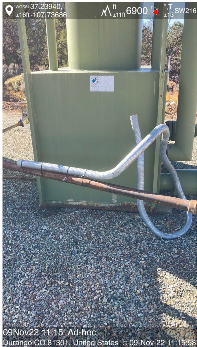
IMG 05 Muffler exhaust hose