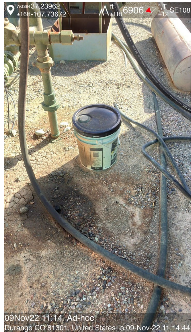
IMG 04 5 gallon container and impacted material