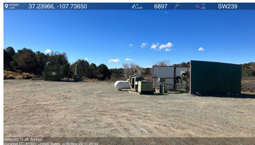
IMG 02 Location overview