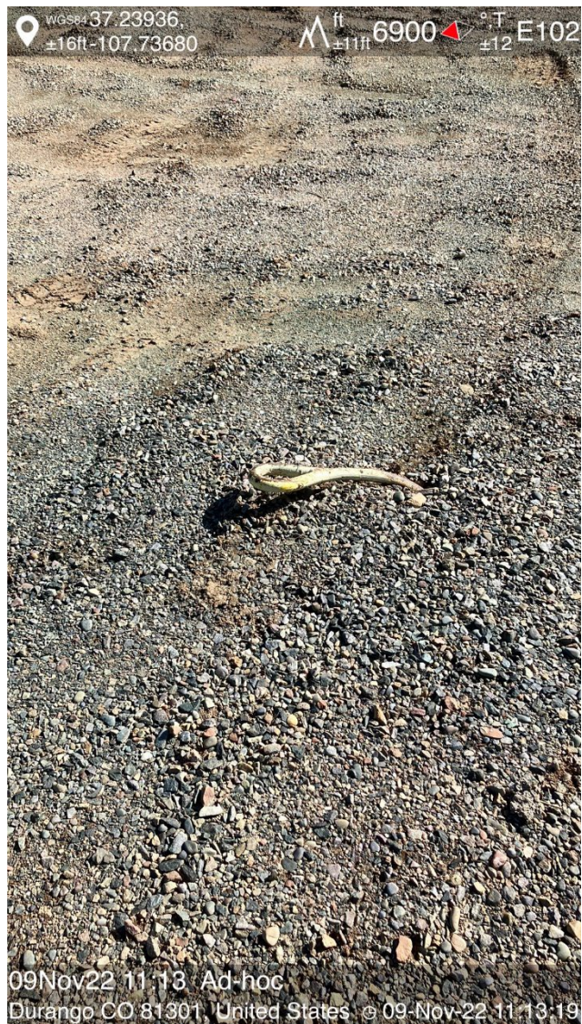
IMG 03 Rig anchor