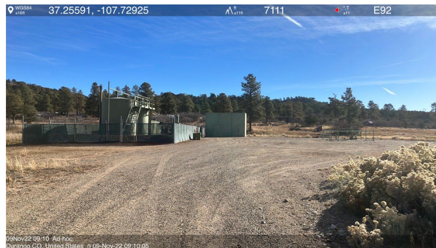
IMG 02 Location overview