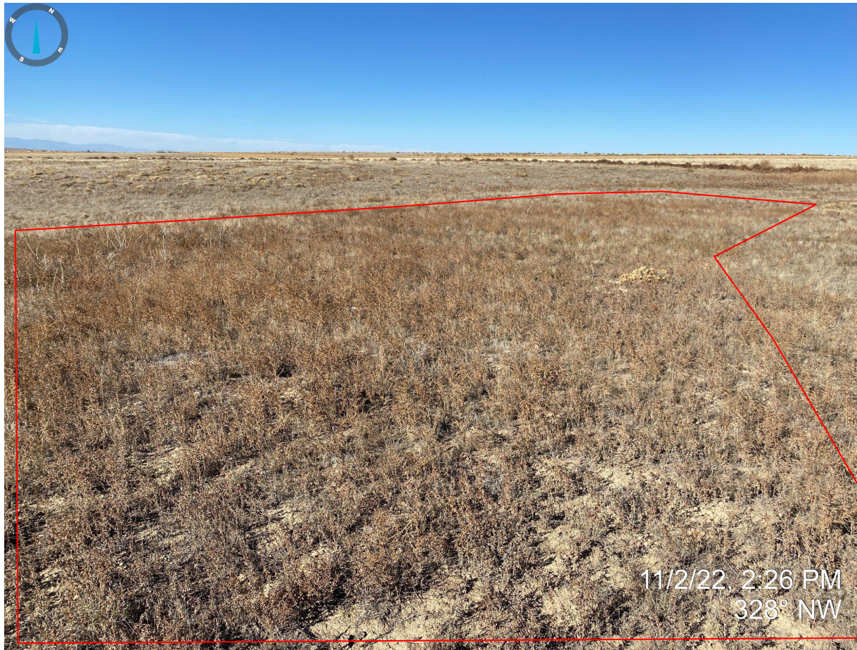
Photo 6. Taken from the center portion of the location, facing northwest. Photo illustrates a large infestation of undesirable vegetation (e.g. kochia and russian thistle) outlined in red. Some desirable vegetation was also observed interspersed throughout the location.