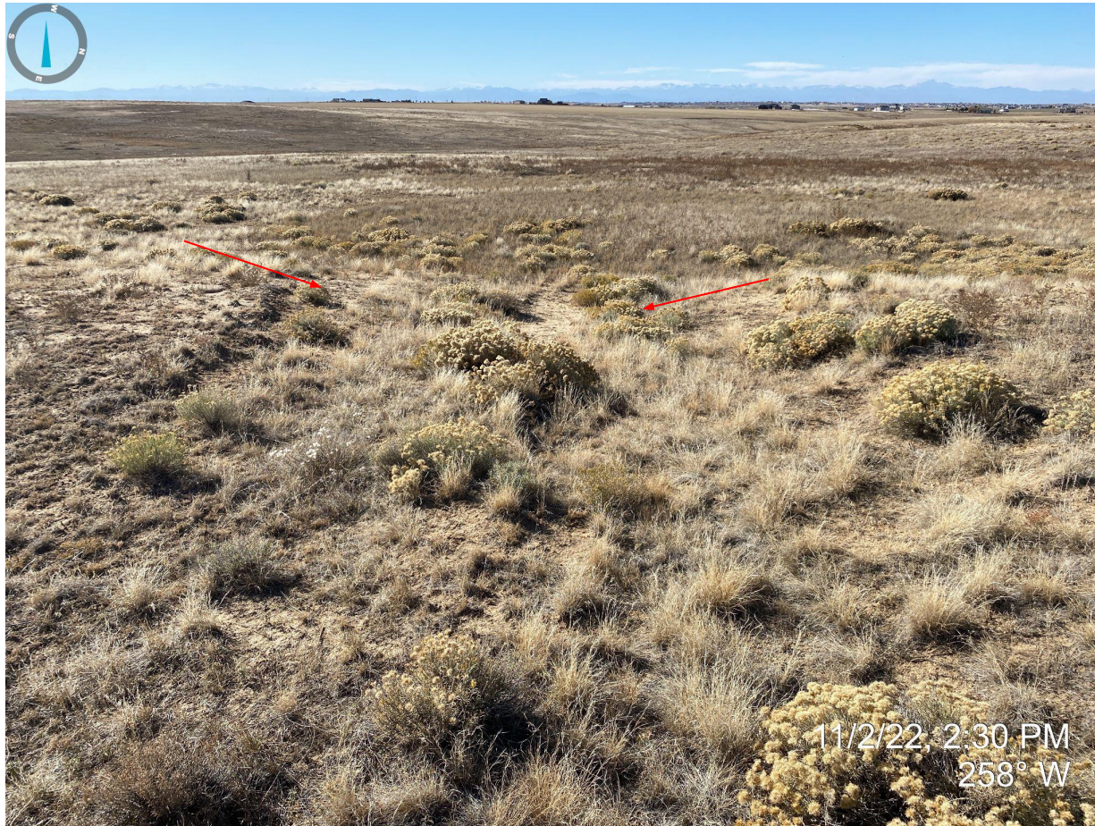
Photo 8. Taken from the access road/location transition, facing west. Photo illustrates the access road and location has not been reclaimed with evidence of cut slopes and absence of contouring and grading to reflect pre-disturbance levels, indicated by red arrows.