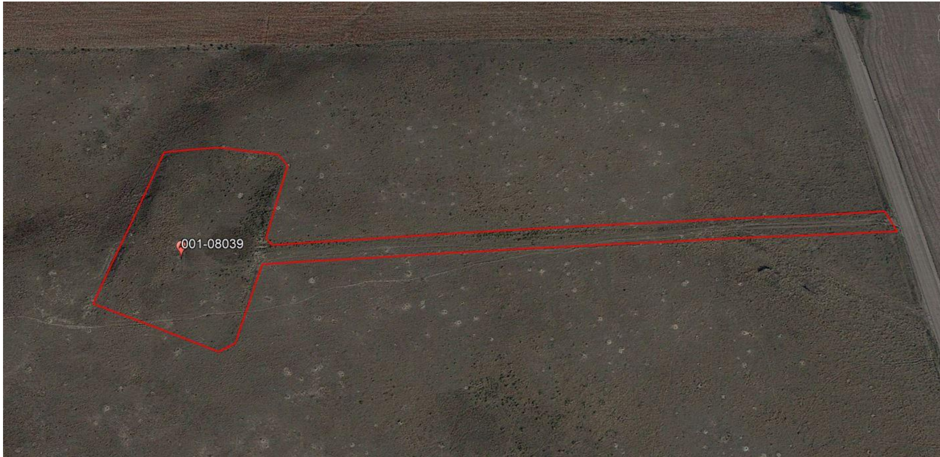
Photo 9. Google Earth aerial imagery taken circa 2020, illustrating the perimeter of the access road and location (approximately 2 acres) that needs to be reclaimed.