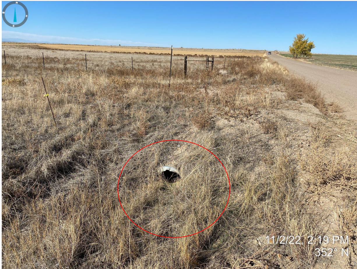
Photo 1. Taken from county road, facing north. Photo shows that the culvert has not been removed from the access road, outlined in red.