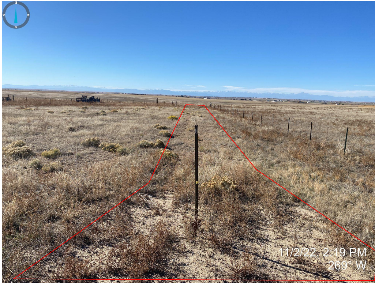
Photo 2. Taken from beginning of access road, facing west. Photo illustrates that the access road has not been reclaimed with presence of gravel/road base and contour issues (rutting) observed.