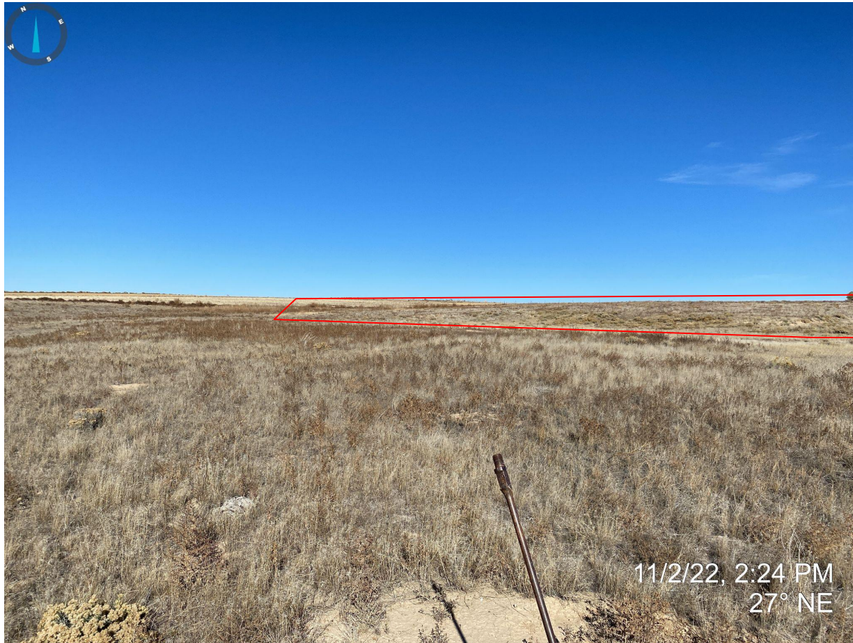
Photo 4. Taken from the southwest corner of the location, facing northeast. Photo illustrates guyline anchor and marker are still installed. The location is relatively flat and has not been recontoured as the eastern portion of the location has a pronounced cut slope, outlined in red.