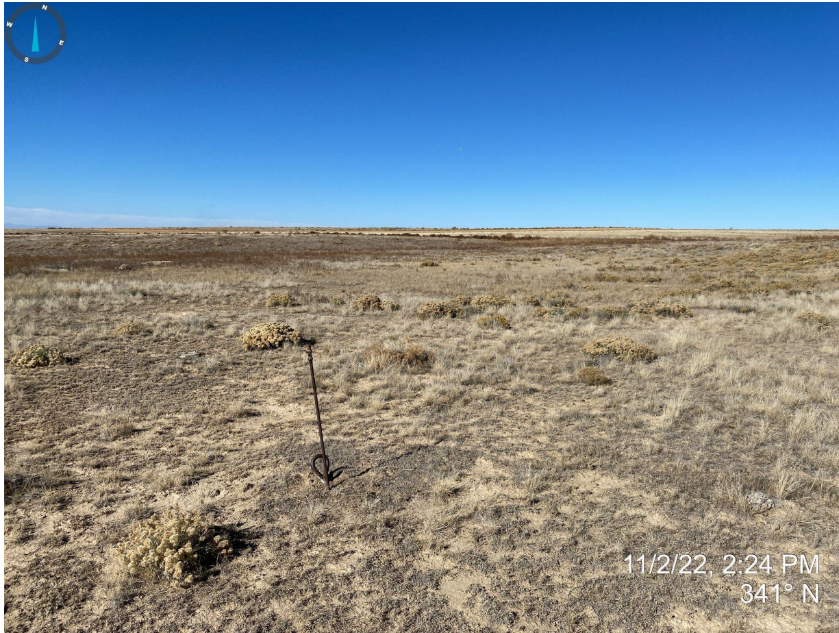
Photo 3. Taken from the southeast portion of the location, facing north. Photo illustrates guyline anchors and marker are still installed. All oil and gas equipment needs to be removed.