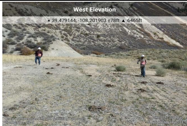
Seeding Bare Areas Identified as Photo #5