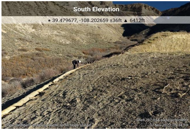
Installing Excelsior Wattle