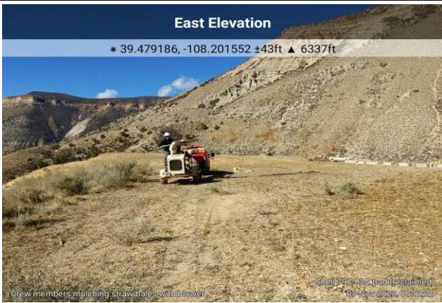
Applying Straw Mulch