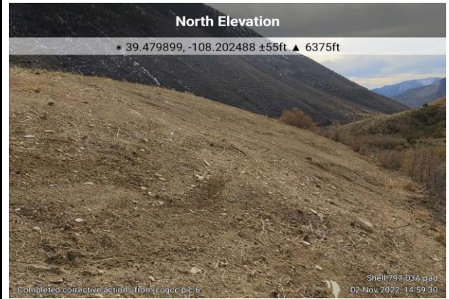
Corrective Action Completed for Photo #6