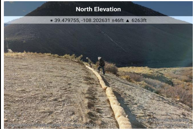
Installing Excelsior Wattle