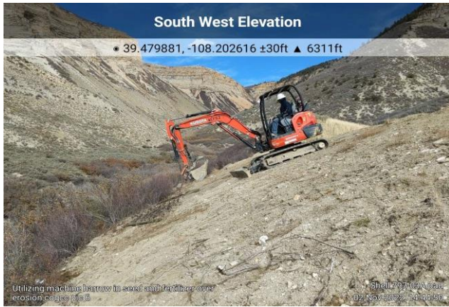
Removing Erosion Features Identified in Photo #6