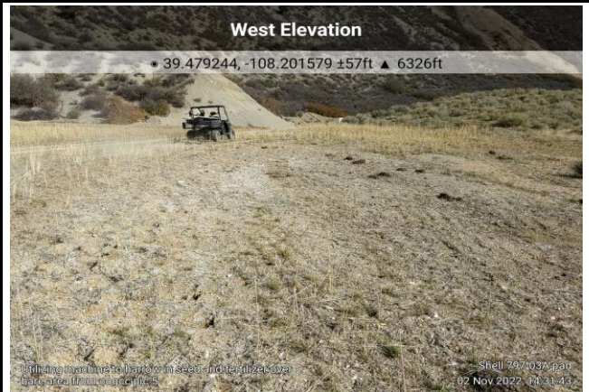
Harrowing Areas Identified in Photo #5