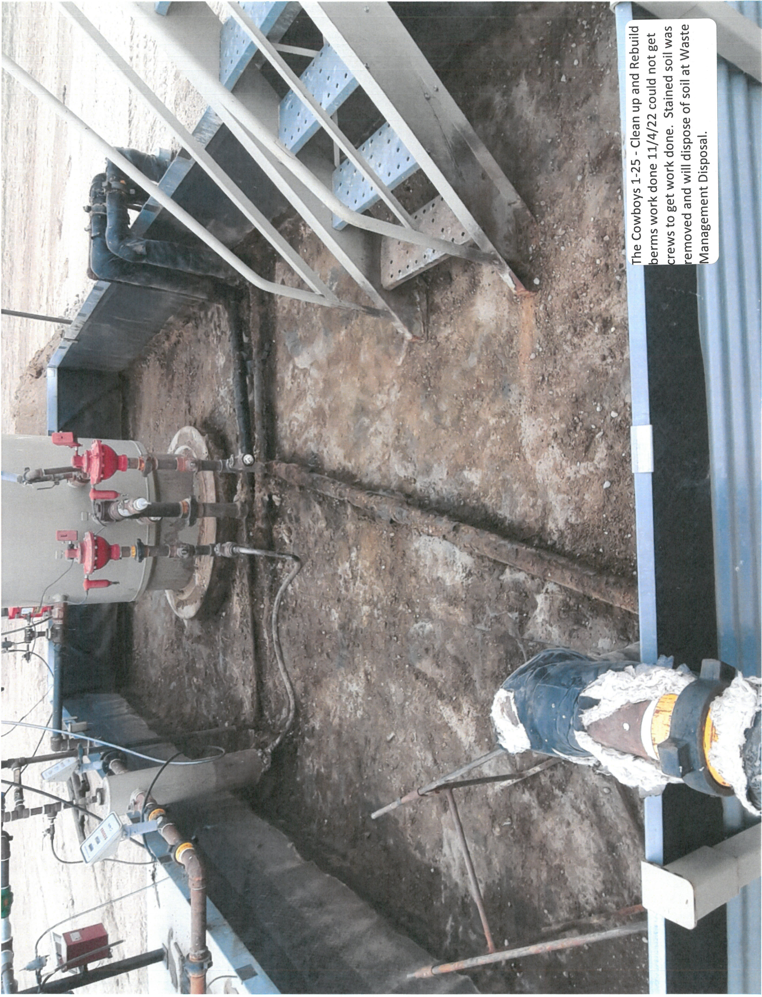
The Cowboys 1-25 - Clean up and Rebuild berms work done 11/4/22 could not get crews to get work done. Stained soil was removed and will dispose of soil at Waste Management Disposal.