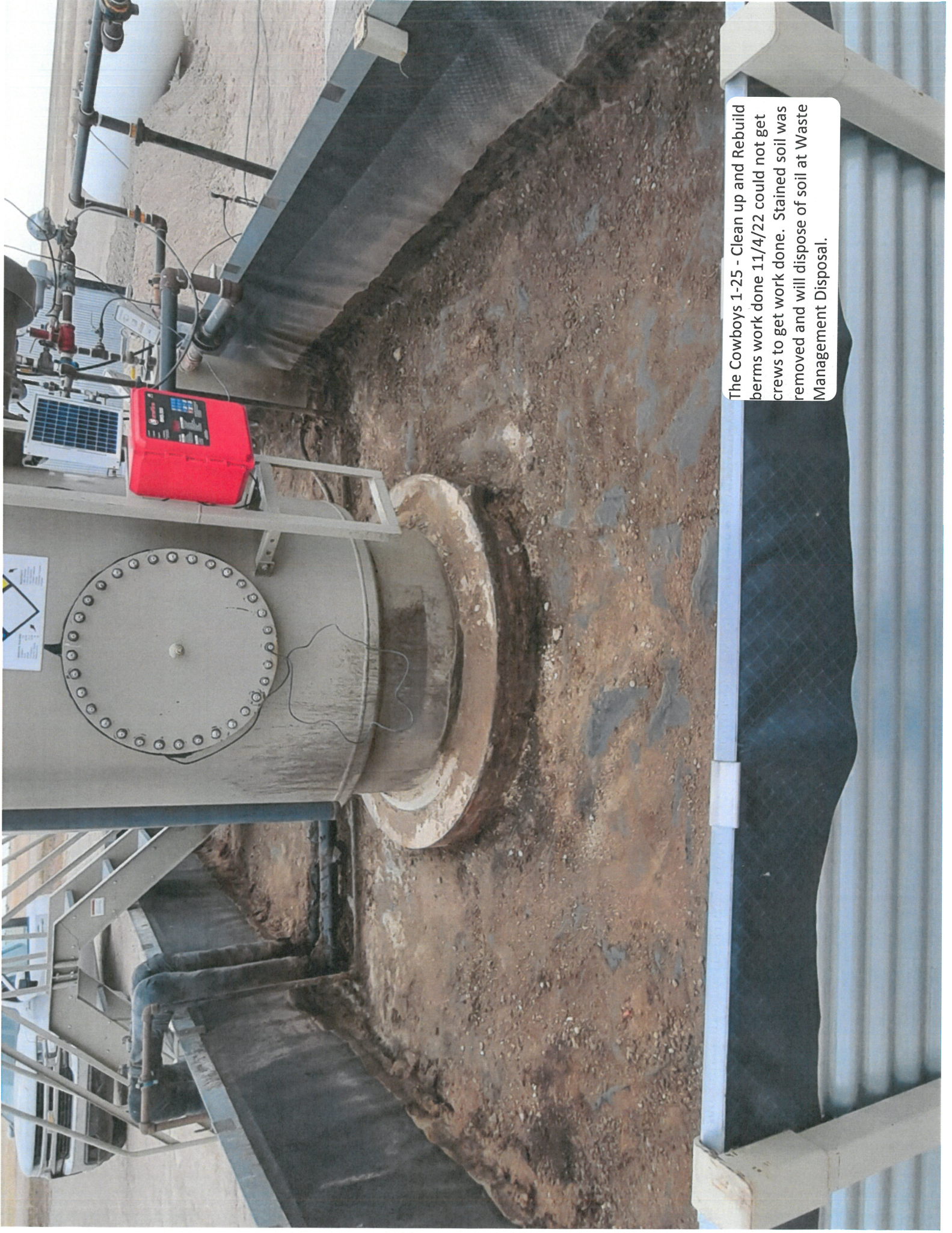
The Cowboys 1-25 - Clean up and Rebuild berms work done 11/4/22 could not get crews to get work done. Stained soil was removed and will dispose of soil at Waste Management Disposal.