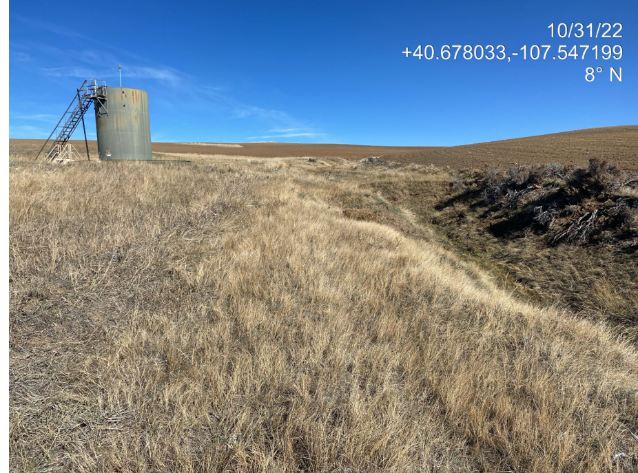
Photo 10. Photo shows interim areas at the south of the Location are well vegetated with perennial grasses.