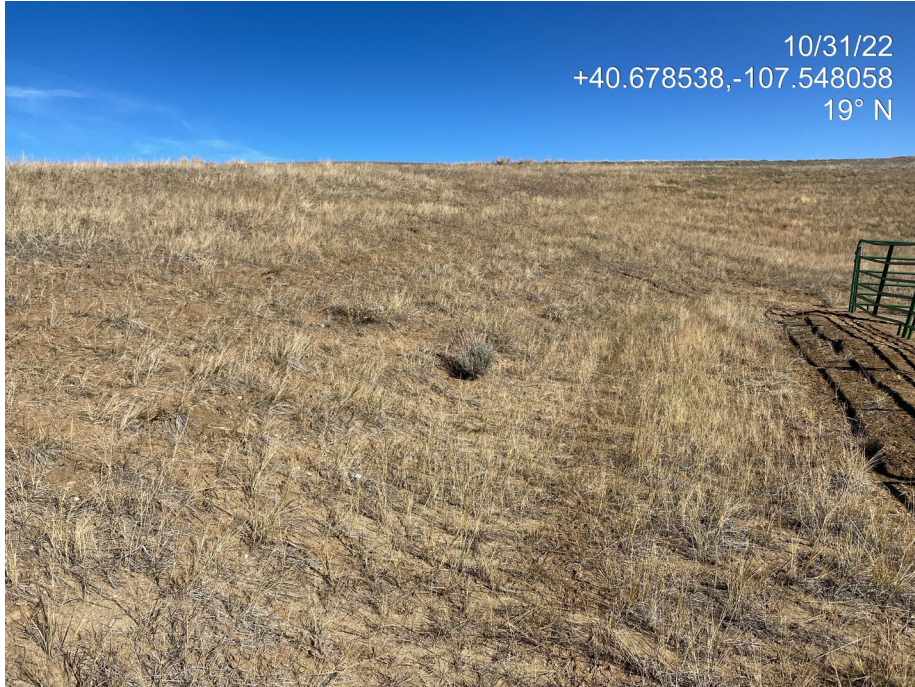
Photo 9. Photo shows interim areas at the north of the Location are well vegetated with perennial grasses.