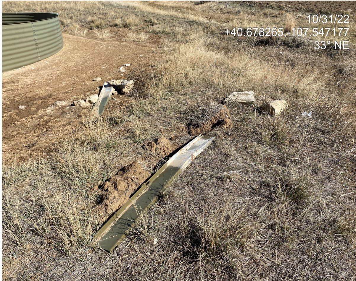
Photo 5. Photo shows trash/debris adjacent to the tank battery.