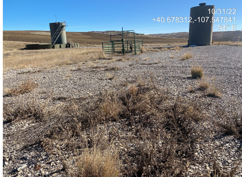
Photo 8. Photo shows an example of Canada thistle (List B Noxious) found throughout the Location.