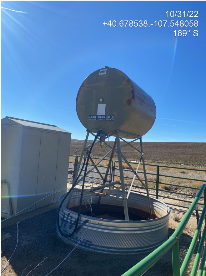
Photo 3. Photo taken from the west. The methanol tank secondary containment lacks wildlife protection BMPs. Tank label is faded. Contact numbers on tank are outdated.