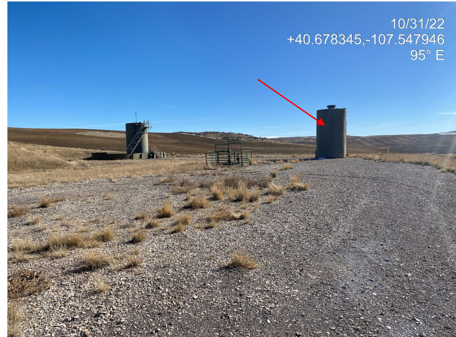
Photo 2. Photo shows production areas to the east. Note unused tank.