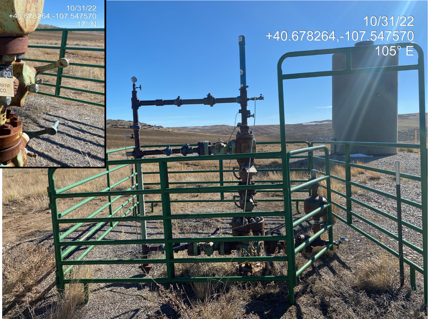
Photo 6. Photo shows the wellhead. Wellhead sign lacks the API number.