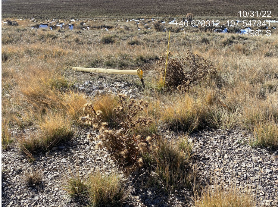
Photo 7. Photo shows an example of bull thistle (List B Noxious) found throughout the Location. Photo also shows an anchor marker in disrepair (left). Anchor is marked (right), marker to left is now trash/debris.