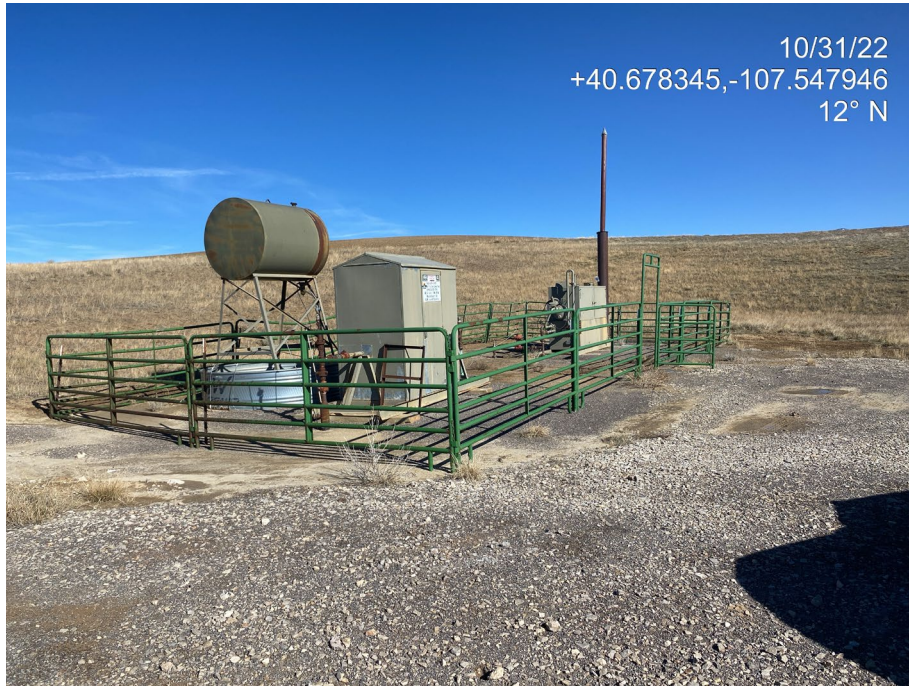
Photo 1. Photo shows production areas to the west.