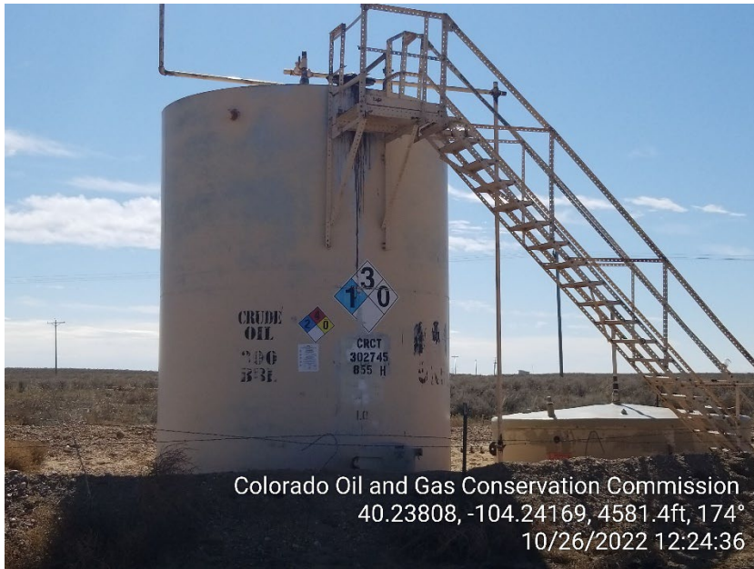
Colorado Oil and Gas Conservation Commission 40.23808, -104.24169, 4581.4ft, 174° 10/26/2022 12:24:36