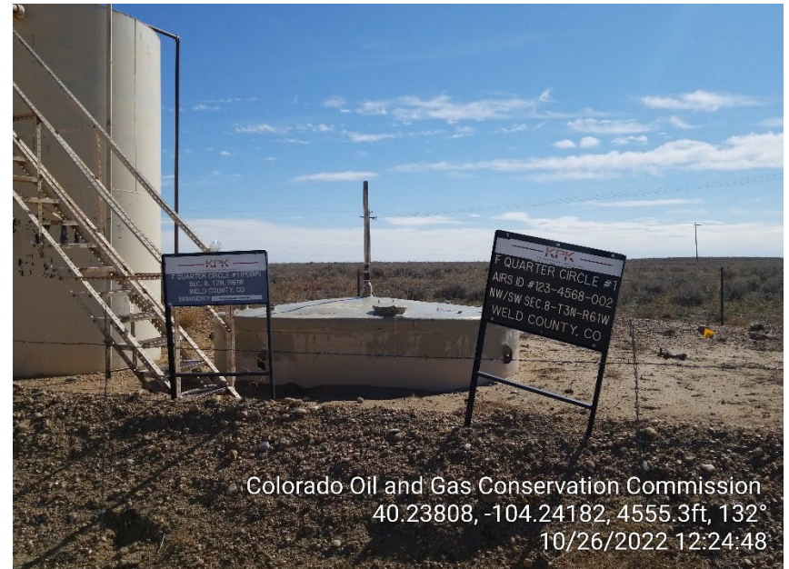
Colorado Oil and Gas Conservation Commission 40.23808, -104.24182, 4555.3ft, 132° 10/26/2022 12:24:48