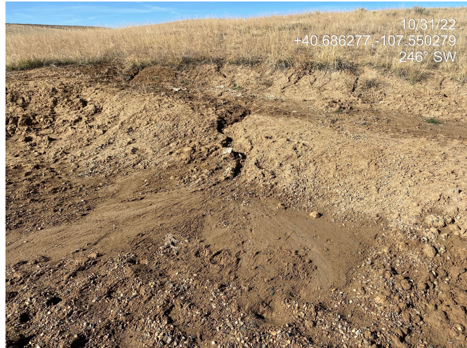
Photo 9. Photo taken from the southwest of the Location shows rill erosion occurring in bare, unprotected soils.