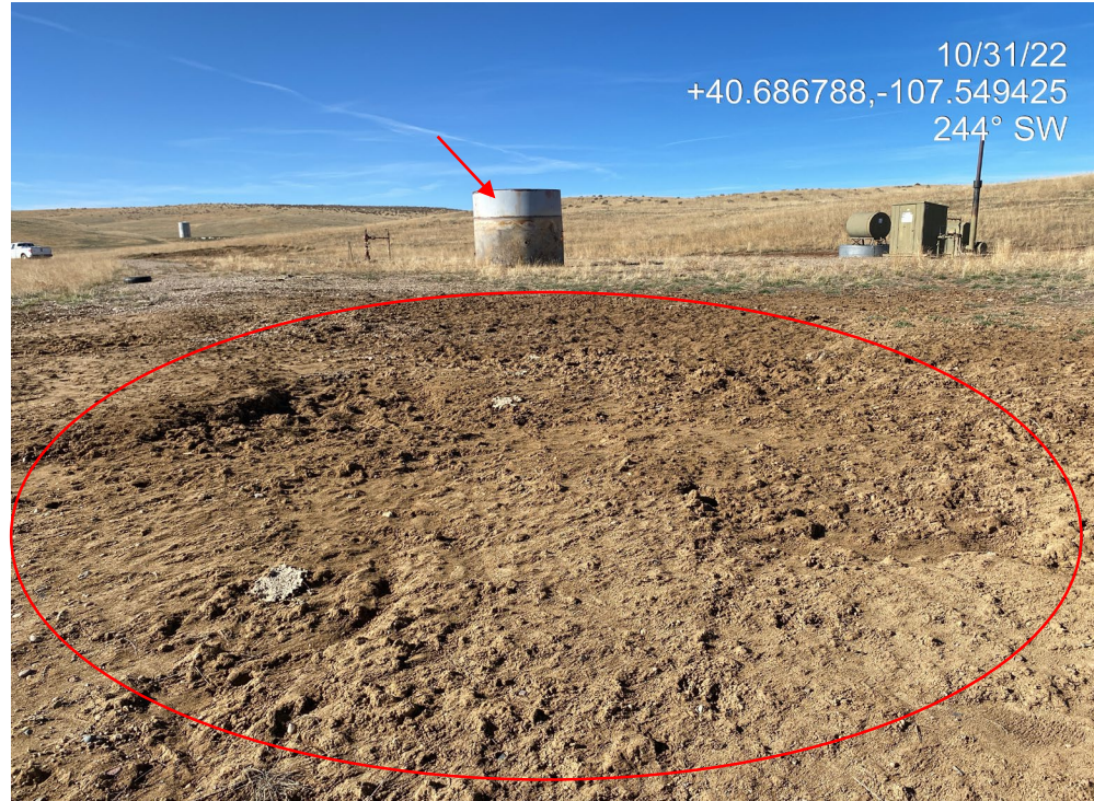
Photo 3. Photo taken from the northeast of the Location shows a decommissioned partially buried tank facility. Decommissioned facilities require site investigation and remediation followed by interim reclamation after compliance with 915-1 standards. Note also, unused tank.