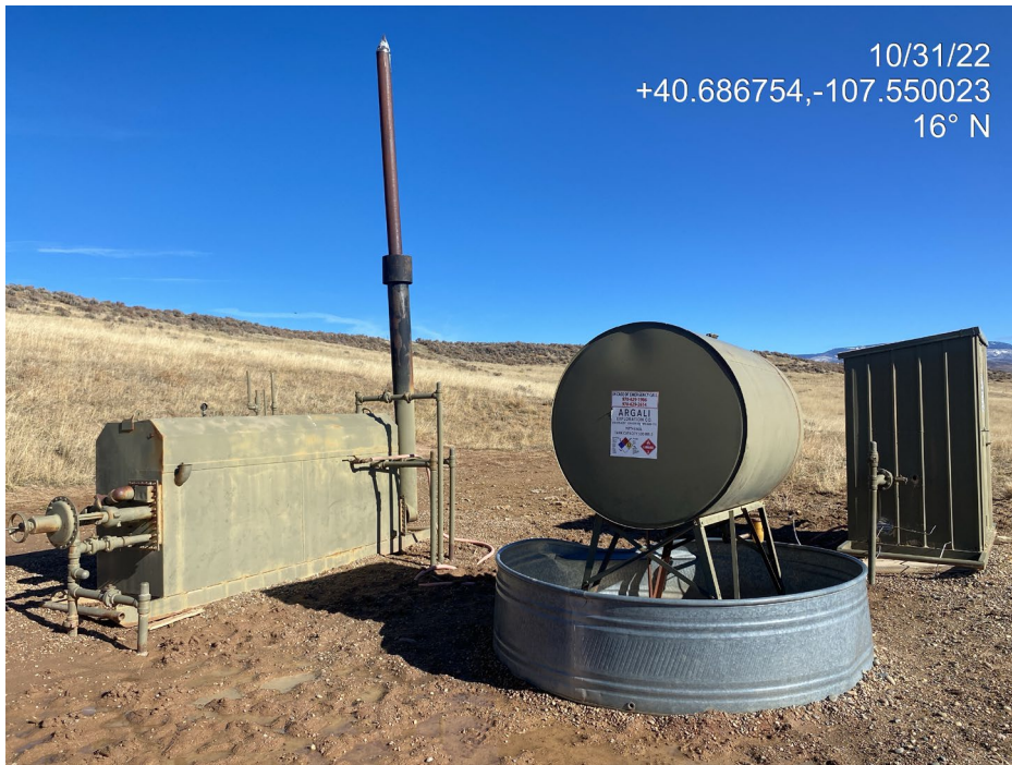
Photo 4. Photo taken from the northwest. The methanol tank secondary containment lacks wildlife protection BMPs. The tank label is inaccurate; tank capacity reads 500 BBLs.