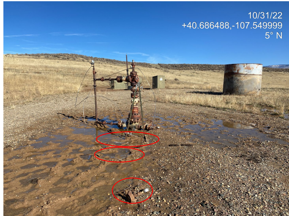
Photo 5. Photo shows the wellhead. Wellhead signage does not comply with Rule 605.d. Photo also shows trash around the wellhead.