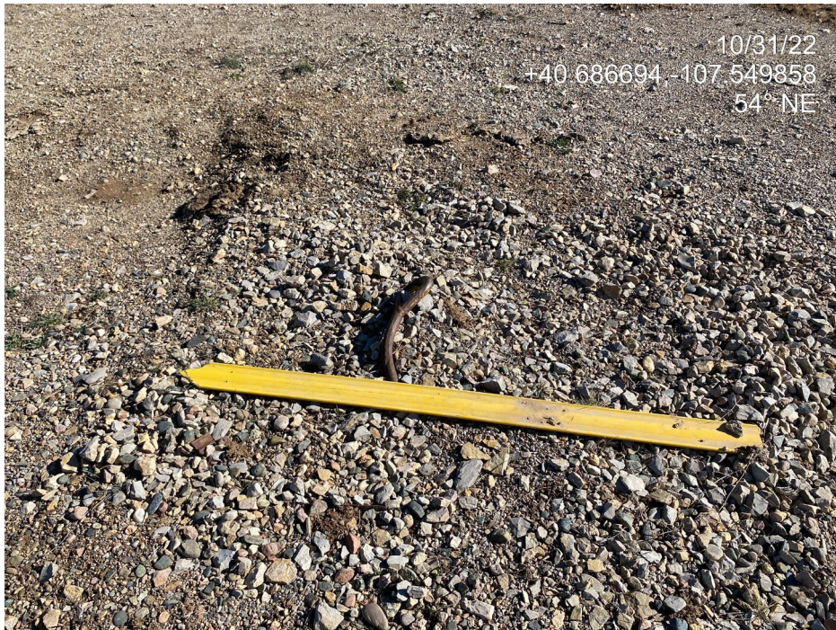
Photo 8. Photo shows an anchor marker in disrepair.