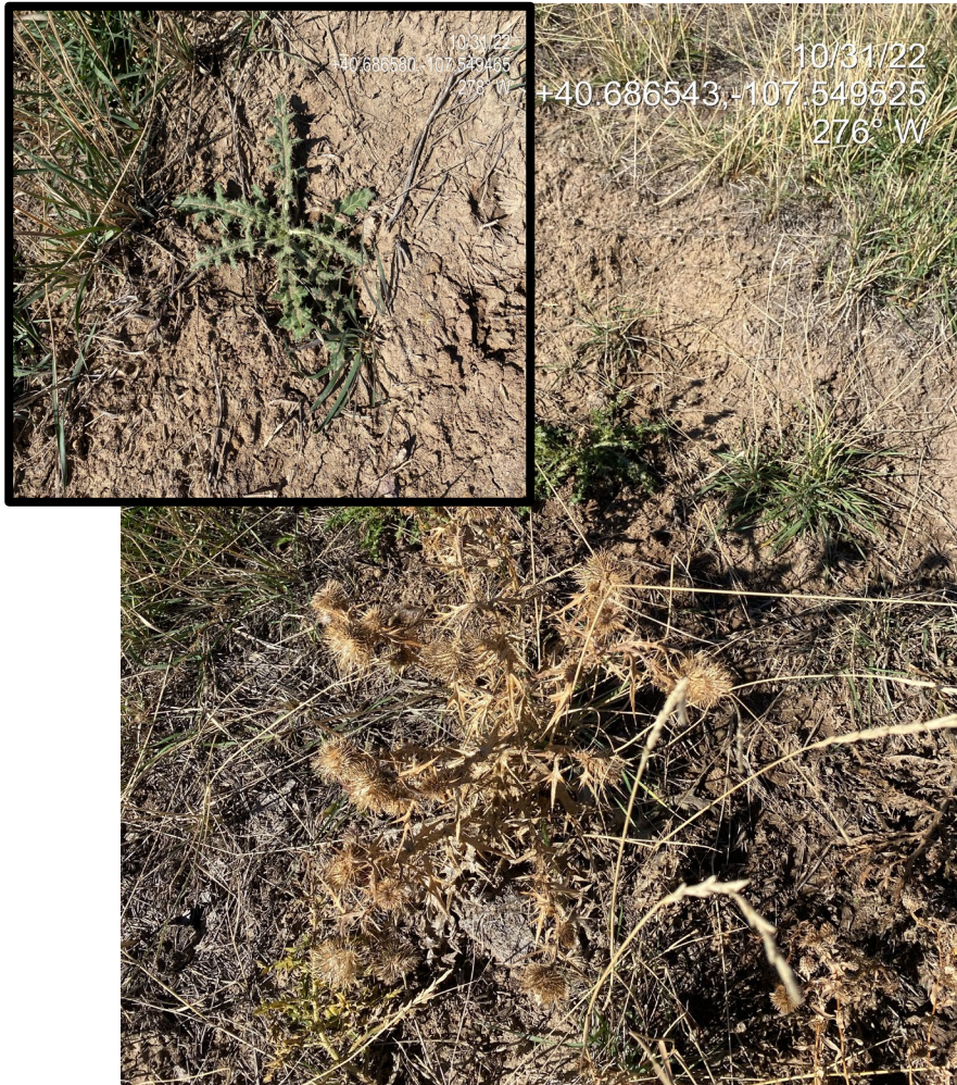
Photo 6. Photos shows a bull thistle (List B Noxious) which has gone to seed and a basal rosette.