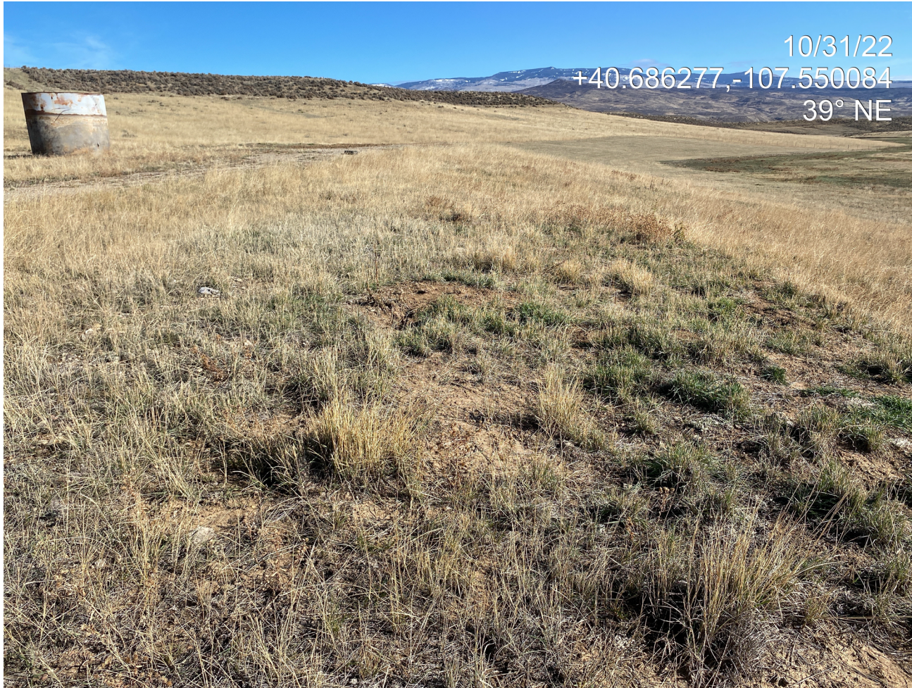
Photo 10. Photo taken from the east of the Location show fill slopes and interim areas vegetated with perennial grasses. Photo also shows similarity with reference area vegetation.