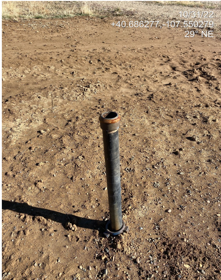
Photo 2. Photo taken from the southwest shows a pipe remaining at the produced water tank facility. Pipe must be removed.