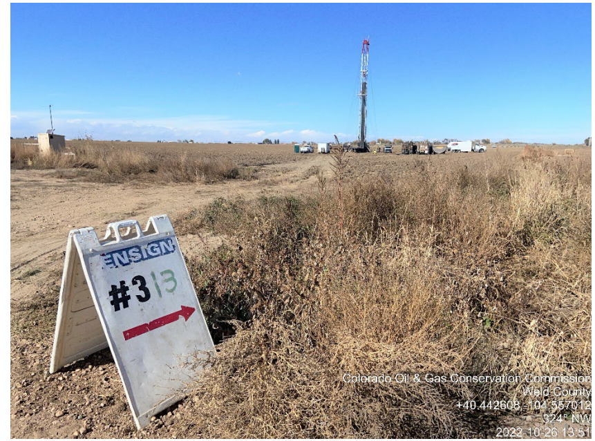
Photo #3 Noffsinger 22-33 Wellsite Plugged & Abandoned | PA Plugging Operations: Cementing | WK Cement to surface

Colorado Oil & Gas Conservation Commission Weld County +40.442608 -104.567012 39° 12' 32" N 2022-10-26 13:51