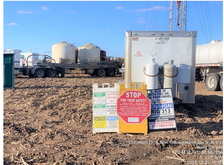
Colorado Oil & Gas Conservation Commission Weld County +40.443279,-104.557455 337° NW 2022-10-27 16:20