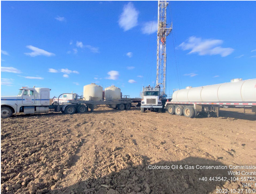
Colorado Oil & Gas Conservation Commission Weld County +40.443542,-104.557528 346° N 2022-10-27 16:07