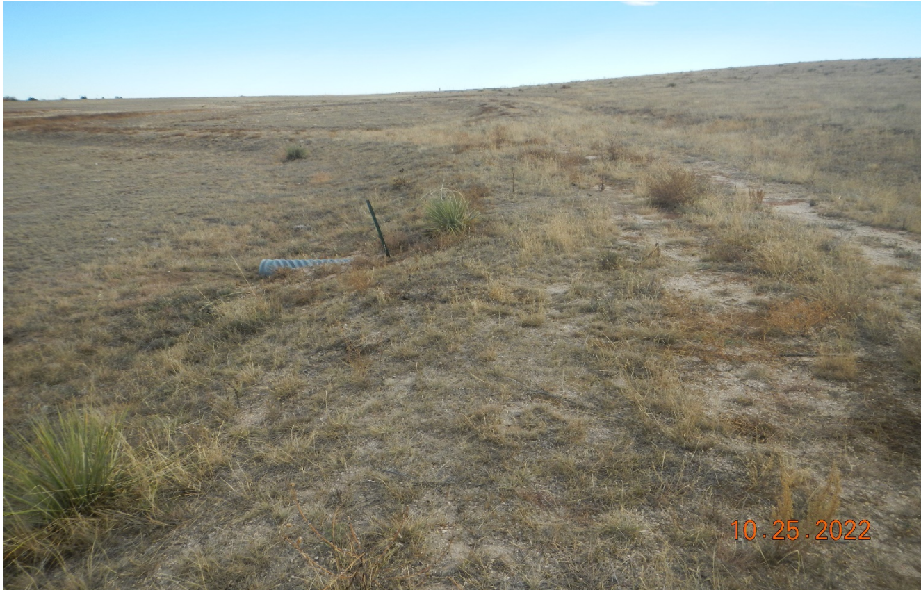
Photo 2. Facing southeast along the access road . The road has not been recontoured and culverts remain. Previous corrective action was not completed.