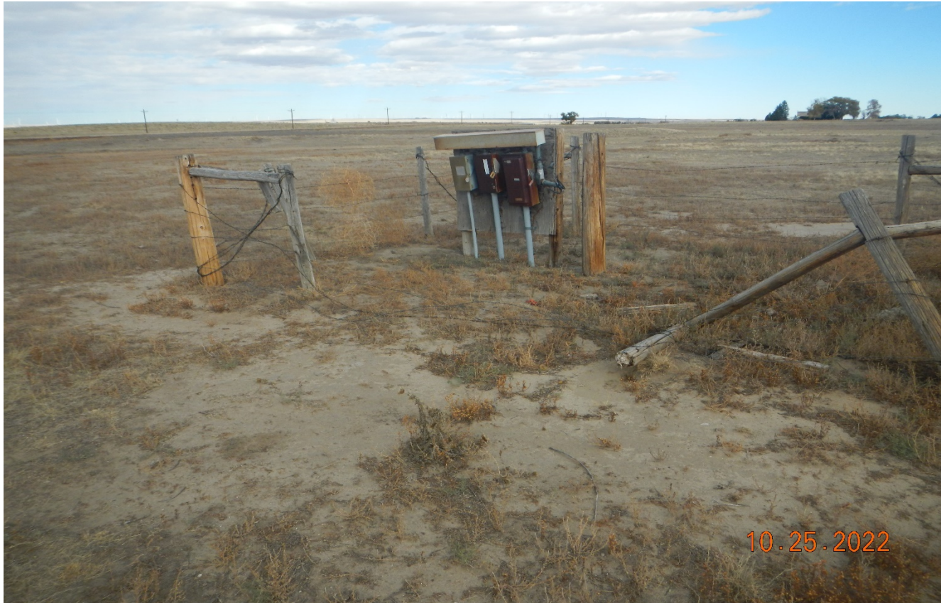
Photo 5. There is electric utilizes and a fence in disrepair that remain at the location. All equipment should have been removed within 3 months of abandonment. Previous corrective action was not completed.