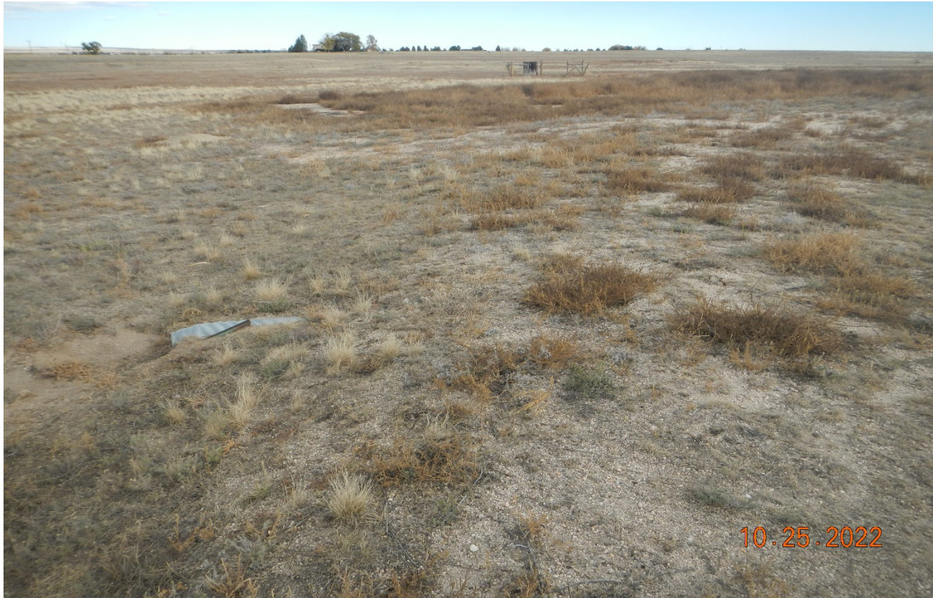
Photo 3. Facing east along the access road toward the location. The road has not been recontoured and culverts remain. Previous corrective action was not completed.