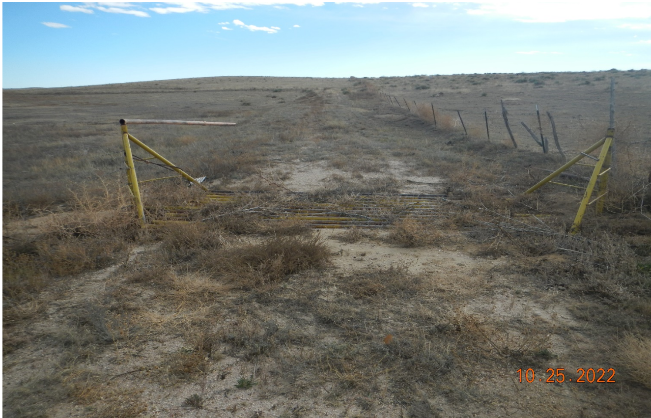
Photo 1. Facing south toward the access road. The cattleguard has not been removed and is filled in with sediment. Previous corrective action was not completed.