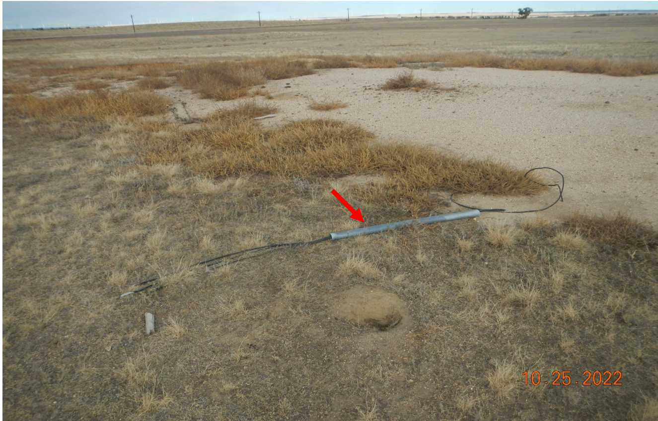
Photo 6. Facing northeast abandoned wellsite location. There are electric utility wires that have not been removed and the location has not been reclaimed.