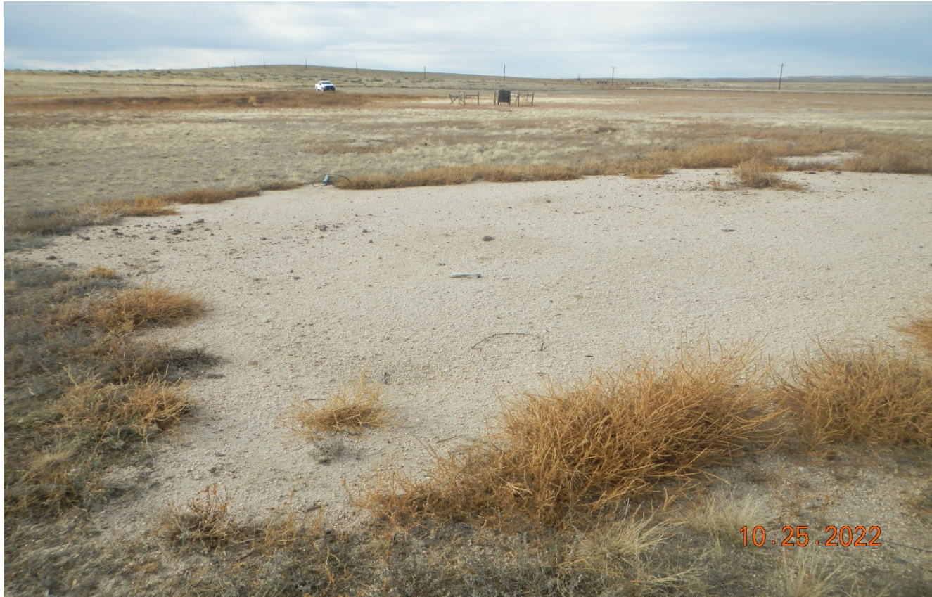
Photo 7. Facing northwest at the abandoned wellsite location. This area approximately 50'x50' is bare of vegetation. The location has not been reclaimed.