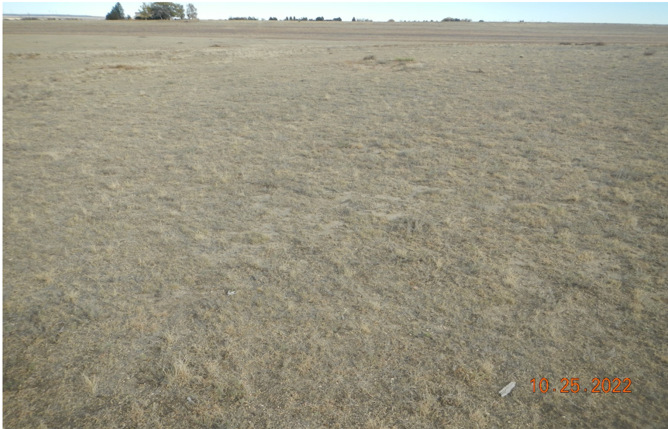
Photo 10. Facing toward the surrounding reference area consisting of Blue grama, Sand dropseed, among other native species.