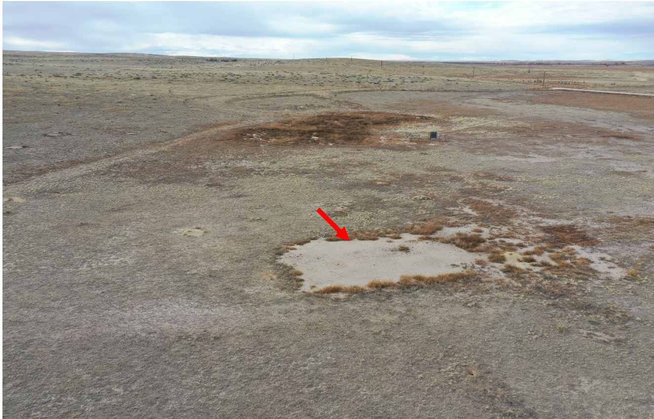
Photo 8. Drone aerial photo facing northwest toward the location. The red arrow points to the abandoned wellsite shown in photo 6-7.