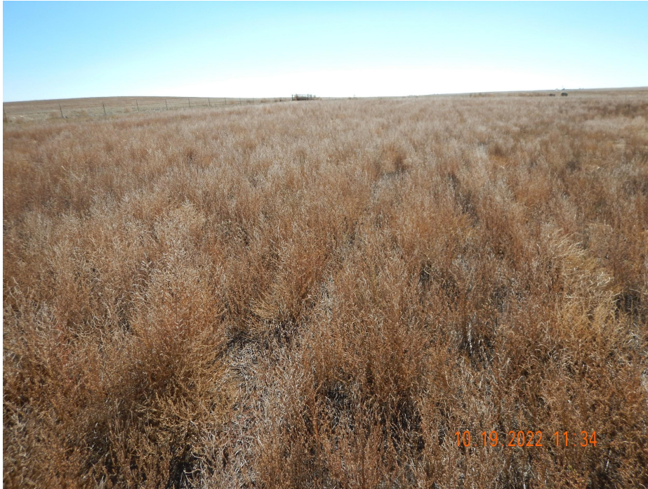
Photo 1. Photo taken from the eastern interim reclamation area, facing South. Photo illustrates the establishment of annual, weedy Kochia vegetation.