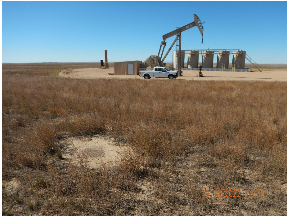
Photo 3. Photo taken from the eastern interim reclamation area, facing West. See comments under Photo 1.