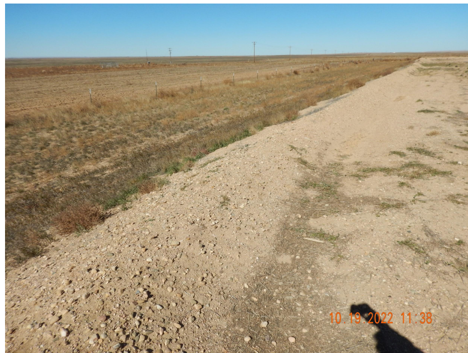
Photo 6. Photo taken from the southern interim reclamation area, facing Northwest. See comments under Photo 5.