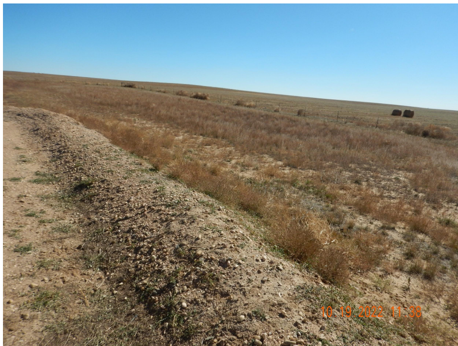
Photo 5. Photo taken from the southern interim reclamation area, facing Southeast. Photo illustrates both Kochia and some desirable plant species.