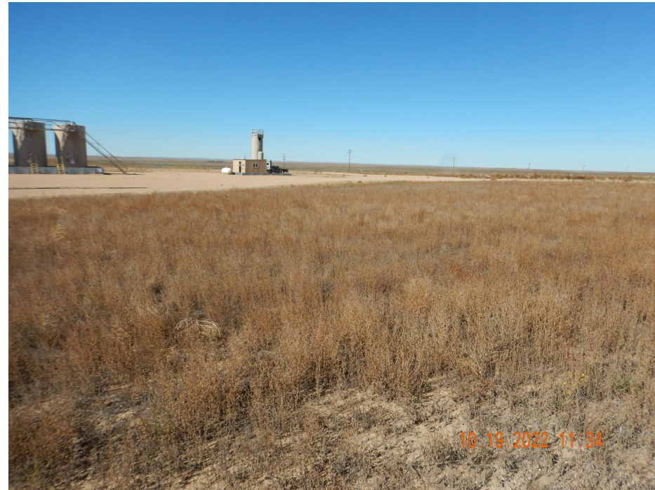
Photo 4. Photo taken from the eastern interim reclamation area, facing Northwest. See comments under Photo 1.