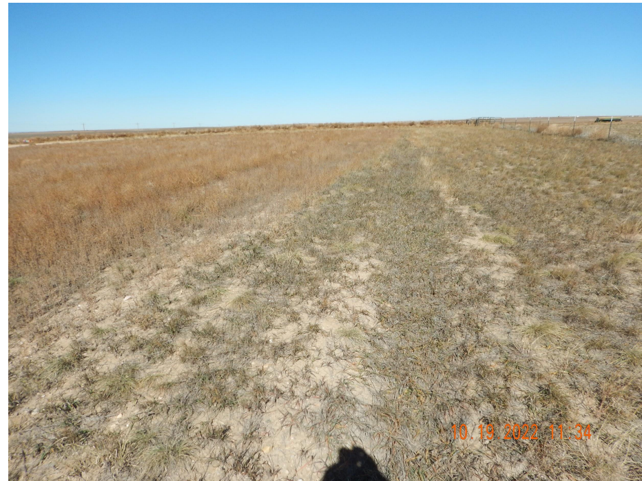
Photo 8. Reference photo taken from the eastern interim reclamation area, facing South. See comments under Photo 7.