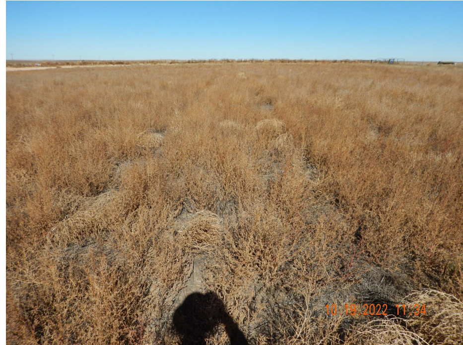
Photo 2. Photo taken from the eastern interim reclamation area, facing North. See comments under Photo 1.