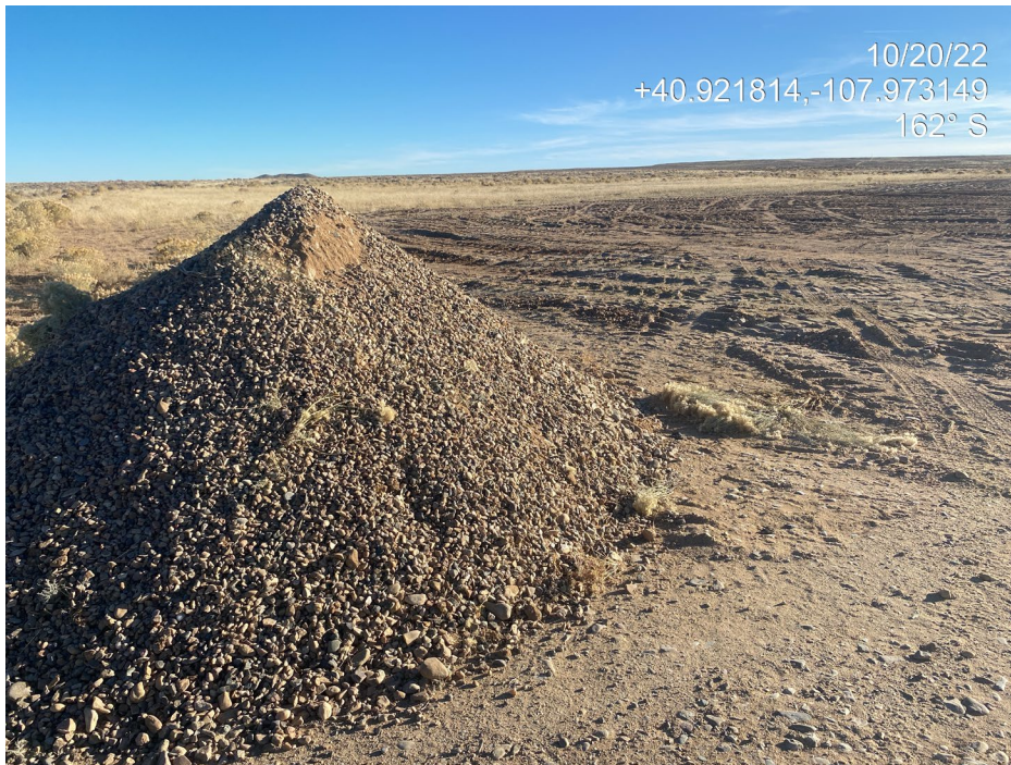
Photo 3. Photo taken from the Location entrance. It appears Final Reclamation has just been initiated. Gravel has been removed from the pad surface