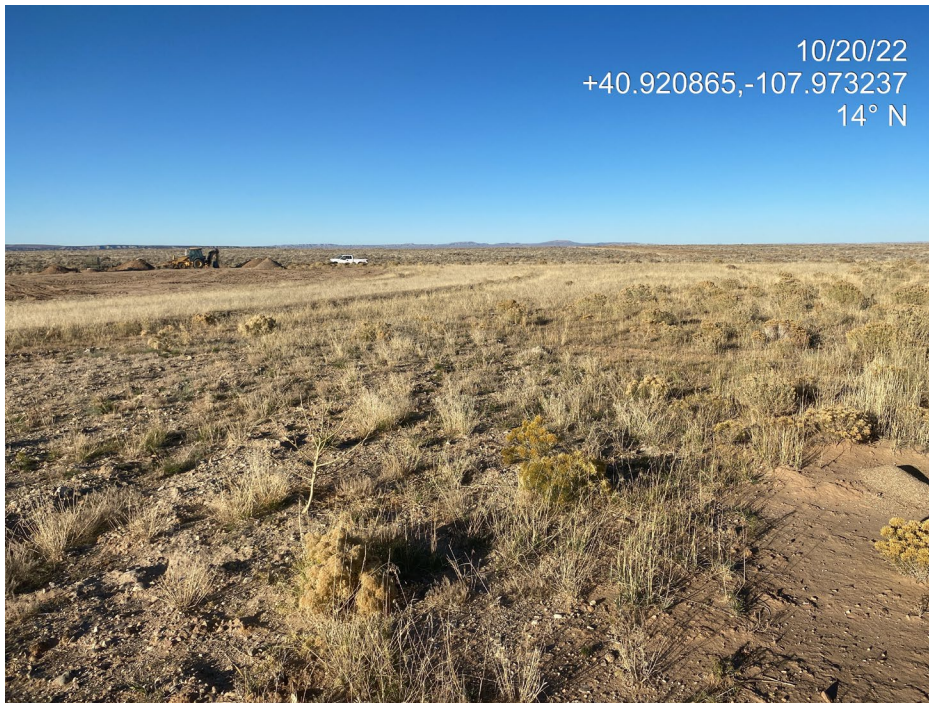
Photo 7. Photo taken from the east shows interim area vegetation. Additional reclamation may be necessary to meet 1004 vegetation requirements.