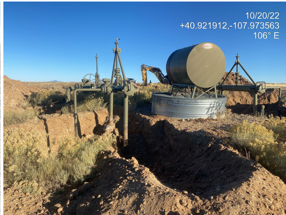
Photo 4. Photo taken from the north. Flowline abandonment appears to be in process. Risers, methanol tank, and all other equipment must be removed.