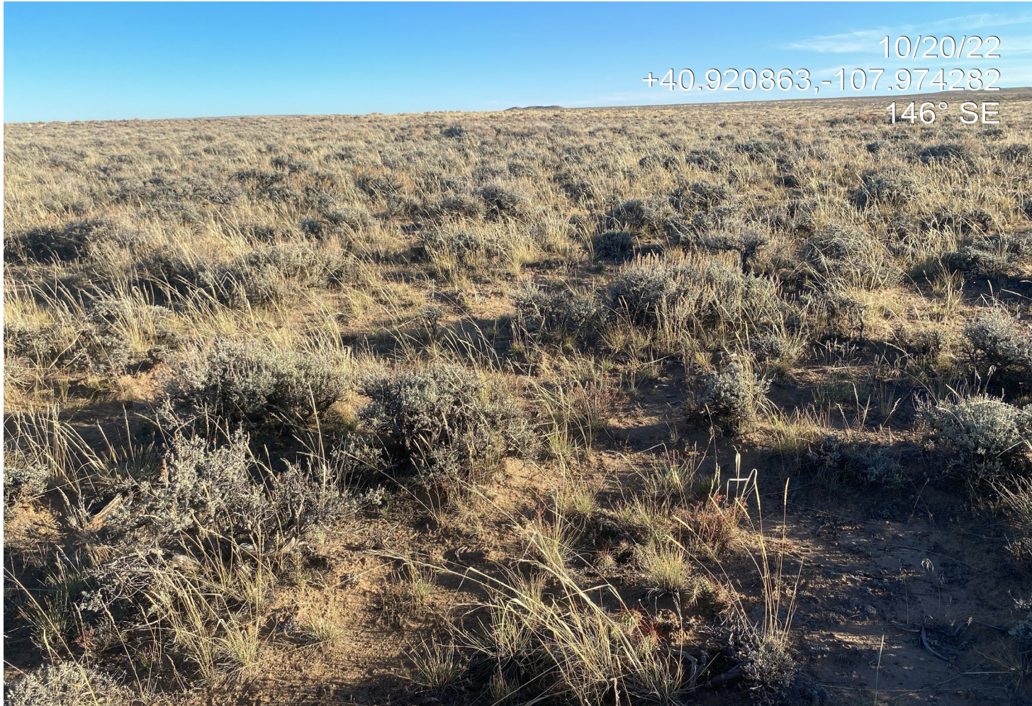
Photo 9. Photo taken to the south shows the reference area vegetation community.