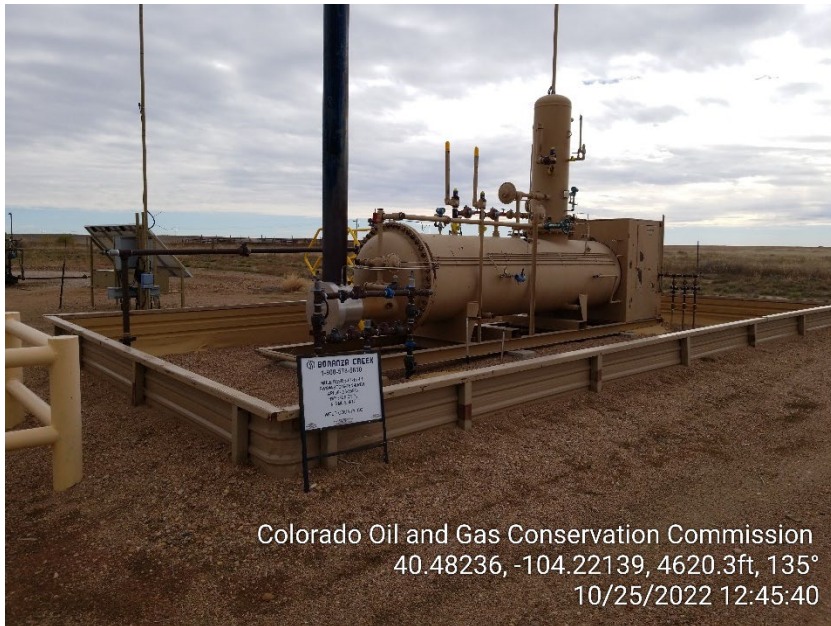
Colorado Oil and Gas Conservation Commission 40.48236, -104.22139, 4620.3ft, 135° 10/25/2022 12:45:40