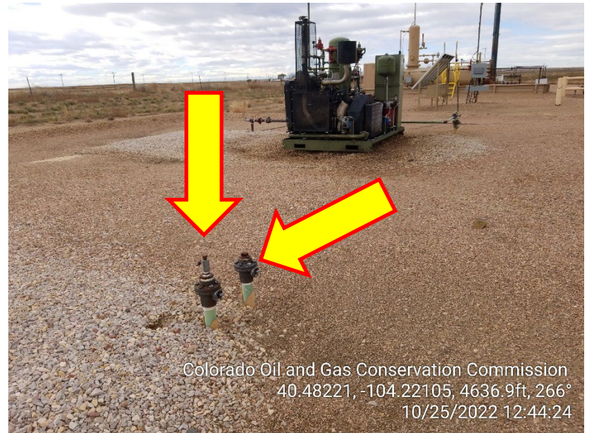
Colorado Oil and Gas Conservation Commission 40.48221, -104.22105, 4636.9ft, 266° 10/25/2022 12:44:24